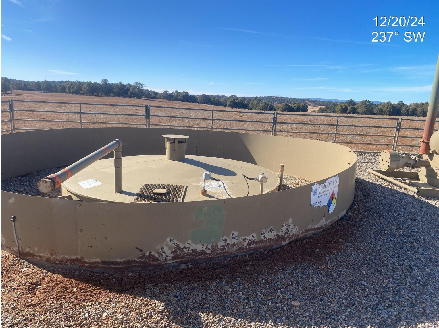
Photo 2. Produced water signs/placards are deteriorating and no longer displaying capacity.