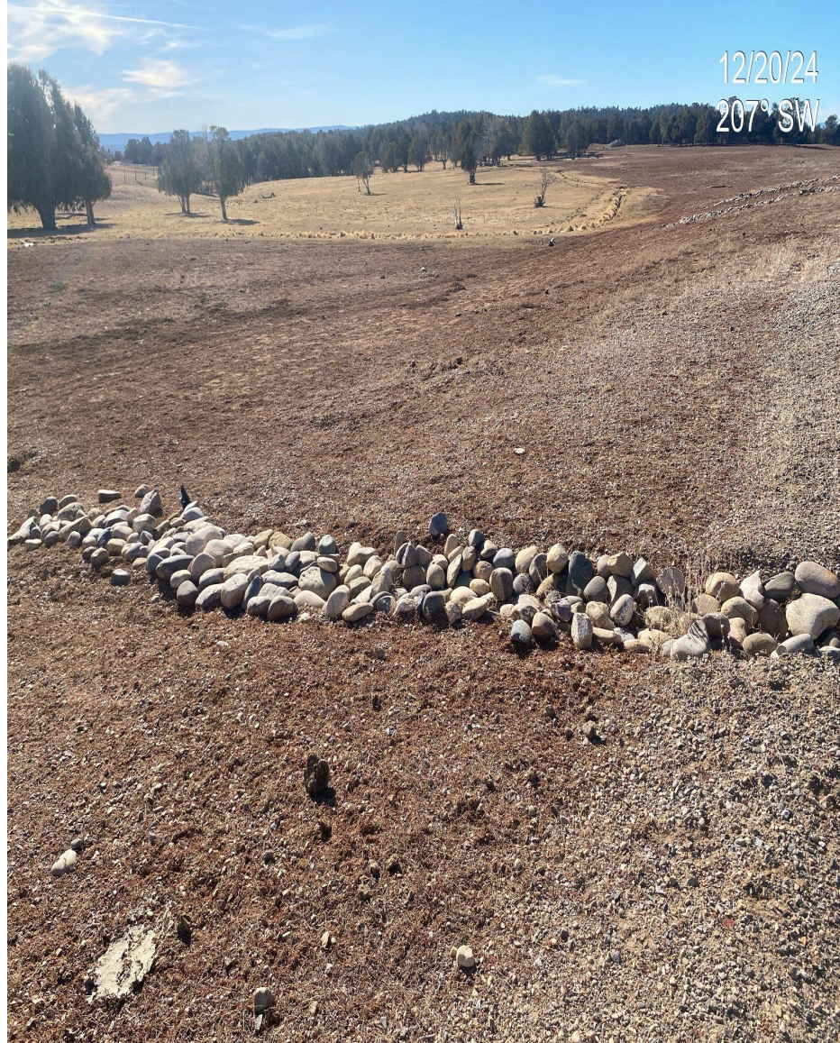
Photo 3. Stormwater appears controlled on the location.