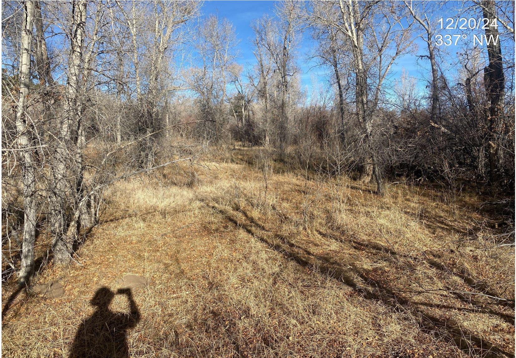
Photo 4. Reference area composed of Smooth Brome and Sand Dropseed.

Inspection Photos Location Name: Paisley 2 Location ID: 326675