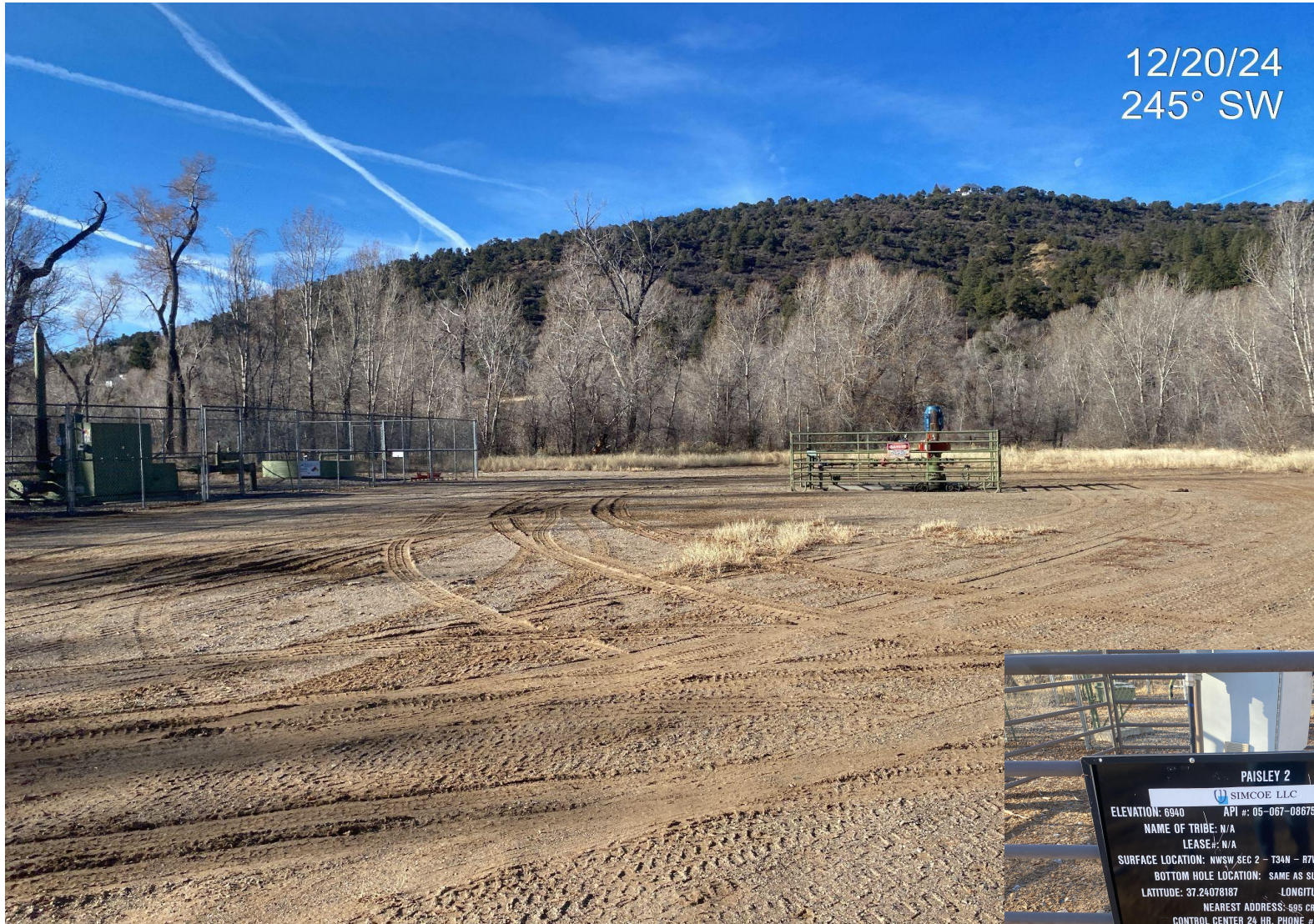
Photo 1. View of well pad taken from the access point facing center.