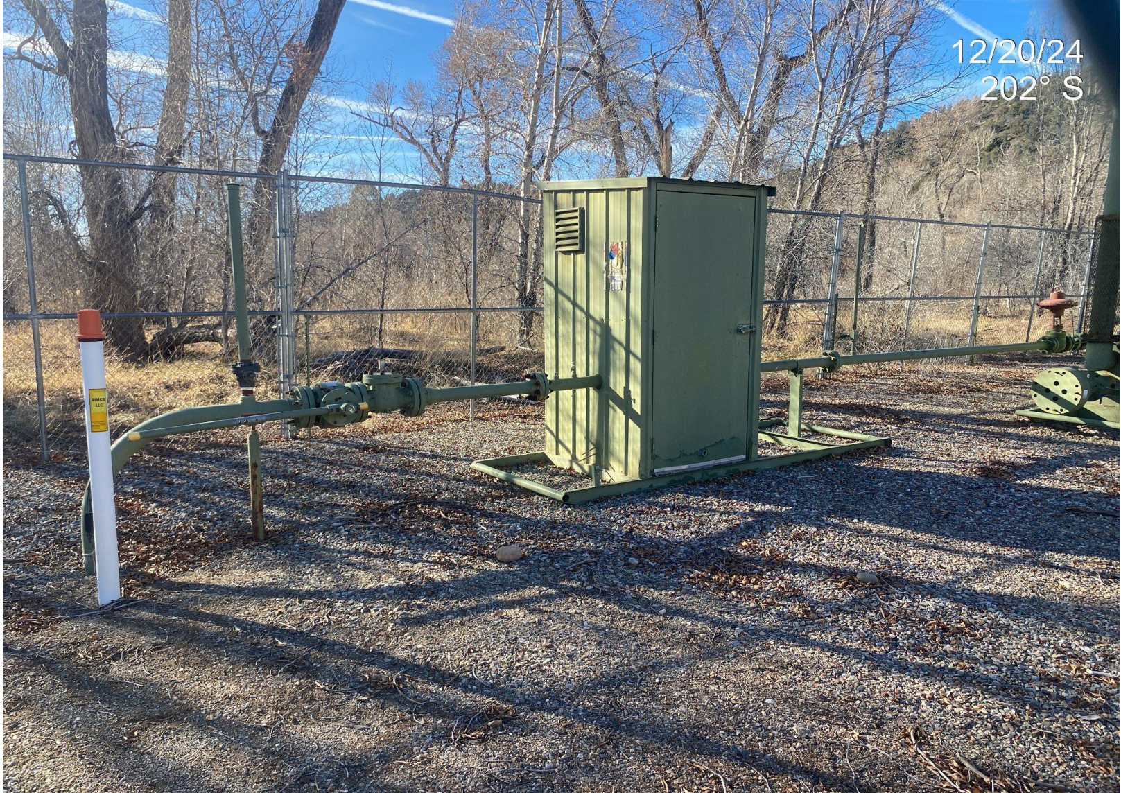
Photo 2. Woody debris have been removed from separator equipment.