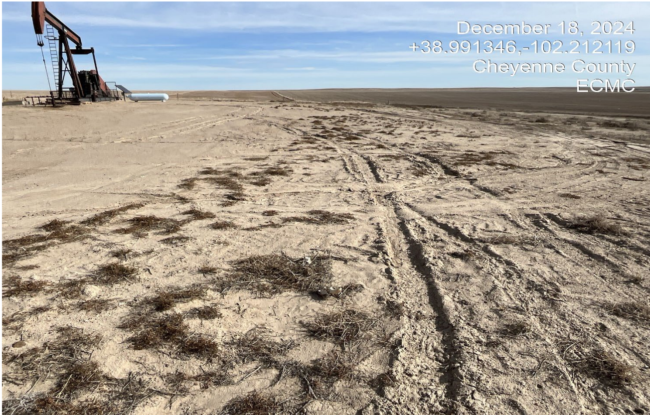
Photo 2. Facing east at the south side of the location. This area is not reclaimed or stabilized.