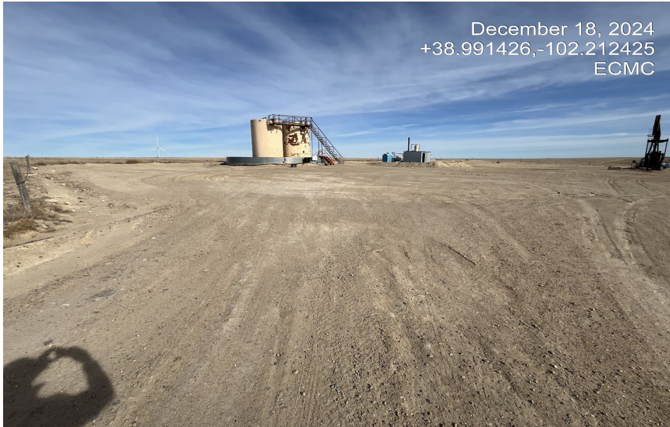
Photo 1. Facing northeast toward the location.