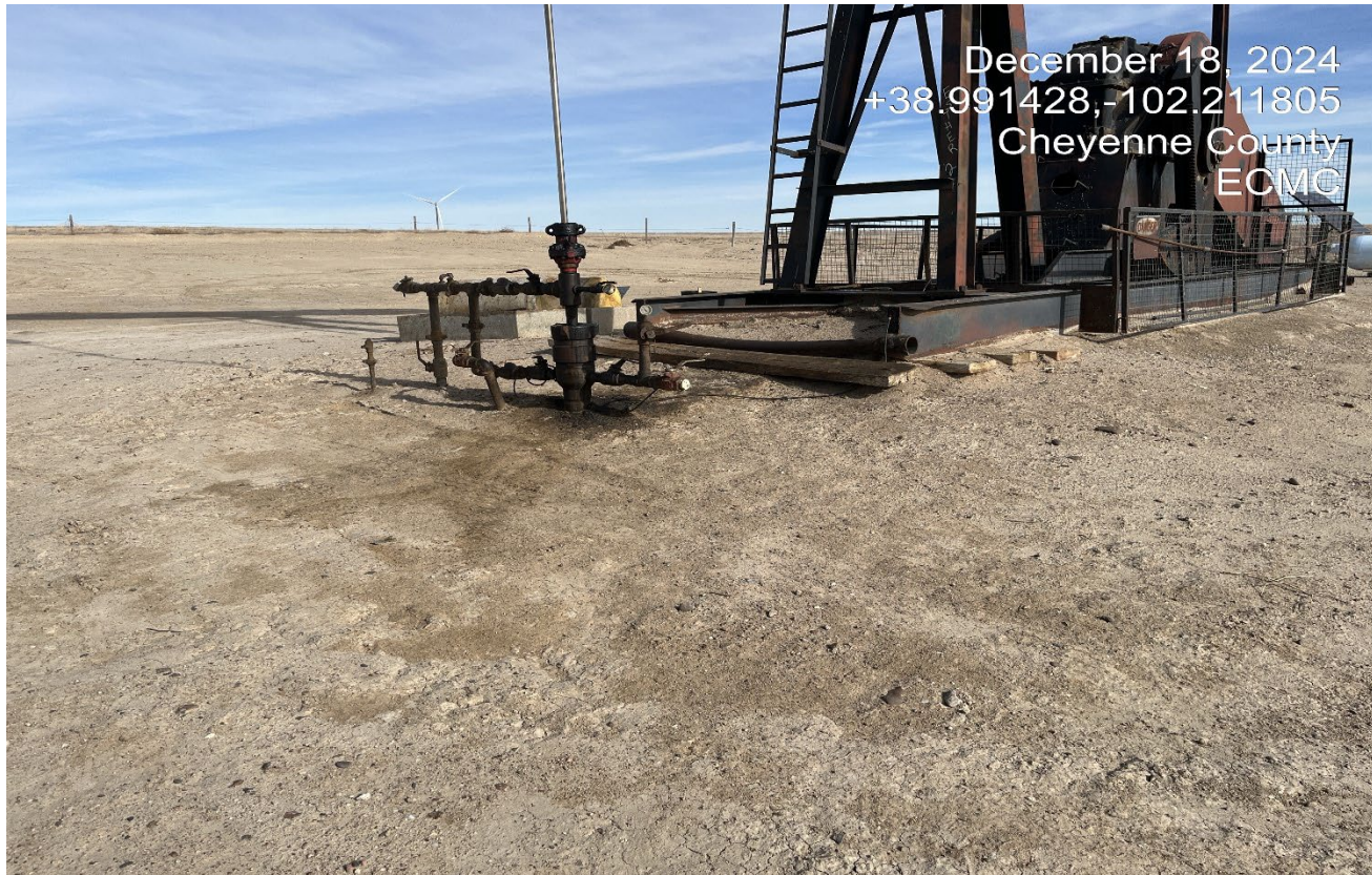
Photo 4. There are stained soils at the wellhead that need to be cleaned up.