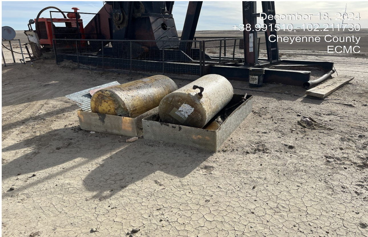
Photo 5. It appears these containers next to the wellhead are unused and need to be removed. There is oily fluid in the containment.