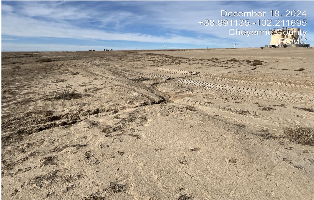
Photo 3. There is erosion along the south side of the location and soils are not stabilized.