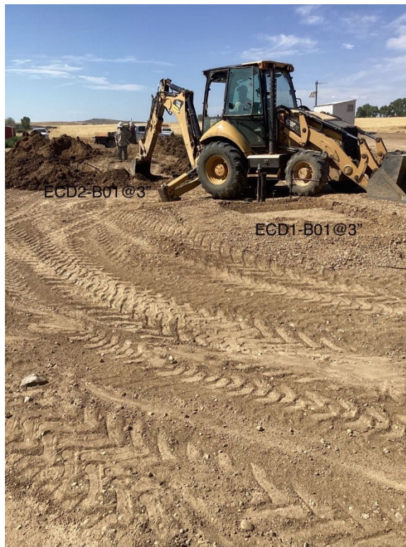
ECD1 & ECD2