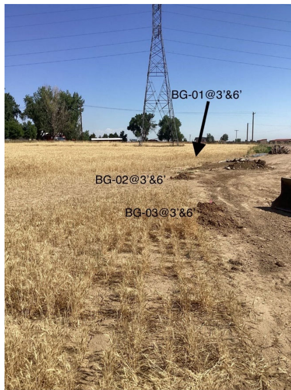
BG-01, BG-02, BG-03