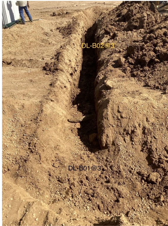
DL-B01 & DL-B02