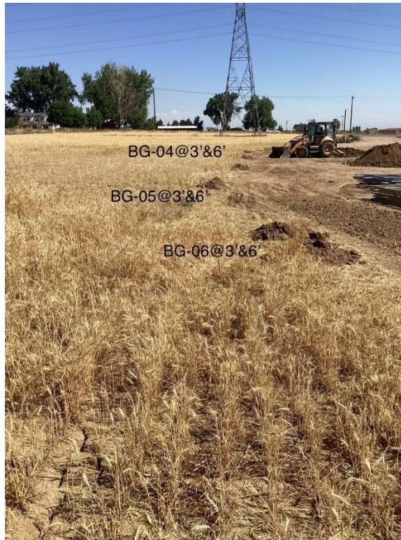
BG-04, BG-05, BG-06