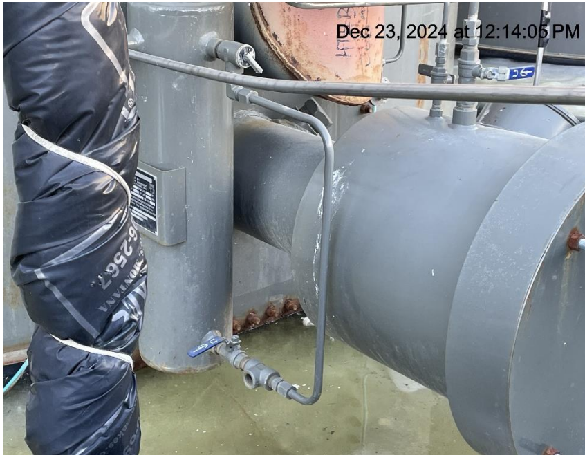
Photo # 4976 PRV vent line does not comply with CECMC pressure safety device rules