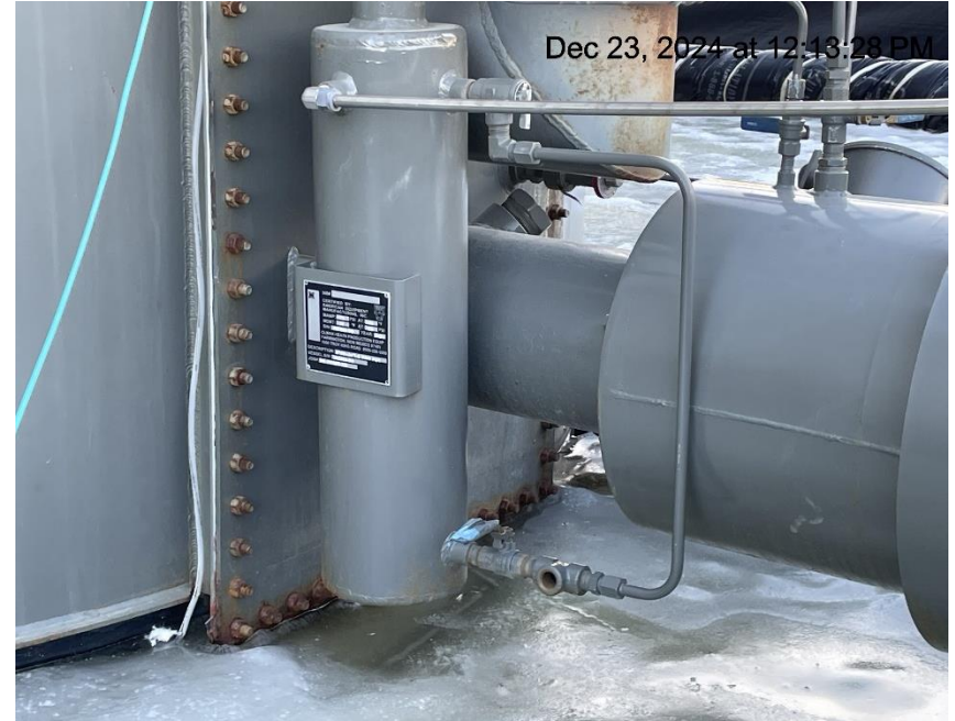
Photo # 4975 PRV vent line does not comply with CECMC pressure safety device rules