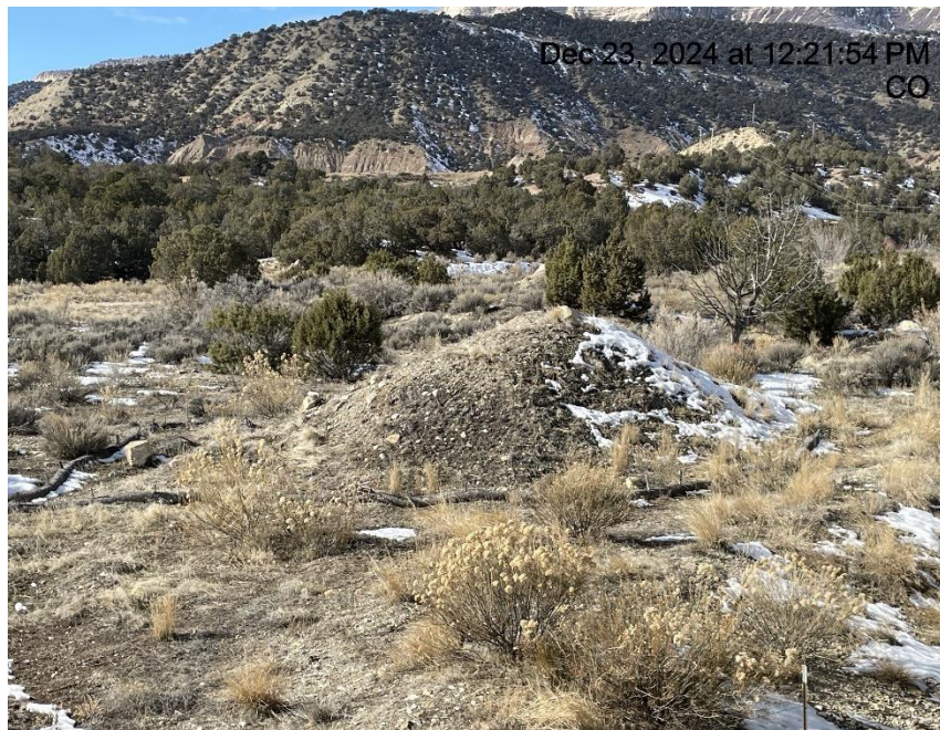
Photo # 4978 Stockpiled soils with wattles for BMP's (W/NW of location in the interim area)