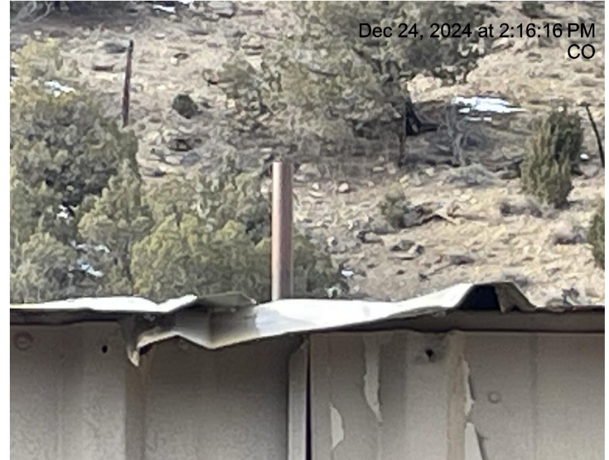
Photo # 5582 PRV vent line does not comply with CECMC pressure safety device rules