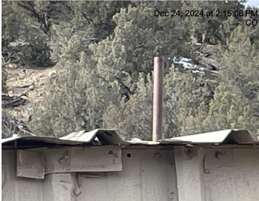
Photo # 5581 PRV vent line does not comply with CECMC pressure safety device rules