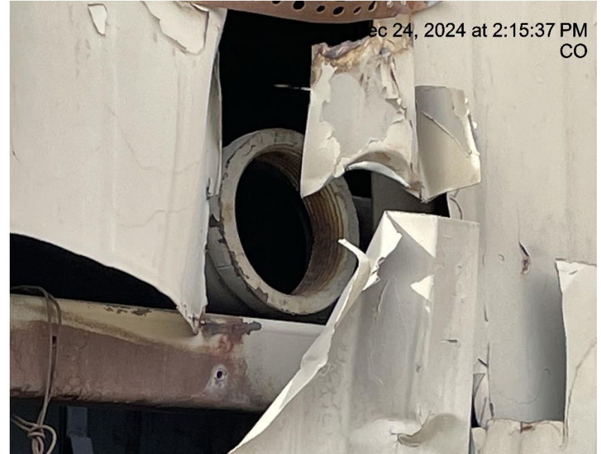
Photo # 5580 PRV vent line does not comply with CECMC pressure safety device rules