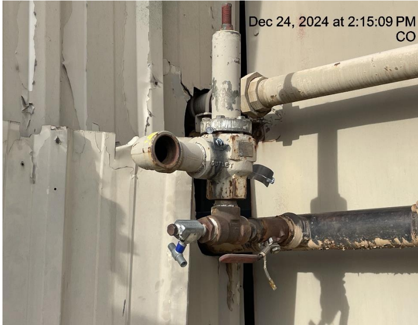
Photo # 5579 PRV vent line does not comply with CECMC pressure safety device rules