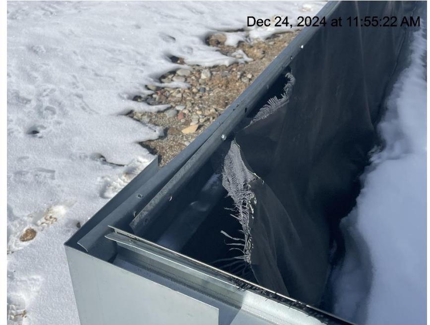
Photo # 5280 Secondary containment liner showing signs of damage/disrepair near top of metal containment ring