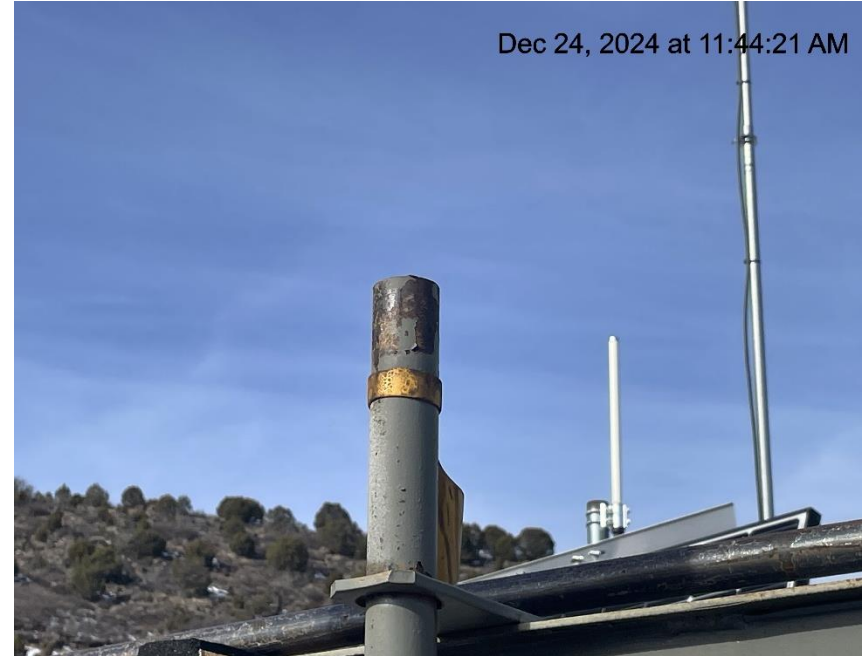
Photo # 5276 PRV vent line does not comply with CECMC pressure safety device rules