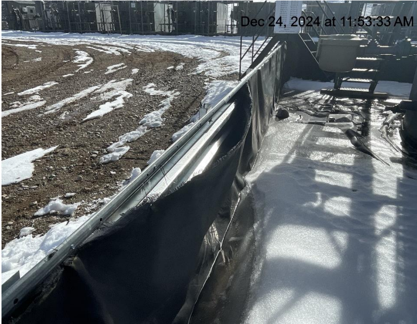
Photo # 5279 Secondary containment liner showing signs of damage/disrepair near top of metal containment ring