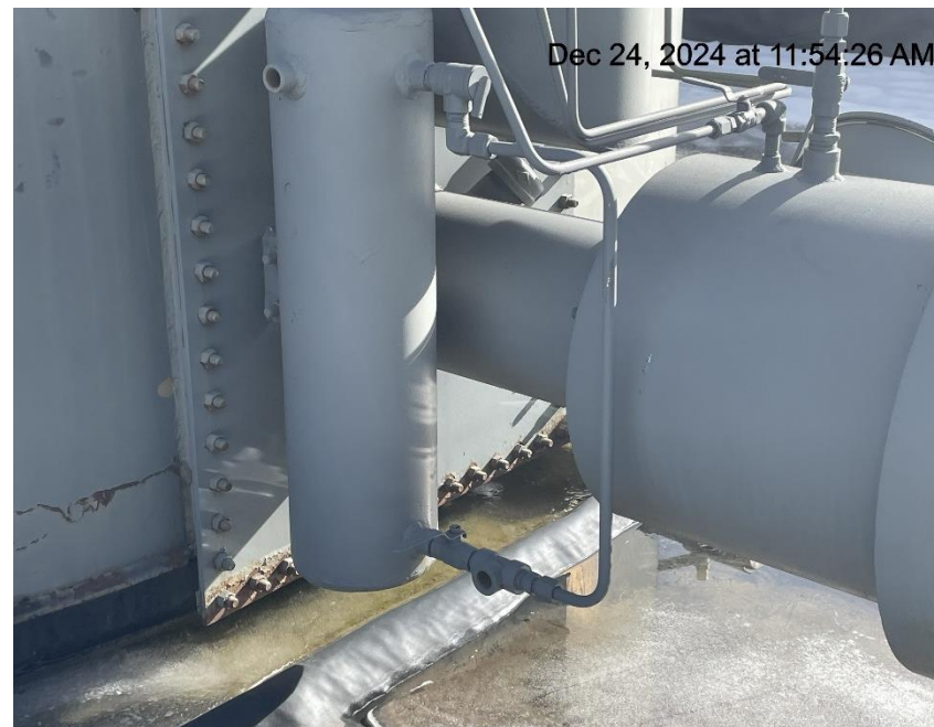
Photo # 5274 PRV vent line does not comply with CECMC pressure safety device rules