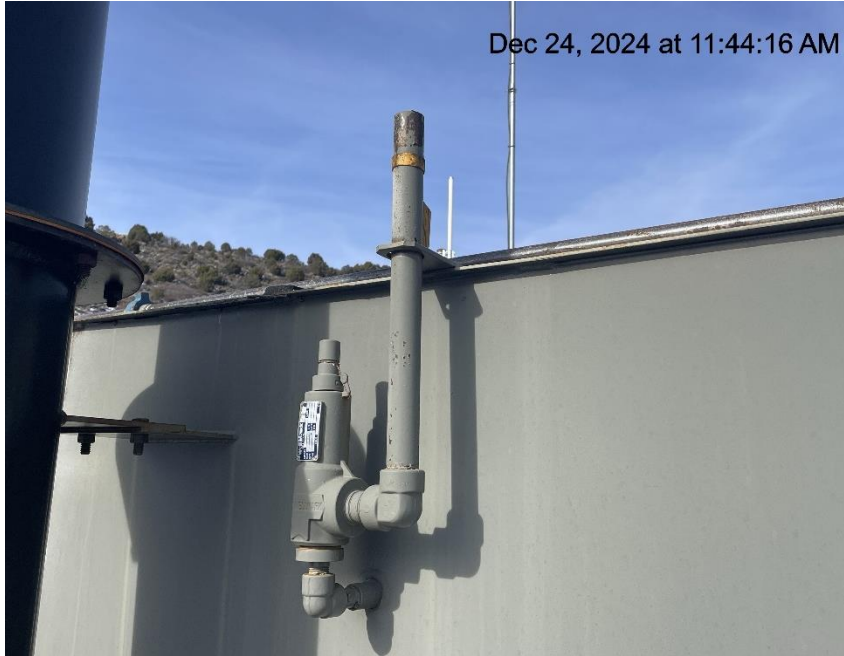
Photo # 5275 PRV vent line does not comply with CECMC pressure safety device rules