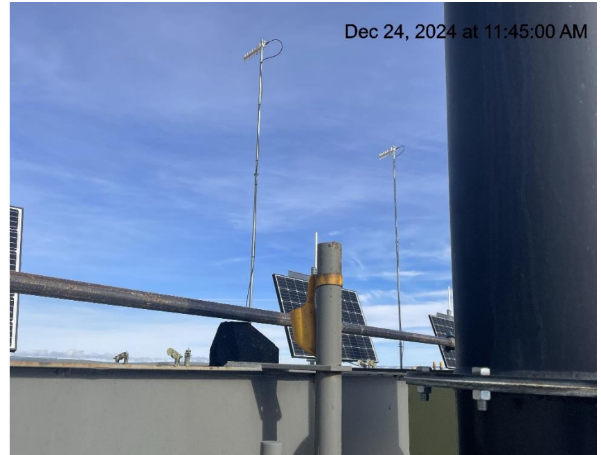
Photo # 5277 PRV vent line does not comply with CECMC pressure safety device rules