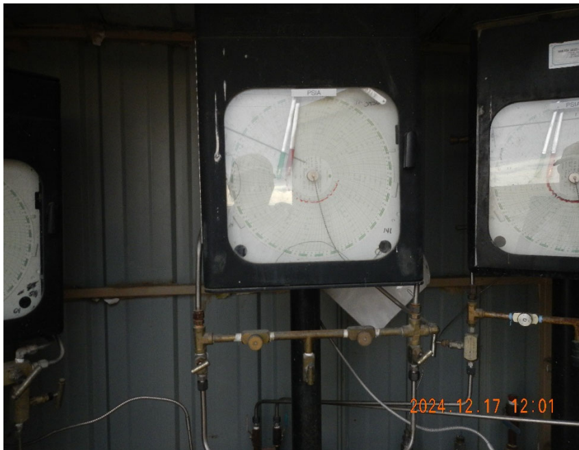
5. Gas meter inside meter shed,