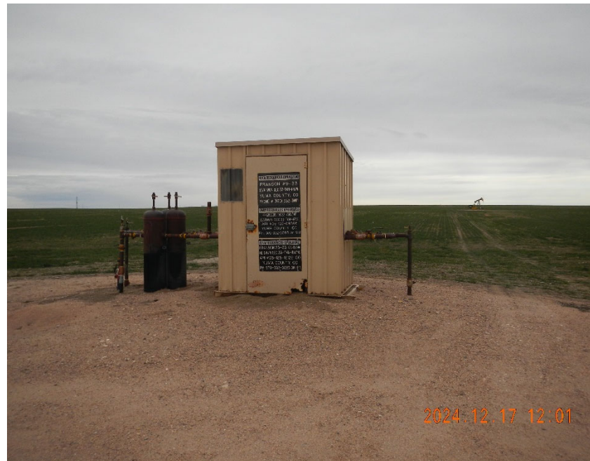
6. Remote shared gathering location overview.