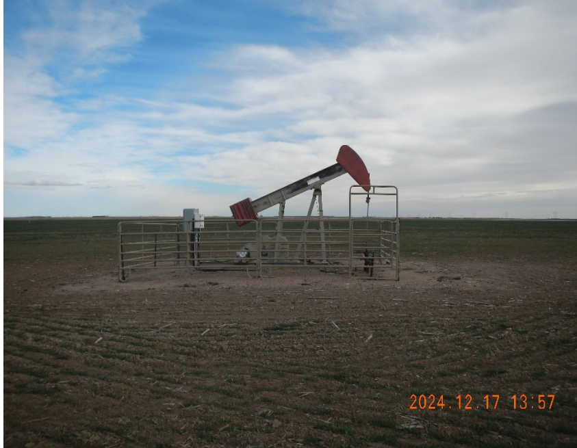
3. Well location overview.