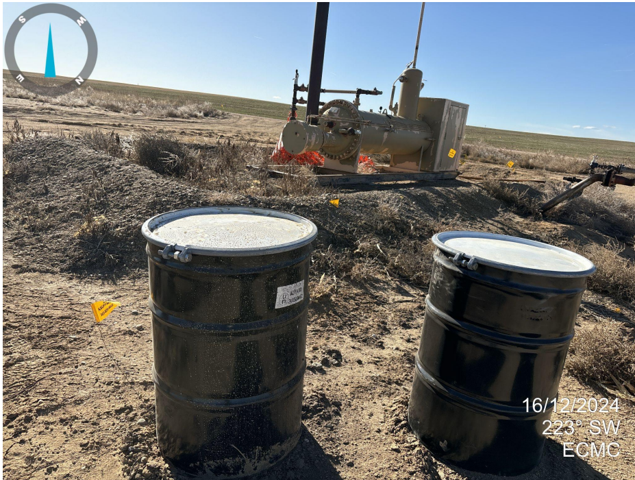
Photo 4. Unlabeled barrels potentially associated with groundwater monitoring project.