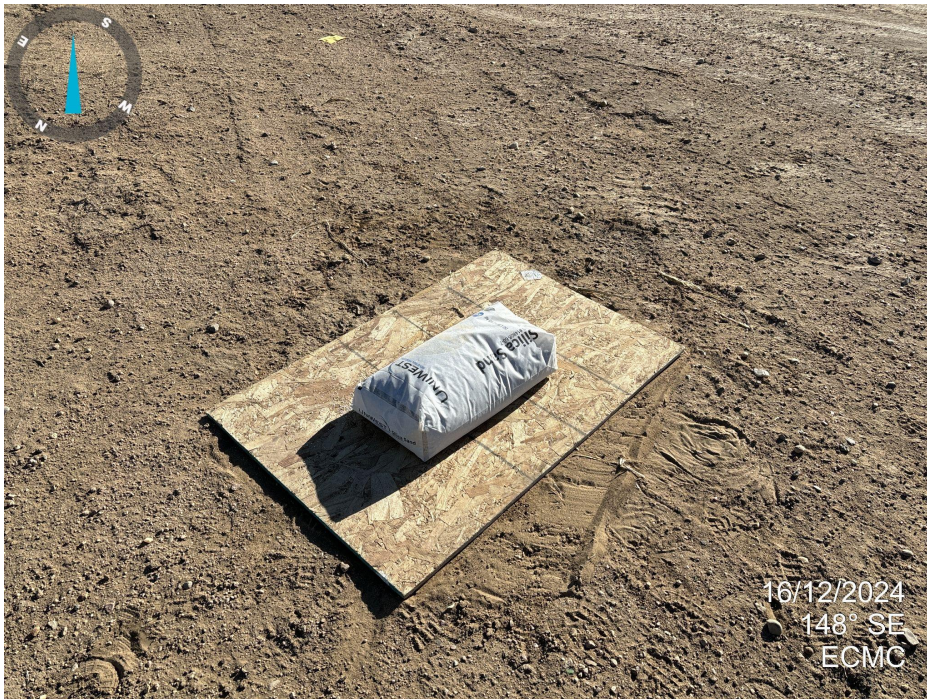
Photo 1. Proposed monitoring well holes appear to have been dug.