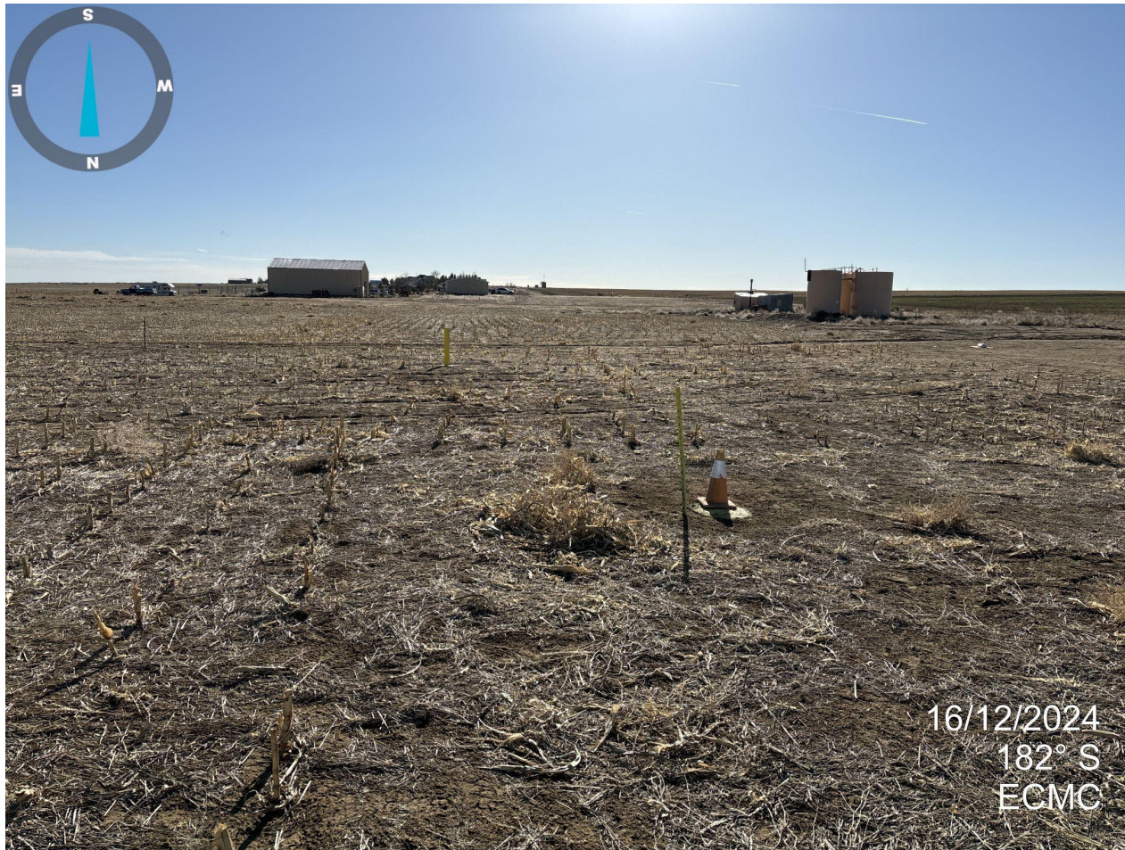
Photo 7. Monitoring wells in place. Photo looking south near MW-03.