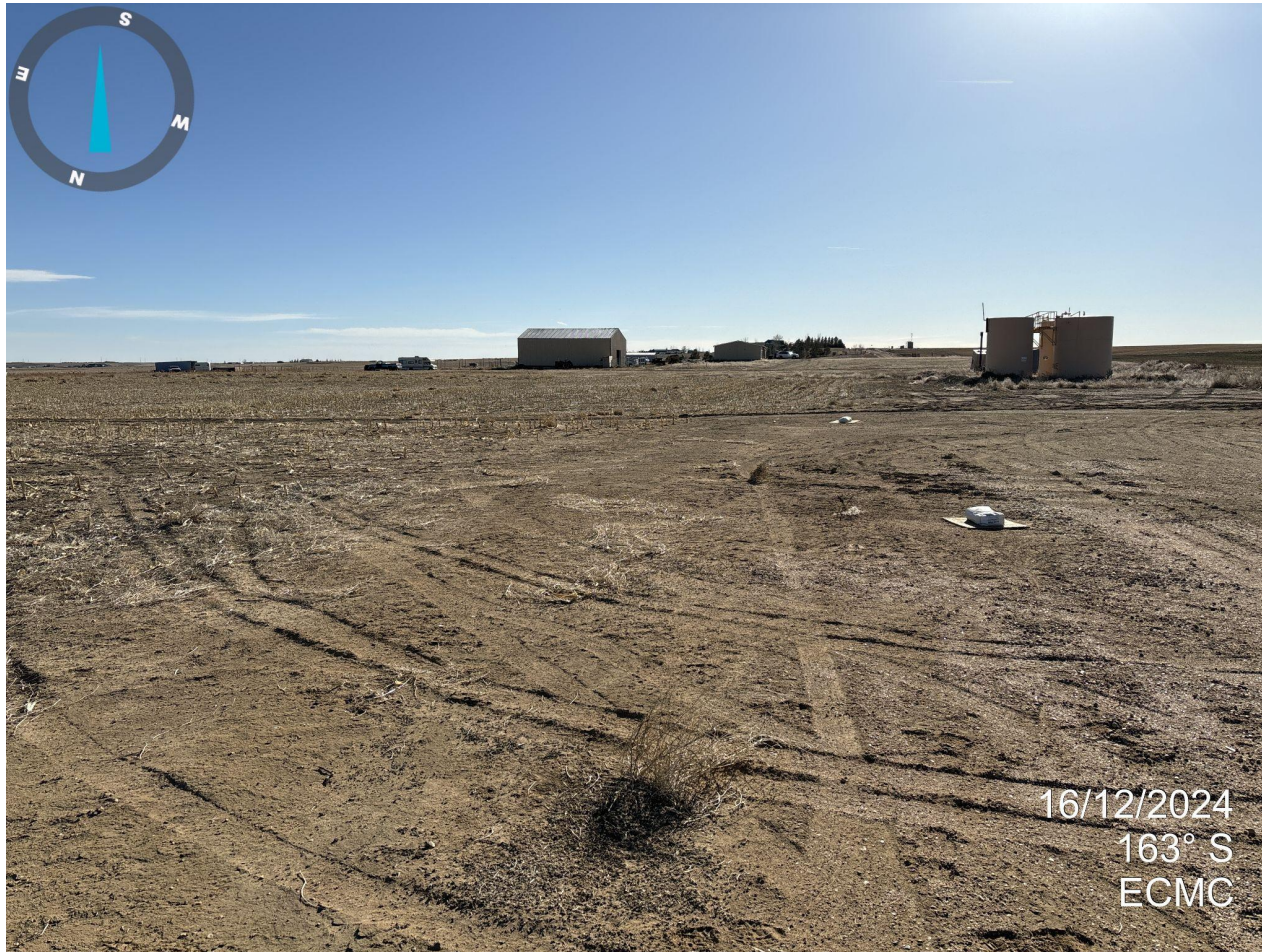
Photo 6. Looking south from east of the tank battery.