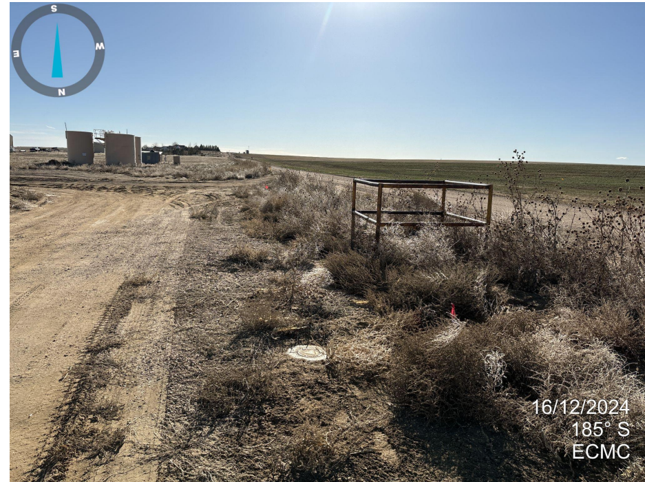
Photo 5. Photo taken west of Dottie-Doris separator looking south.