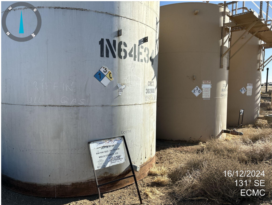
Photo 1. Photo taken from the north side of tank battery. Sign reads DOTTIE 11-33.