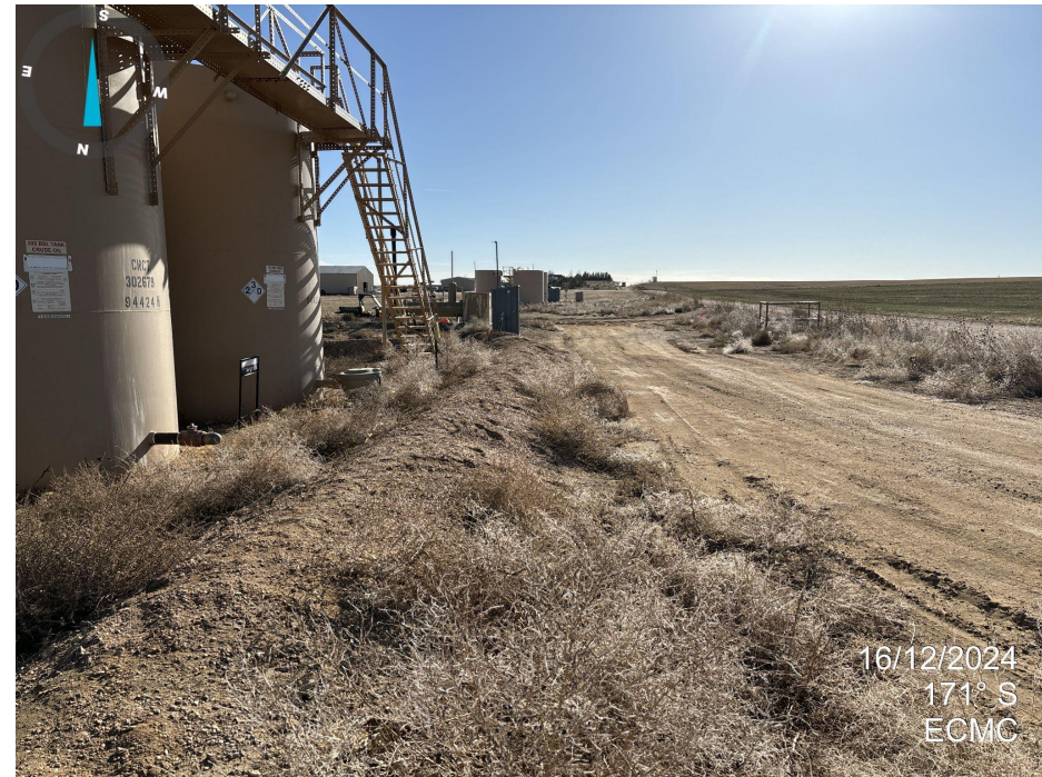
Photo 2. Looking south across tank battery. Undesirable annual vegetation is present throughout the location including Kochia and Russian thistle. This tank battery area is shared with Doris 12-34 (Loc 318979)