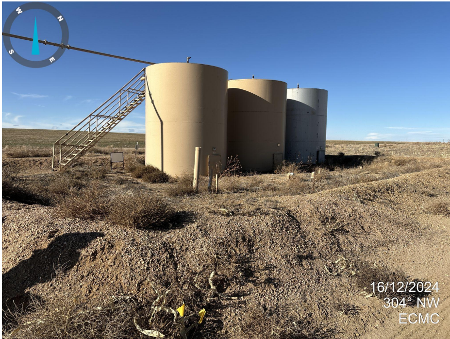
Photo 3. Picture taken east of tank battery looking west. Uncapped pipes and trash are present on location.