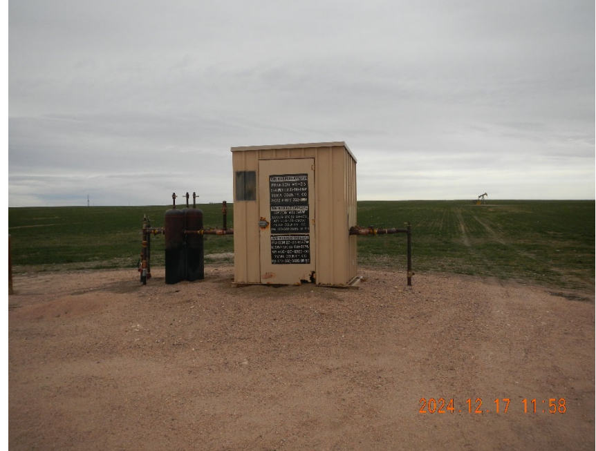
6. Remote shared gathering location overview.