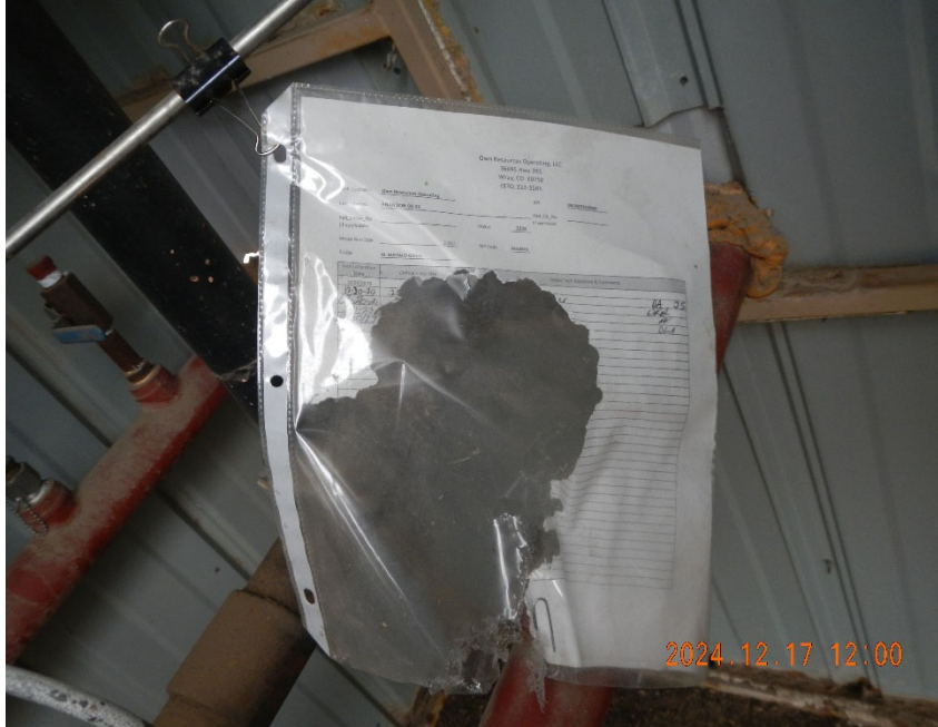
5. Meter calibration log inside meter shed.