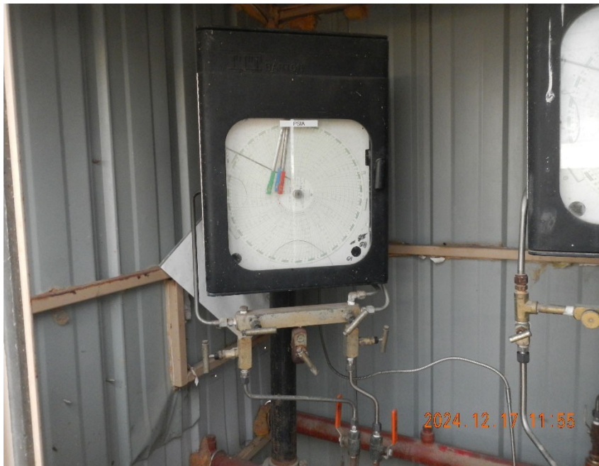
5. Gas meter inside meter shed.