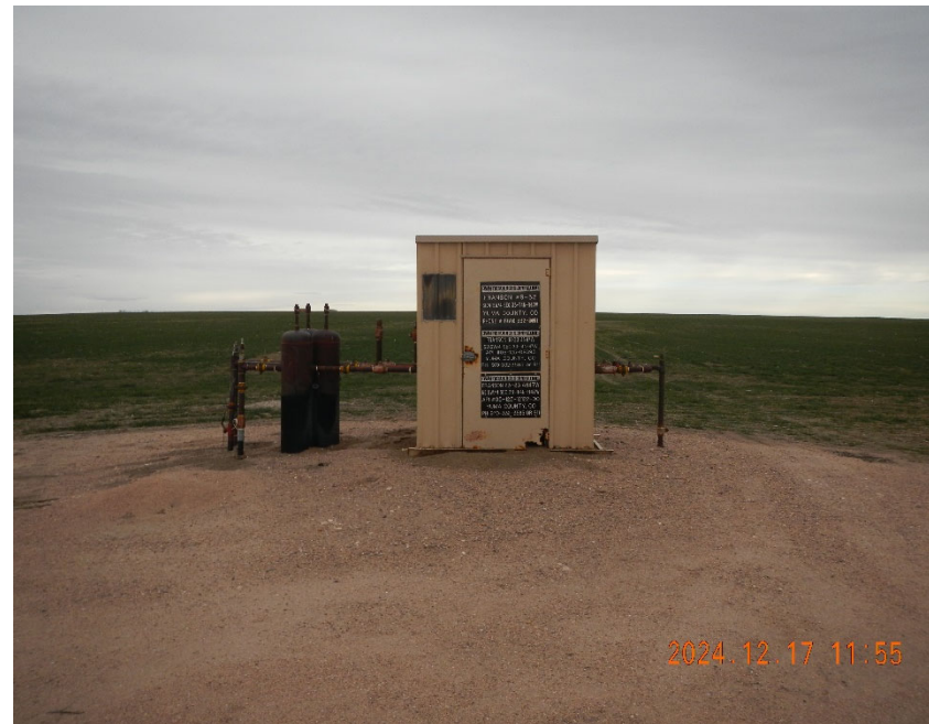
6. Remote shared gathering location overview.