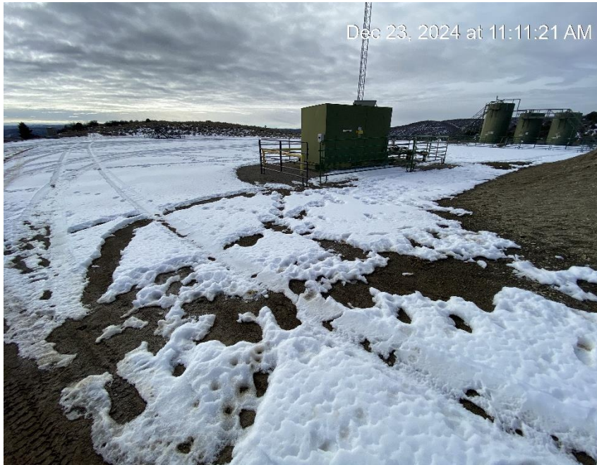
Location from Southeast entrance