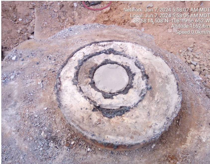
Cement to surface.