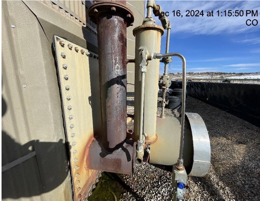
Photo # 3858 PRV vent line on tank burner does not comply with CECMC pressure safety device rules