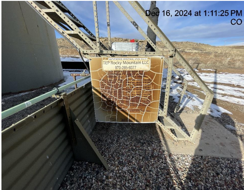
Photo # 3852 Battery sign weathered & cracking/some info is illegible/sign does not comply with CECMC rules