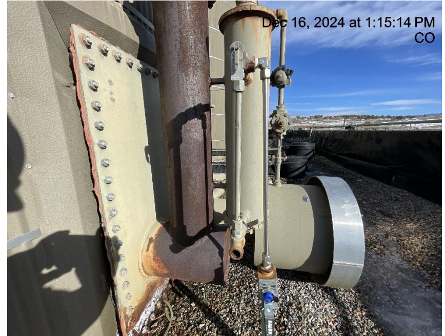
Photo # 3859 PRV vent line on tank burner does not comply with CECMC pressure safety device rules