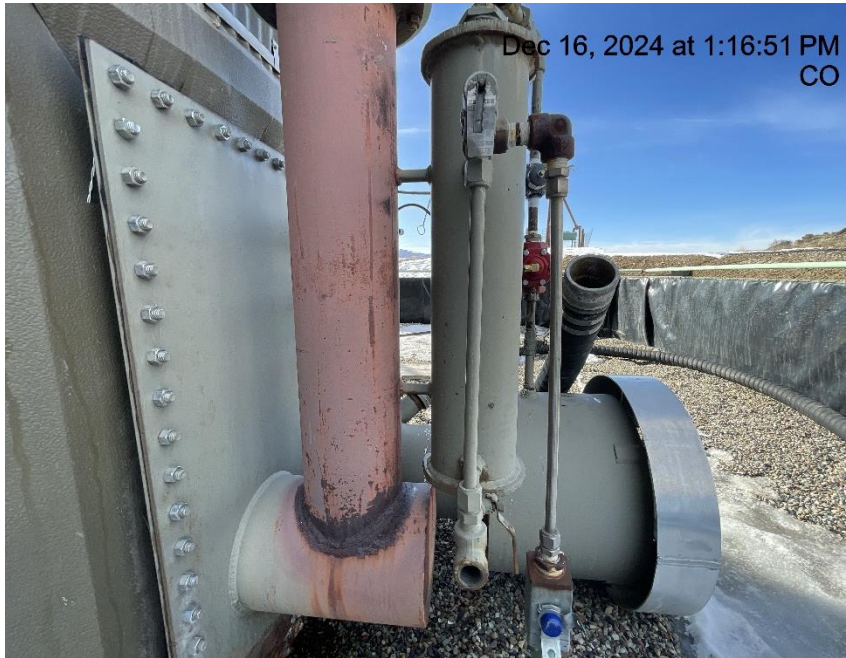
Photo # 3856 PRV vent line on tank burner does not comply with CECMC pressure safety device rules