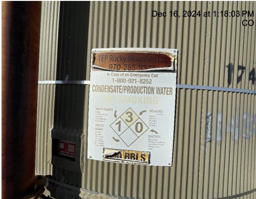
Photo # 3854 Tank label weathered & some required info is illegible/does not comply with CECMC rules