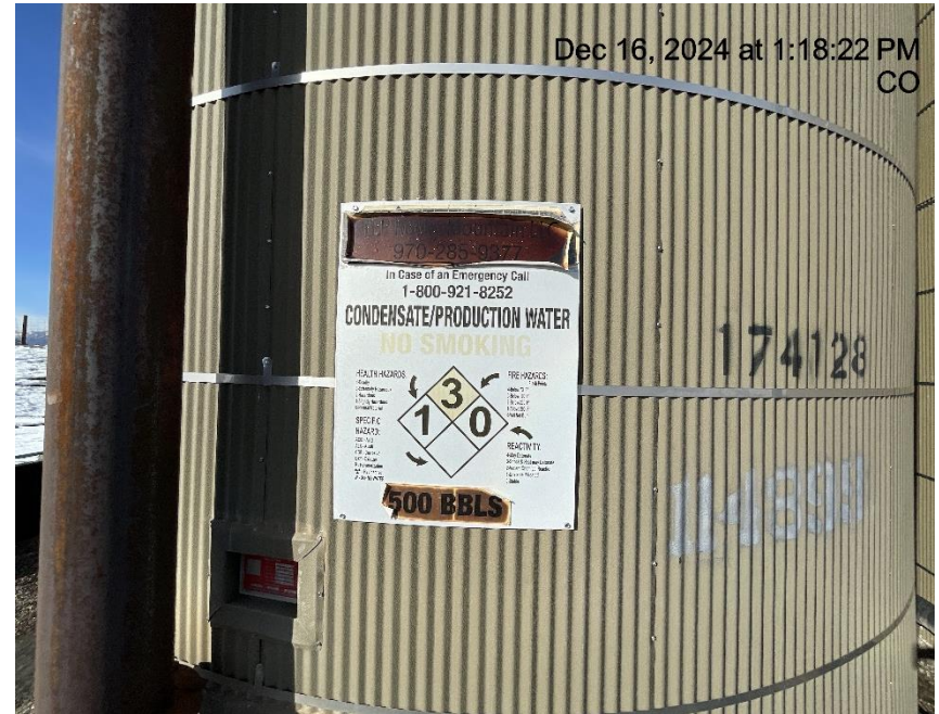
Photo # 3855 Tank label weathered & some required info is illegible/does not comply with CECMC rules