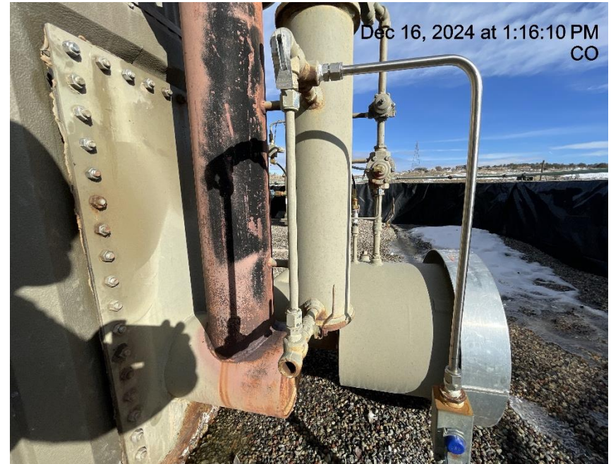
Photo # 3857 PRV vent line on tank burner does not comply with CECMC pressure safety device rules