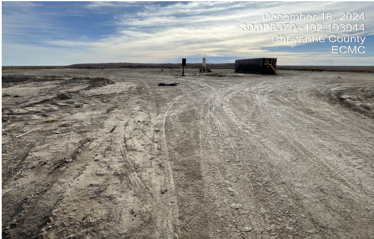
Photo 3. Facing south toward the wellsite..