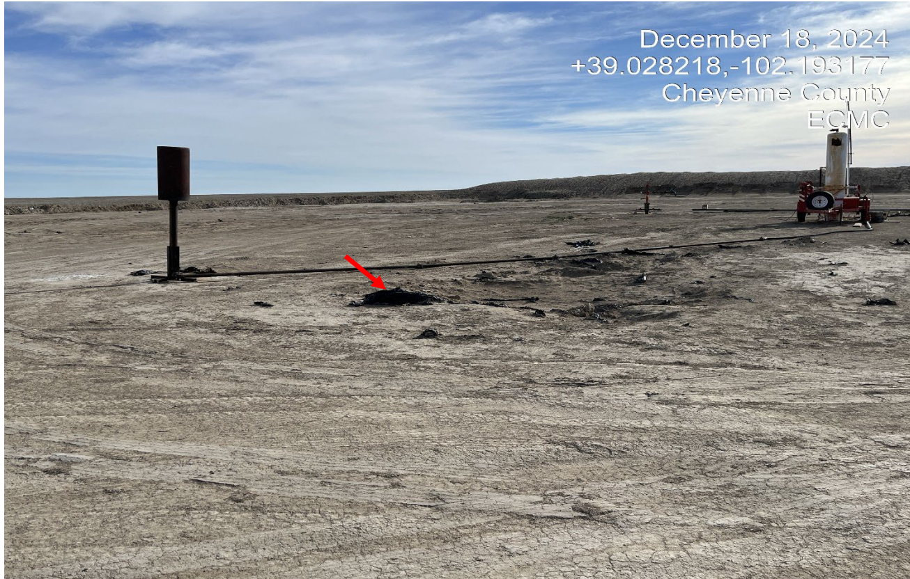
Photo 4. There is a flaring unit at the location which was approved for 96 hours of use. There is torn plastic liner throughout this area shown at red arrow.