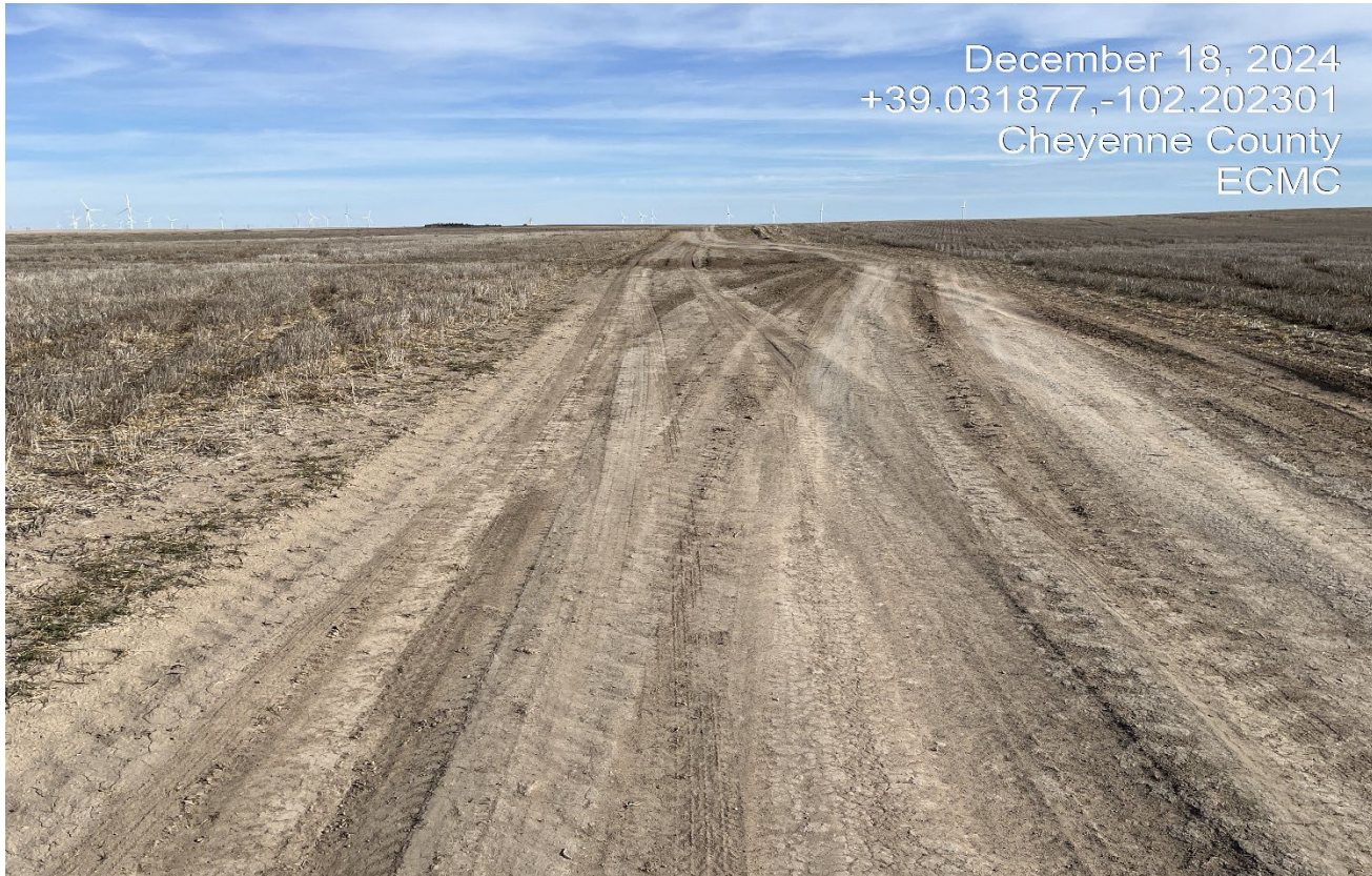
Photo 1. Facing east along the access road. Vehicles are avoiding the eroded area of the road causing unnecessary disturbance. The road needs to be repaired and stabilized.