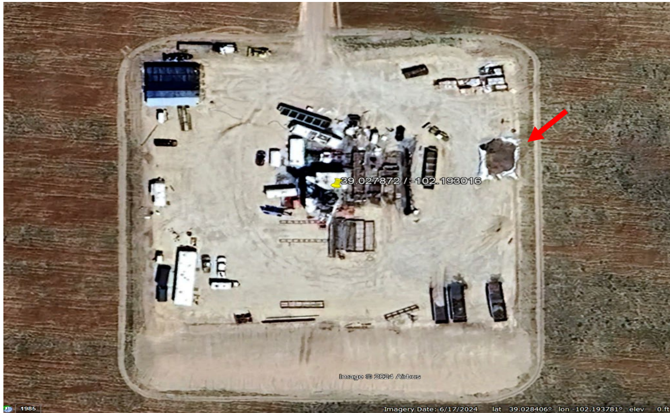
Photo 11. Satellite imagery taken during the drilling process shows the plastic liner and cuttings stored at the same area where cutting remain in previous photo..