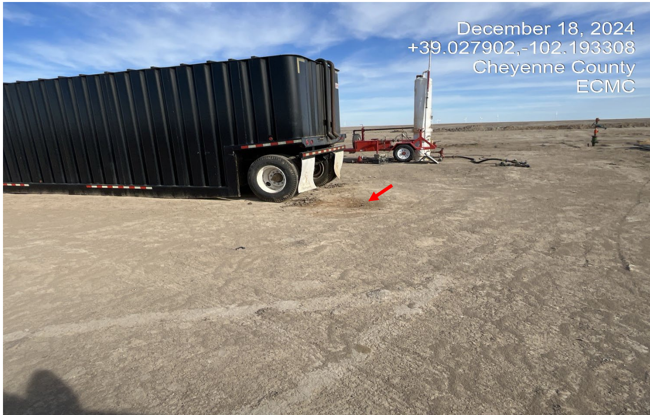
Photo 5. There is no secondary containment around this tank and there are stained soils shown at red arrow.