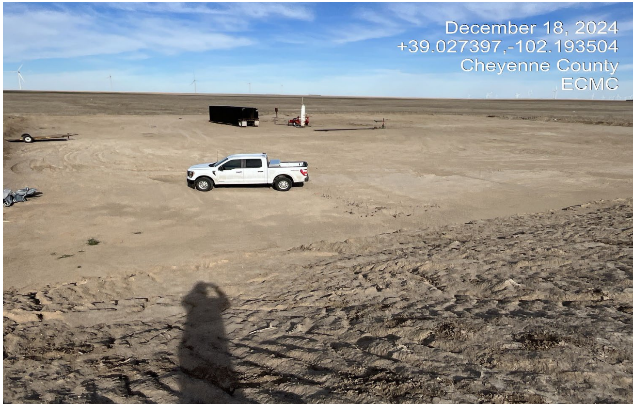
Photo 6. Facing northeast overlooking the location.