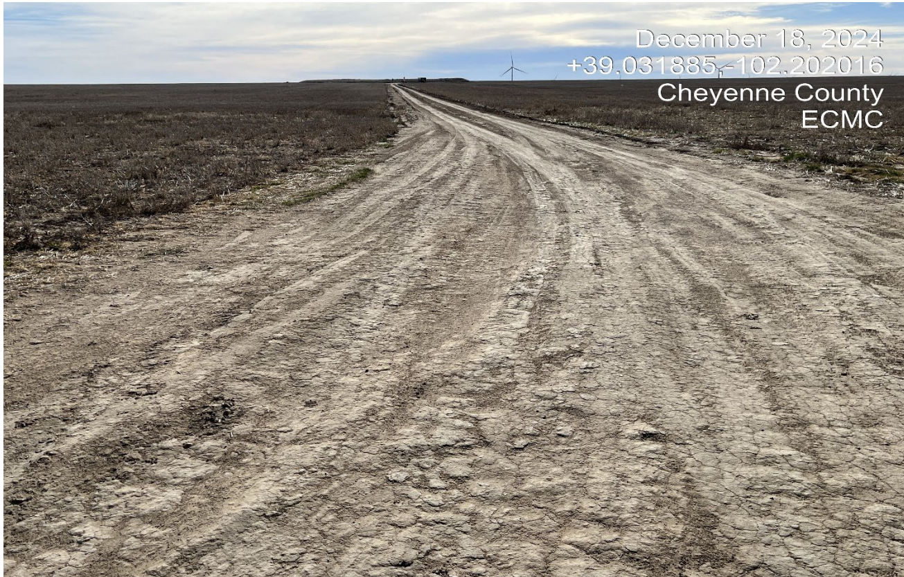
Photo 2. Facing south along the access road. The access road needs to be reduced in size by reclaiming and decompacting soils.