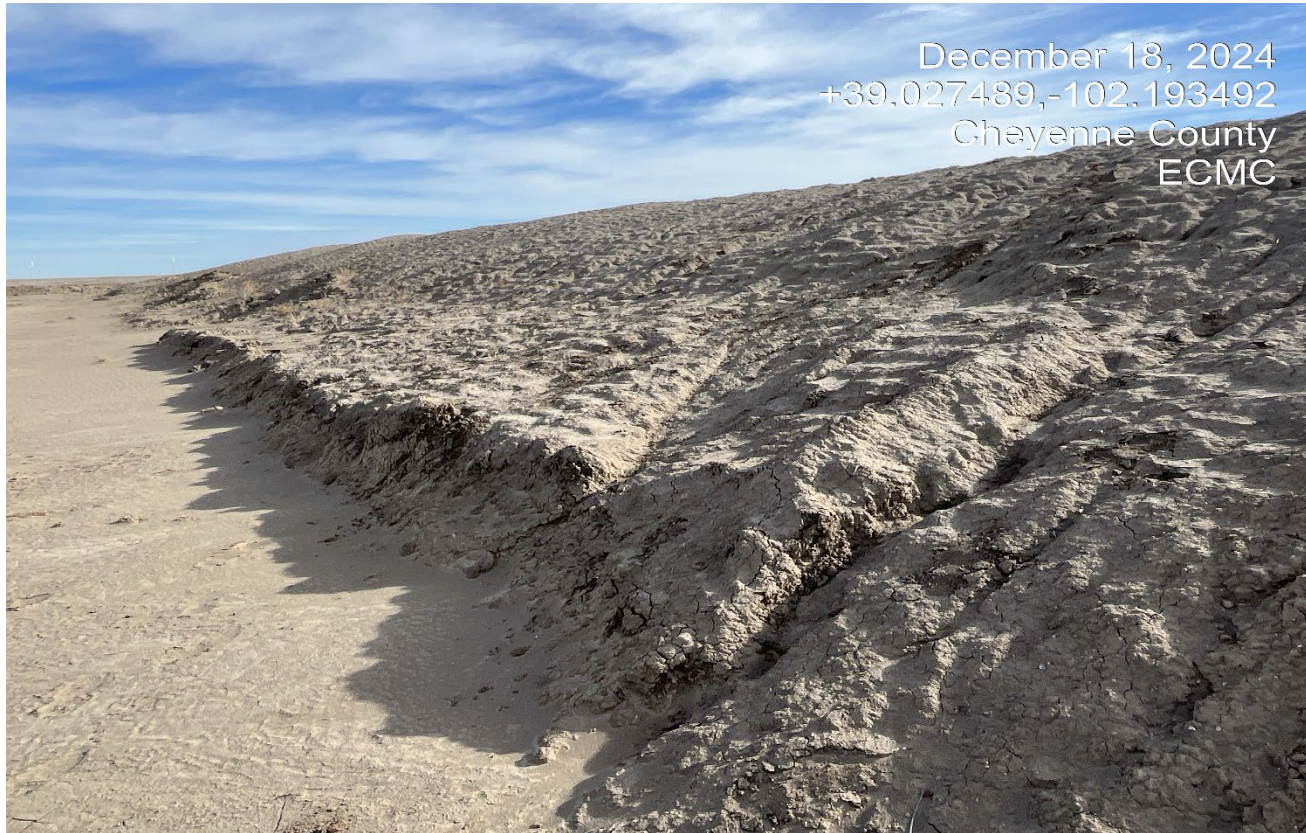
Photo 7. There is erosion along the topsoil pile at the south side of the location.