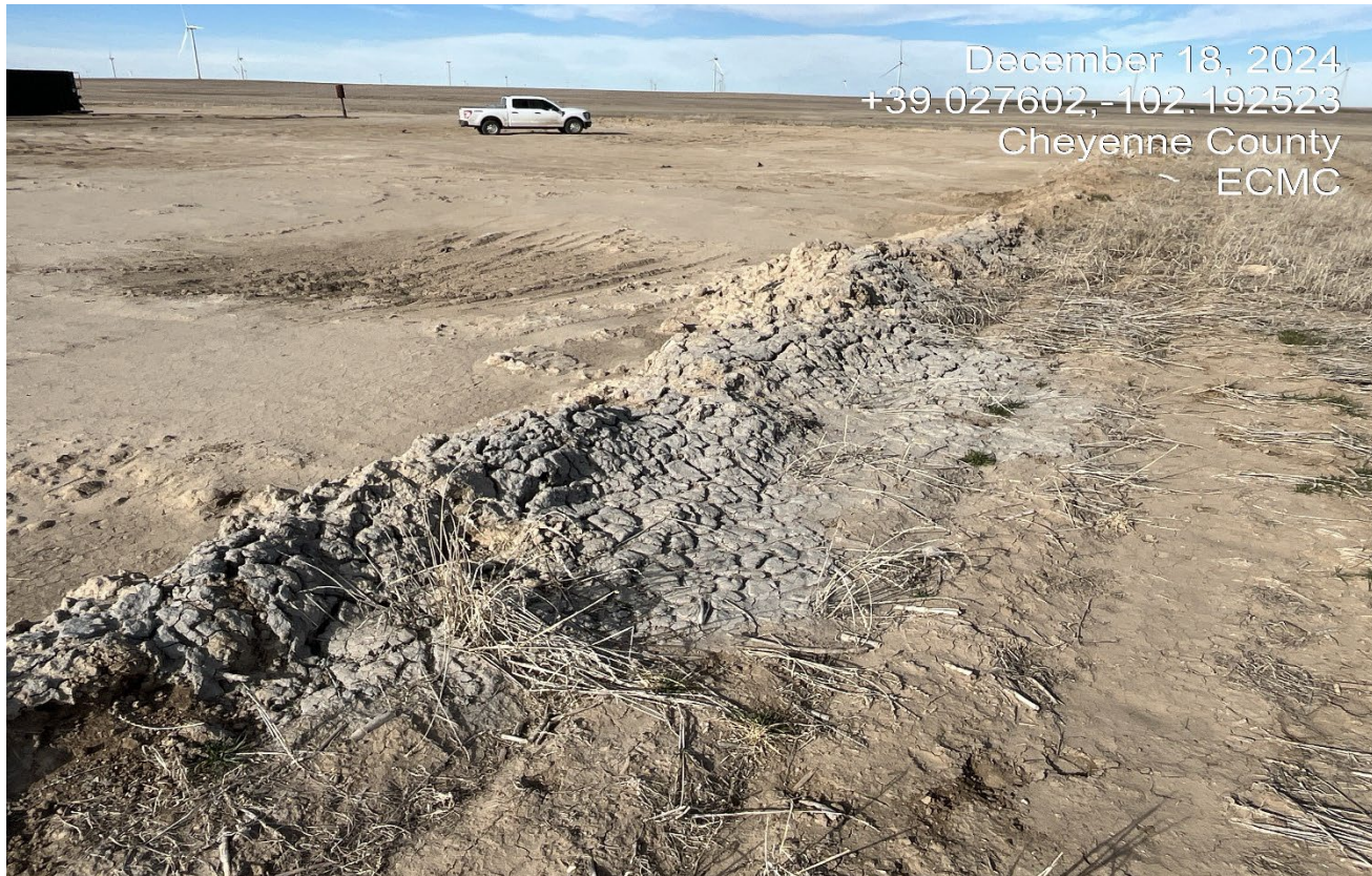
Photo 10. The material along the east side of the pad has grey and reddish color indication this material is drill cuttings that were not properly disposed.