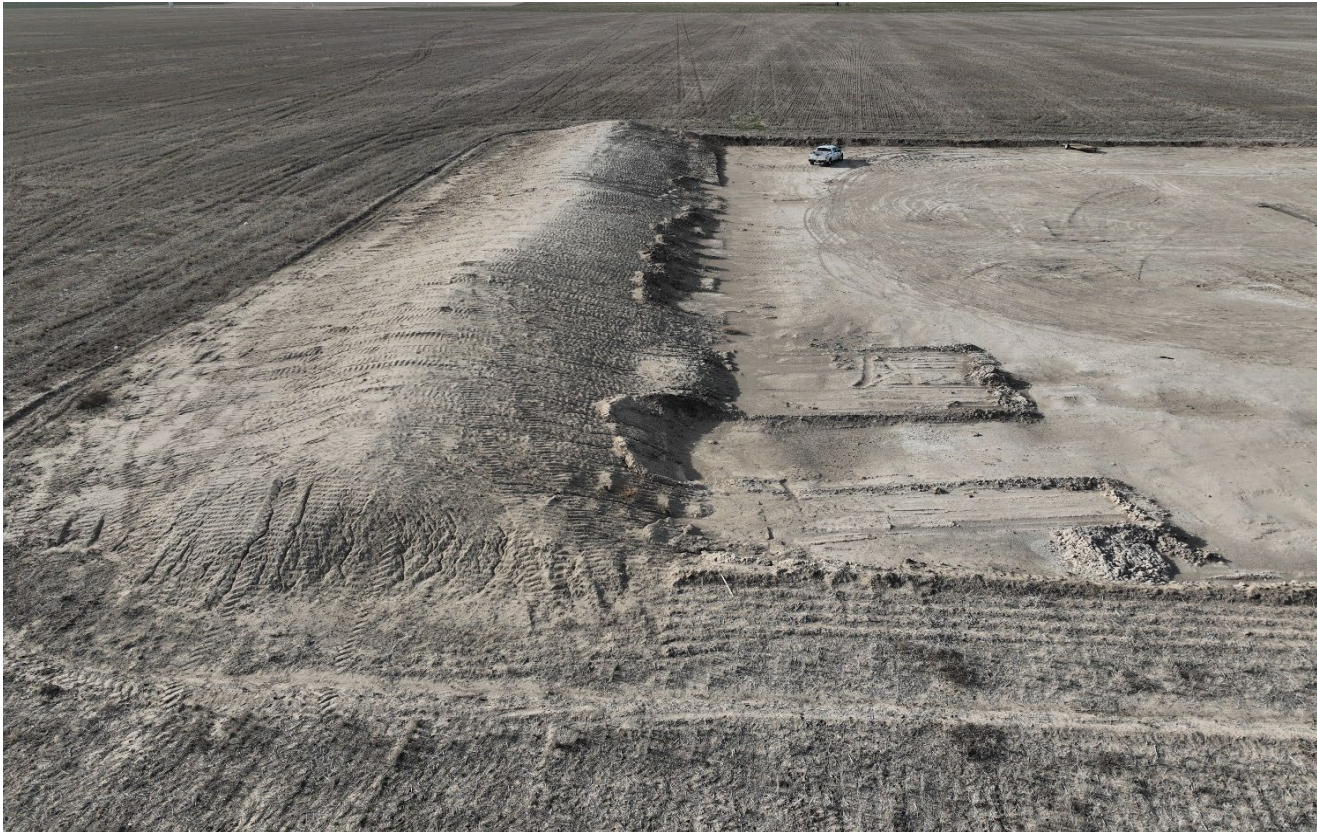
Photo 13. Drone aerial photo facing west toward the topsoil pile.