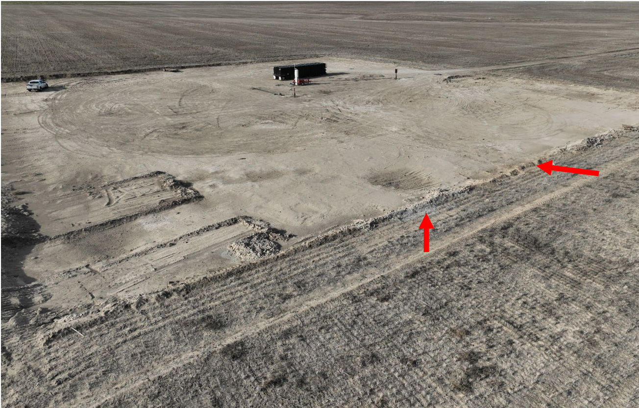
Photo 12. East side of the location facing northwest. Red arrows point to where cuttings was observed along the side of the location.