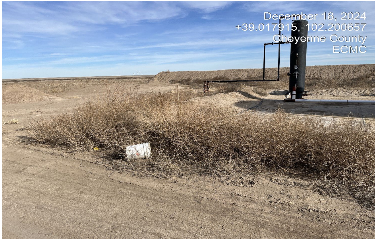
Photo 5. There are undesirable weeds growing along the berm that must be controlled. The white bucket needs to be removed as well.