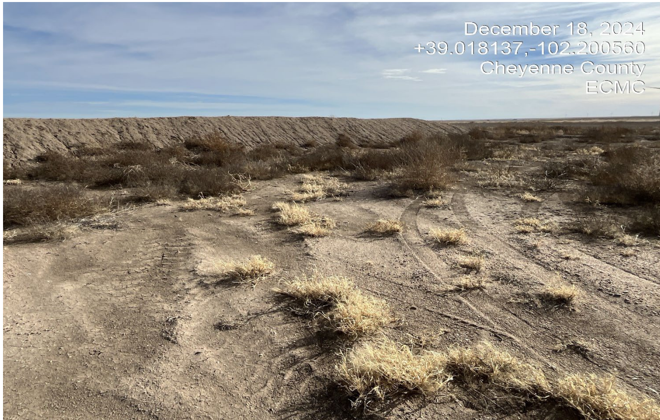
Photo 7. Facing southeast at the location. The topsoil pile at the east side of the location has not been replaced and there is erosion and weed infestation.