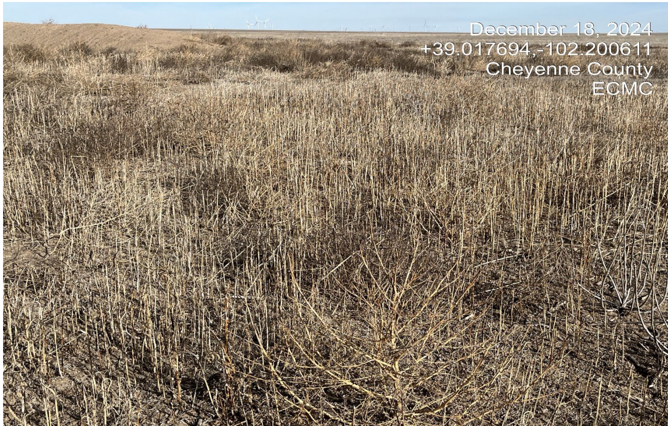
Photo 9. View of undesirable weeds growing throughout the disturbance area. The weed debris will need to be removed and weed control will need to be performed.