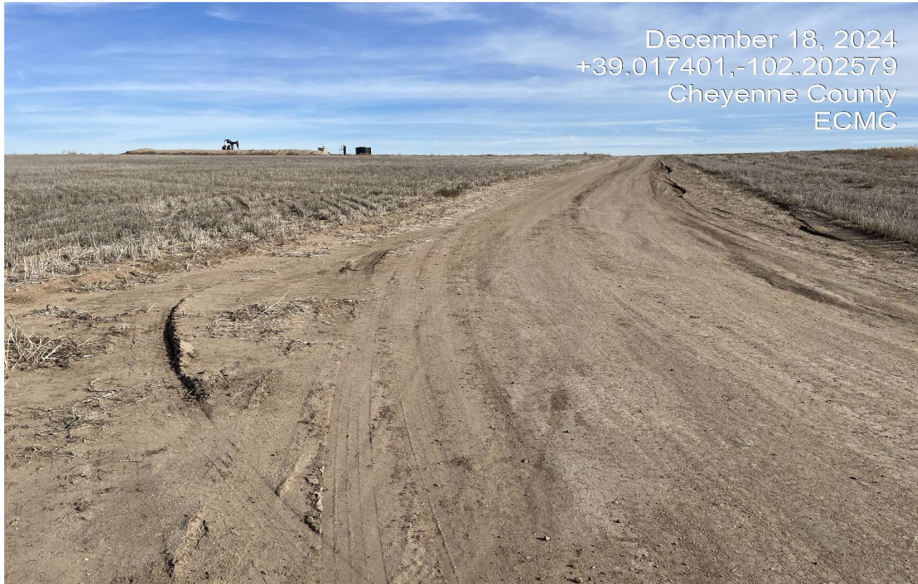
Photo 1. Facing east at the location. The access road needs to be reduced in size by reclaiming and decompacting soils..