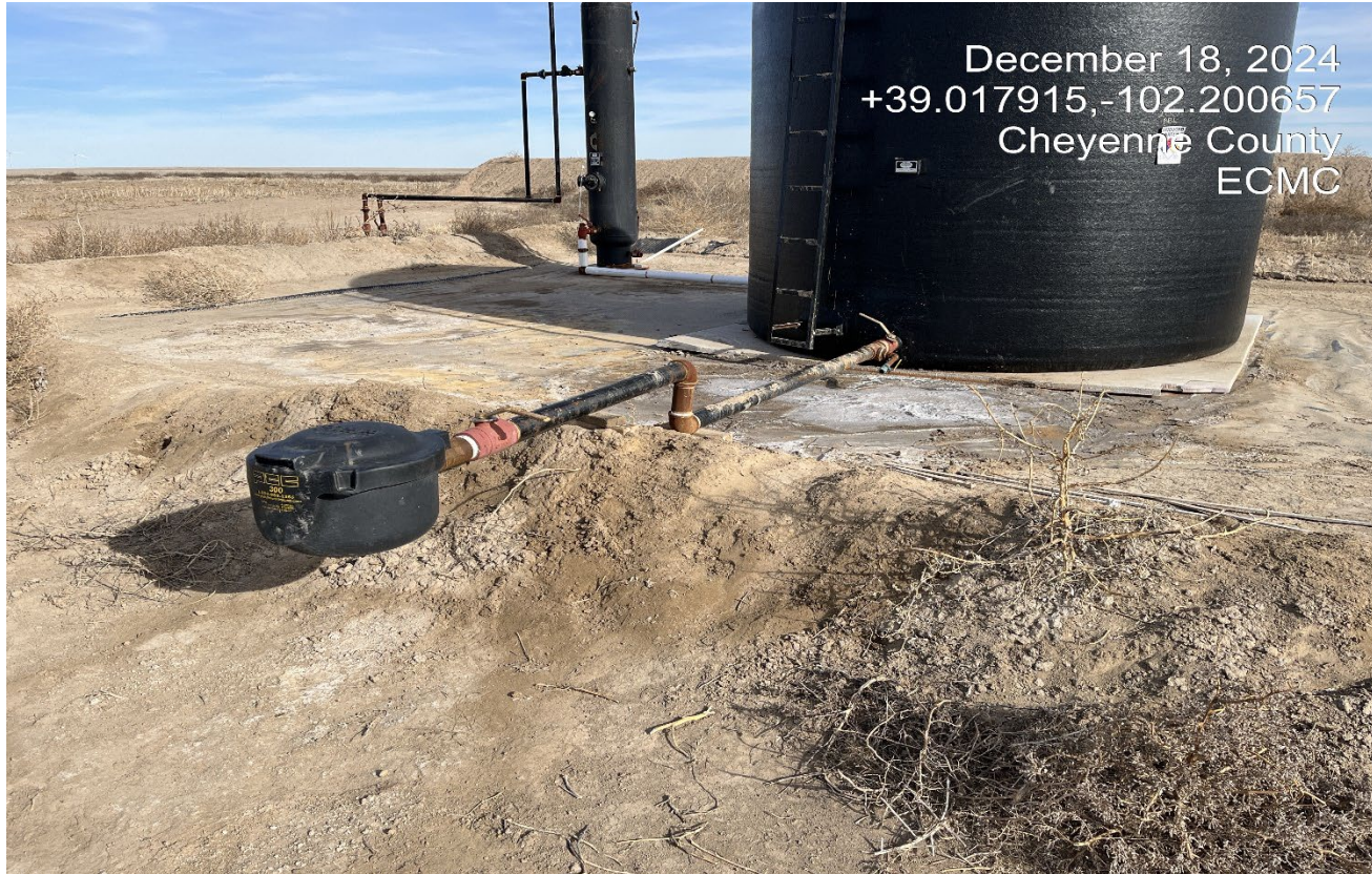
Photo 3. Facing toward the tank loadout area. The berm is worn down in this area. This berm is not designed to resist degradation from erosion.