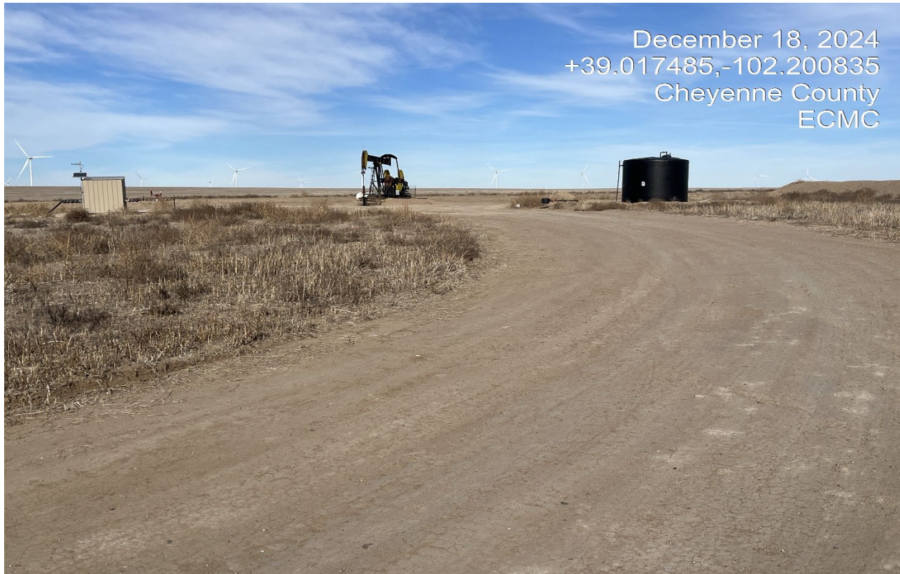
Photo 2. Facing north toward the wellsite..