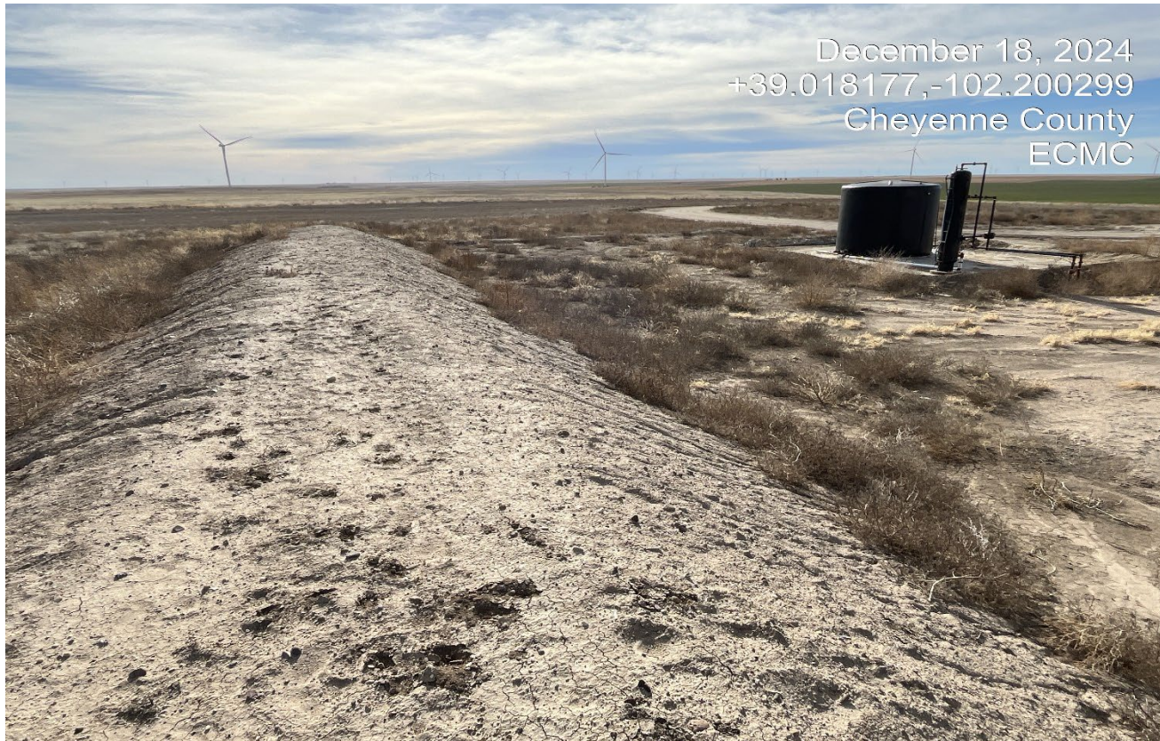
Photo 8. Facing south at the topsoil pile at the east side of the location. Topsoil is not being protected and needs to be replaced for interim reclamation.