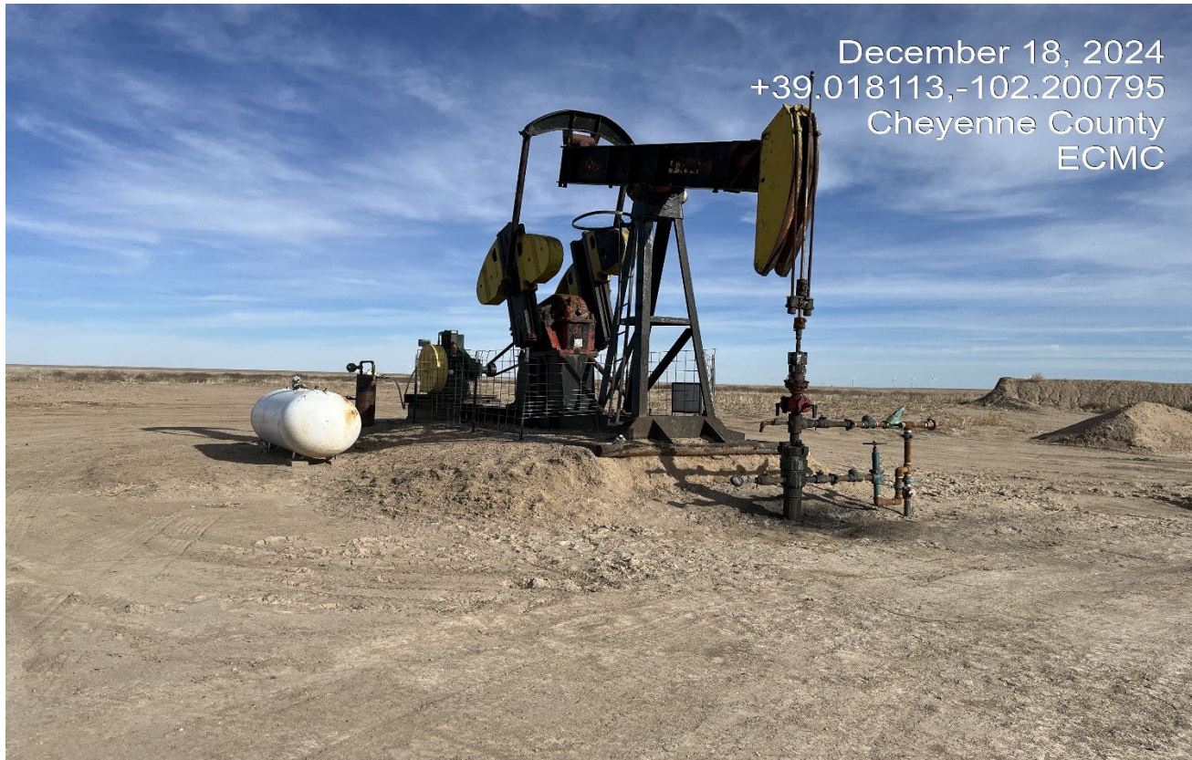
Photo 6. Facing toward the producing well. There is stained soils at the wellhead that must be cleaned up..