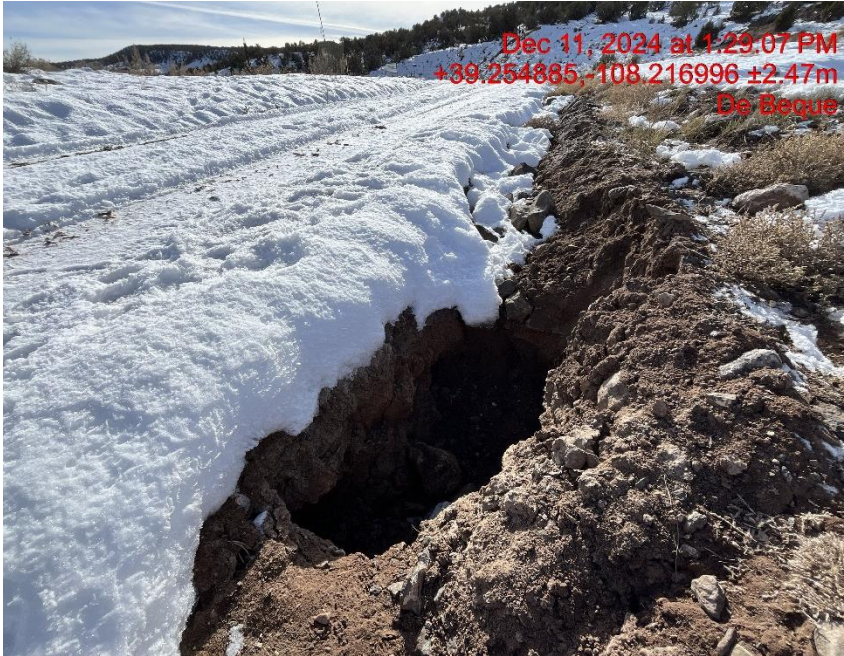
Photo # 0919 Tunnel erosion NW side of lease road near location in ditch/ditch needs maintenance, also is a wildlife/personnel safety hazard