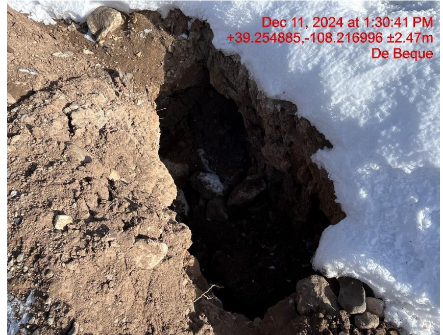
Photo # 0924 Tunnel erosion NW side of lease road near location in ditch/ditch needs maintenance, also is a wildlife/personnel safety hazard