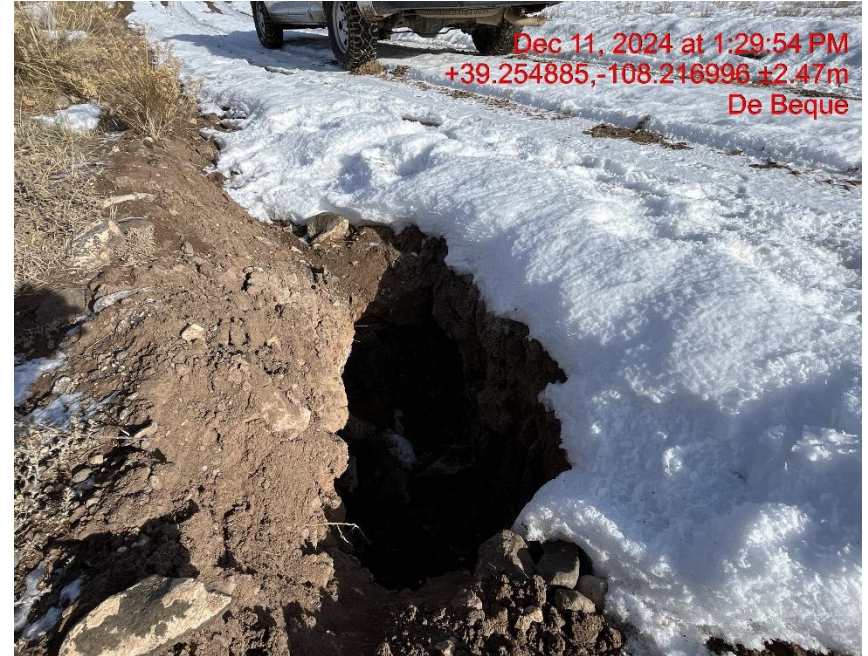
Photo # 0922 Tunnel erosion NW side of lease road near location in ditch/ditch needs maintenance, also is a wildlife/personnel safety hazard