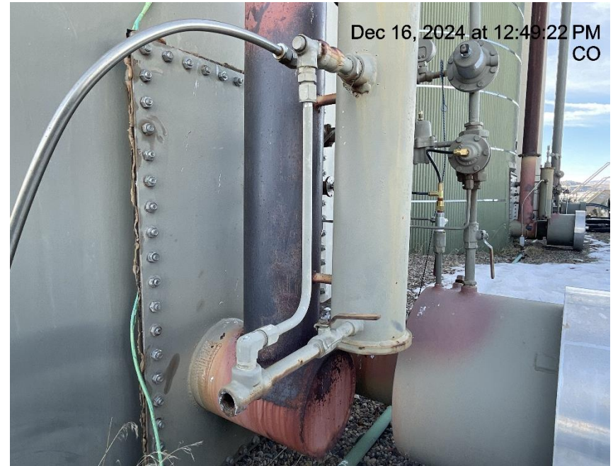
Photo # 3756 PRV vent line on tank burner does not comply with CECMC pressure safety device rules