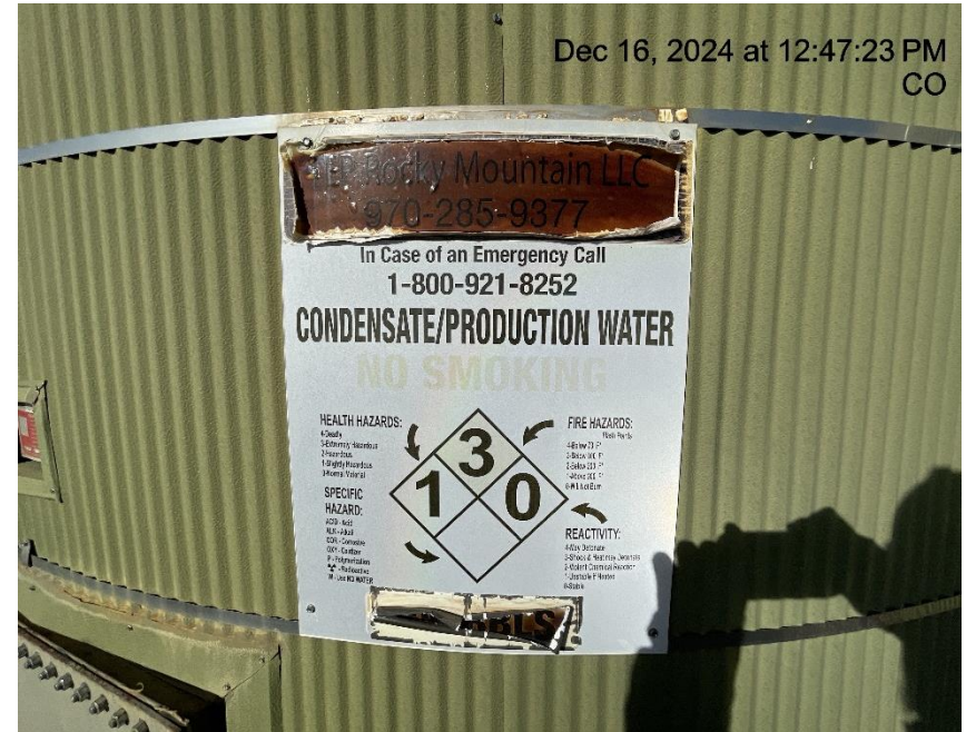
Photo # 3754 Tank label weathered & some required info is illegible