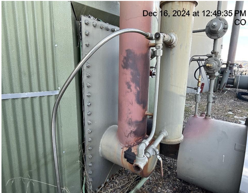
Photo # 3757 PRV vent line on tank burner does not comply with CECMC pressure safety device rules