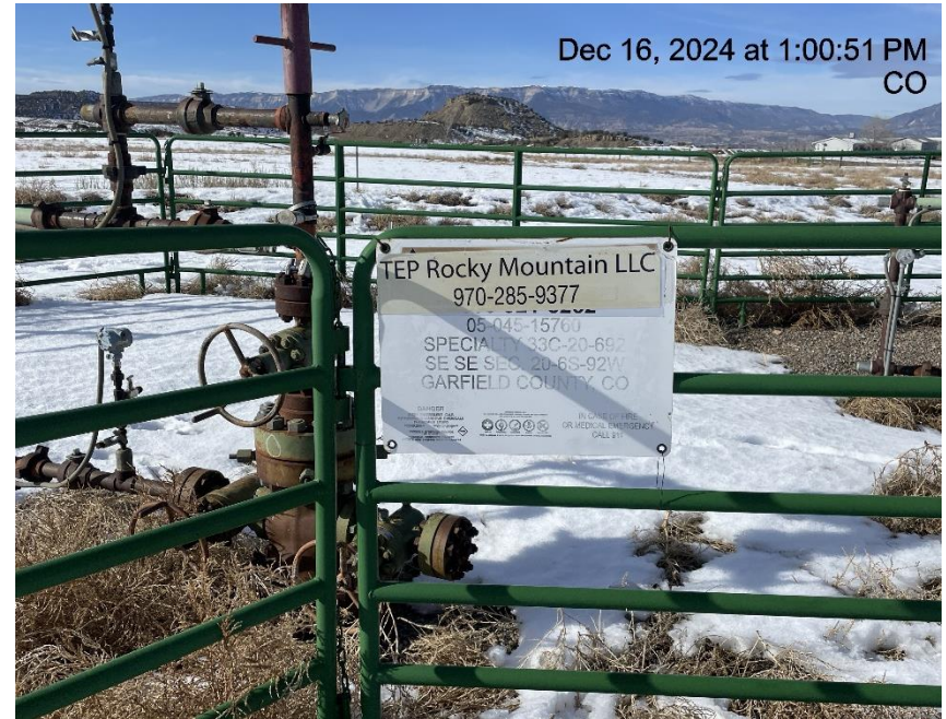
Photo # 3760 SPECIALTY 33C wellhead sign weathered & becoming illegible