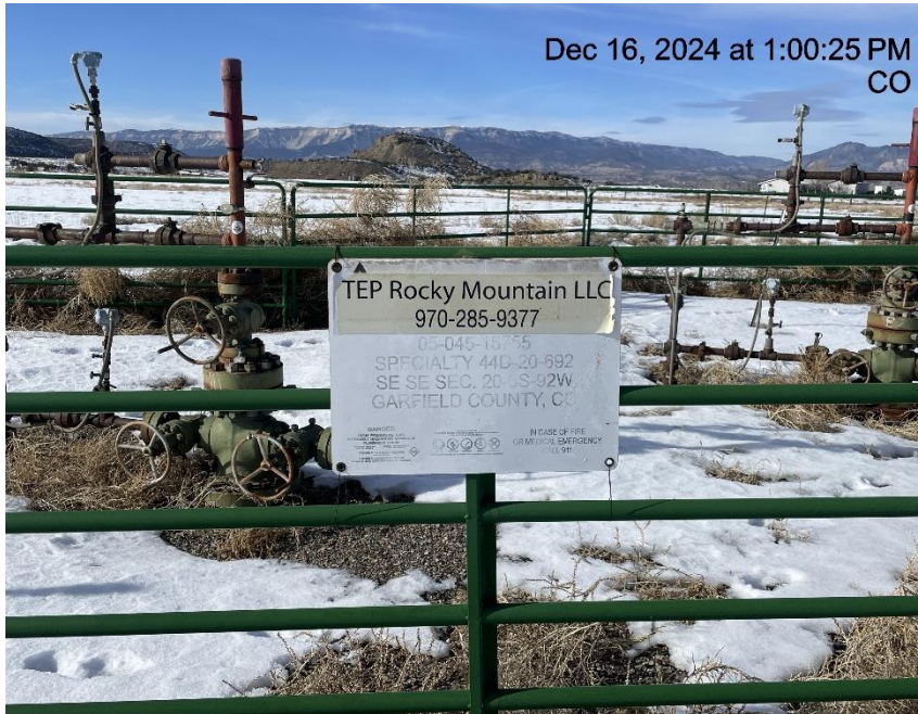
Photo # 3759 SPECIALTY 44D wellhead sign weathered & becoming illegible