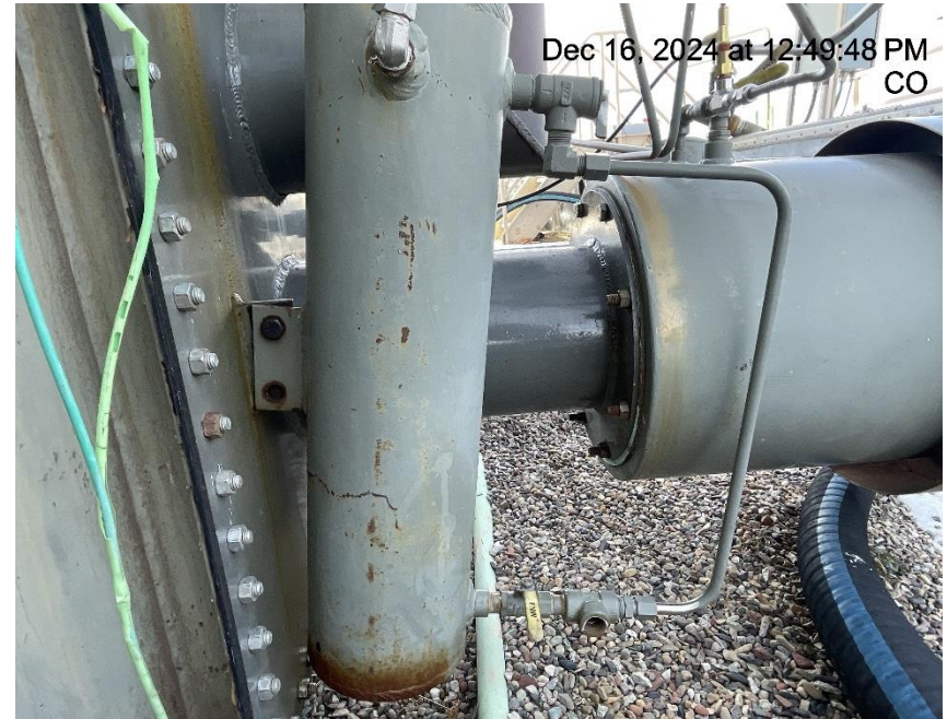
Photo # 3758 PRV vent line on tank burner does not comply with CECMC pressure safety device rules