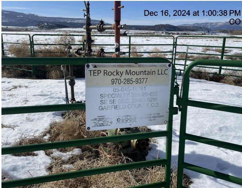
Photo # 3761 SPECIALTY 33A wellhead sign weathered & becoming illegible