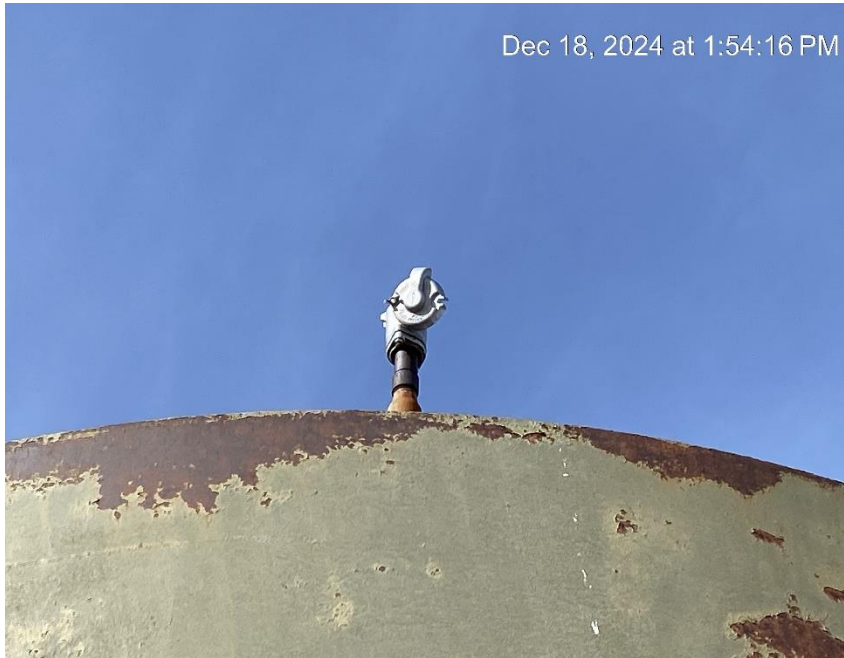
Valve needs repaired