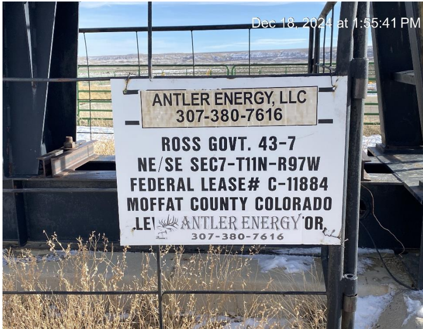
Missing required information