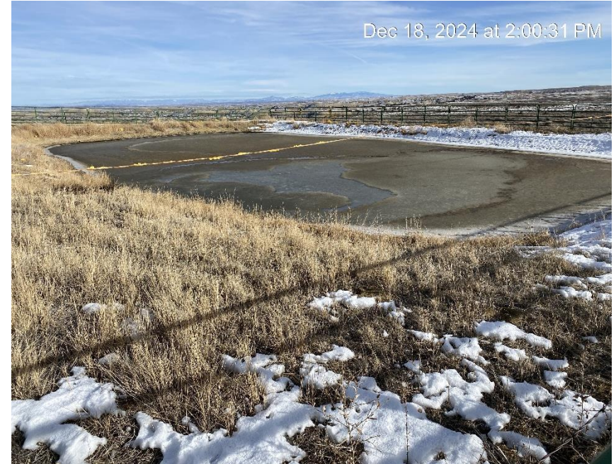
Open pit from Southwest corner