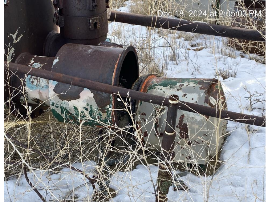
Open to wildlife