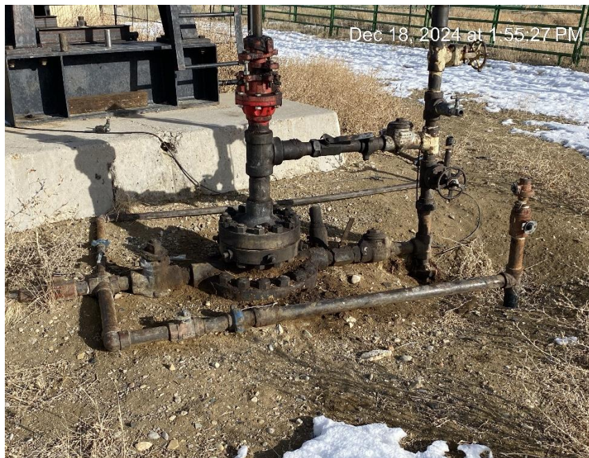
Oily waste and staining