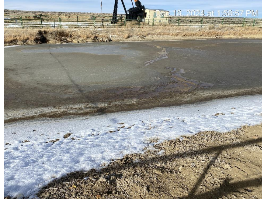
Hydrocarbon evidence on pit surface