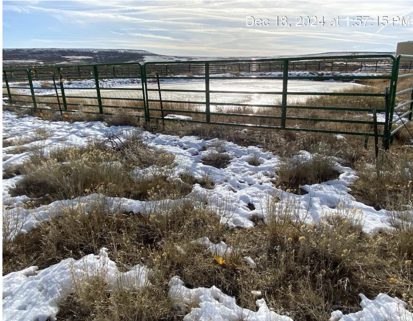
Open pit from Northwest corner