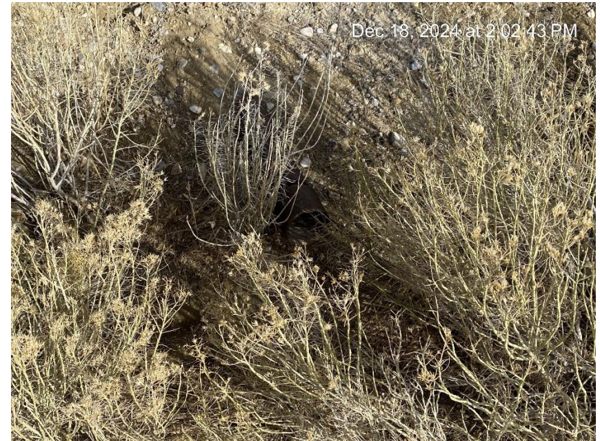
Open end load line