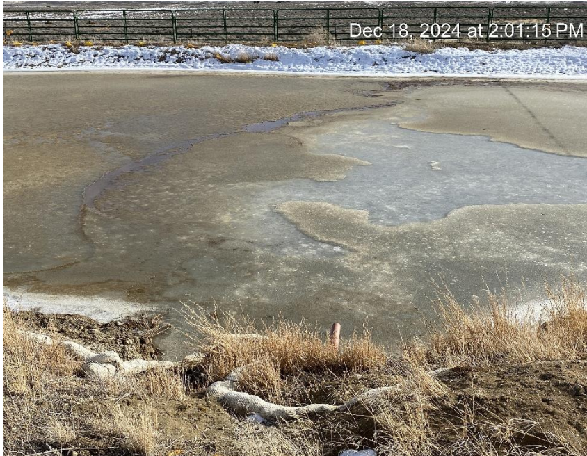
Hydrocarbon evidence on pit surface