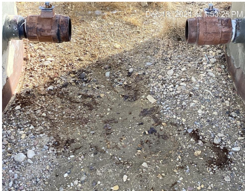
Open end tank valves. Oily waste and staining