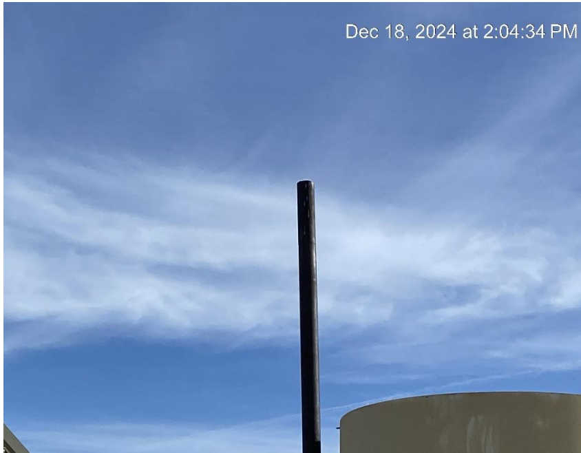
Missing bird protection