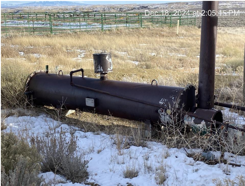
Debris. Unused equipment.