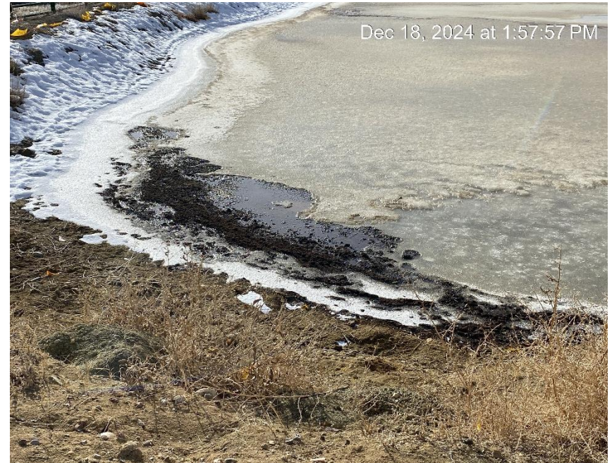
Hydrocarbon evidence on pit surface