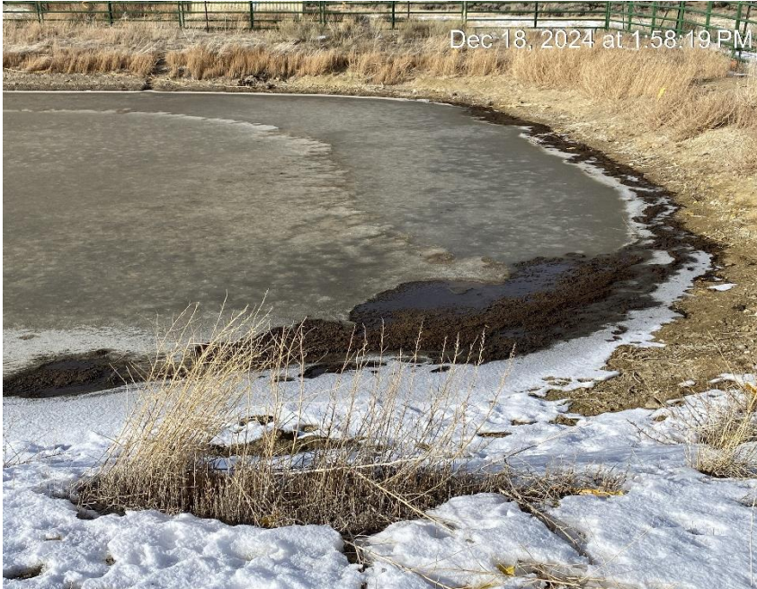
Hydrocarbon evidence on pit surface