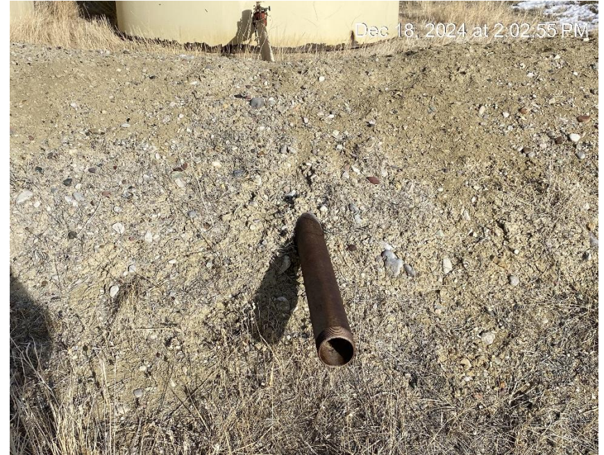
Open end load line