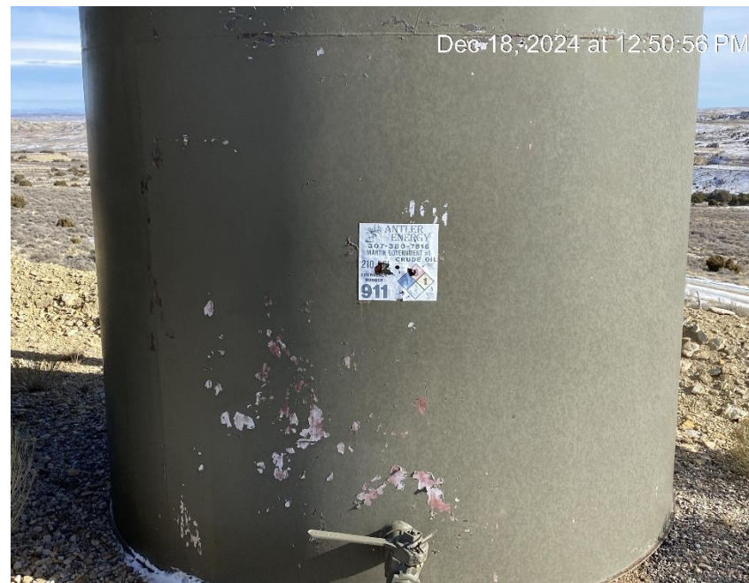
Replace labels when damaged