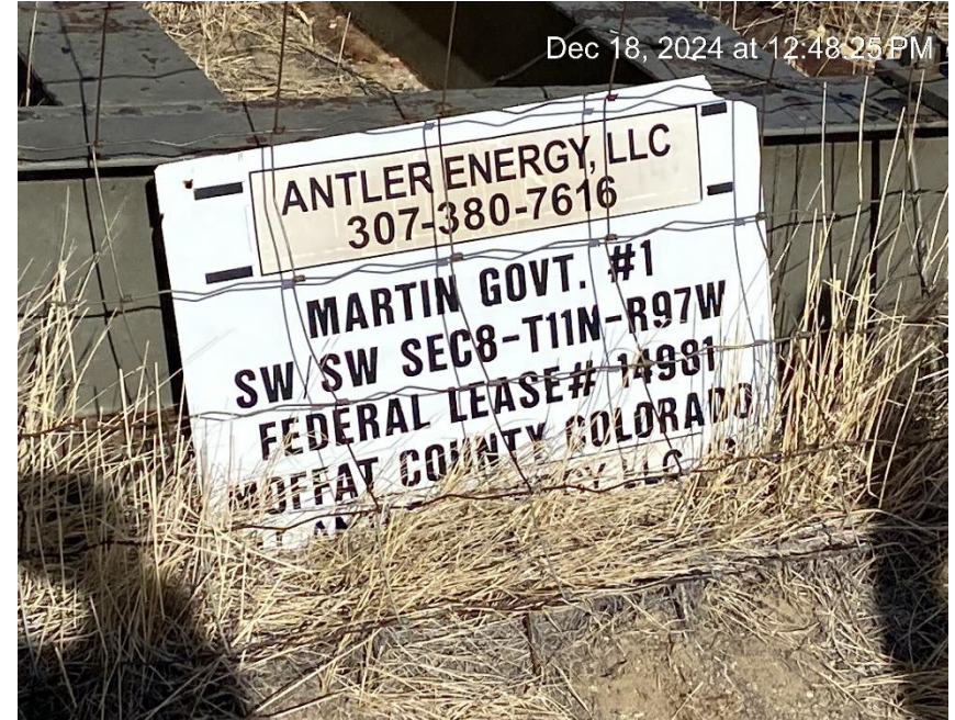
Missing required information