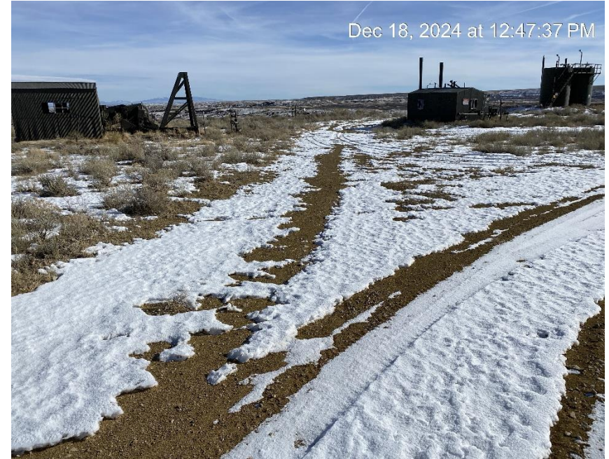
Location from Northwest corner