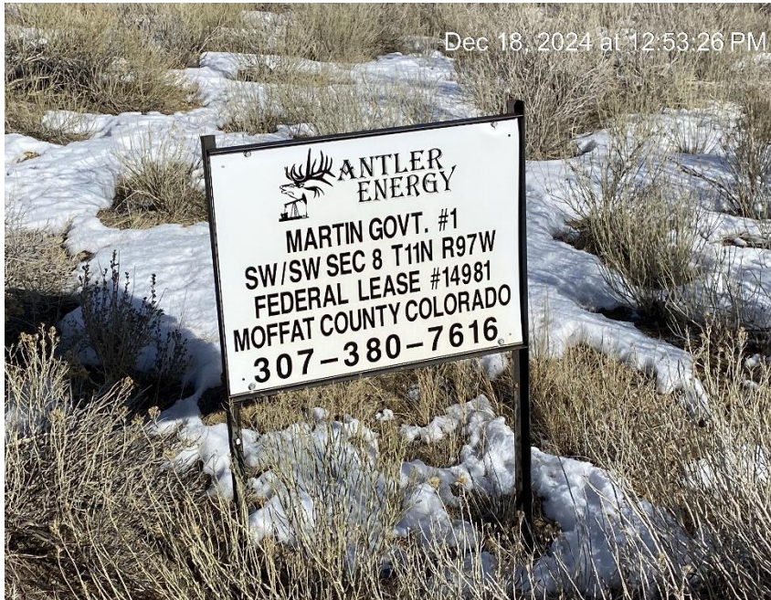
When replaced additional information is required