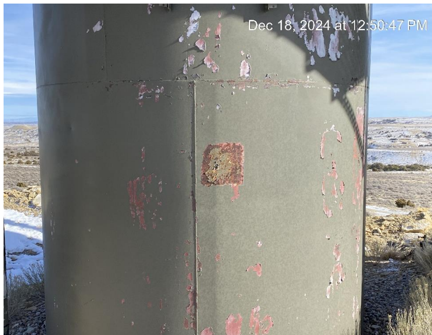
Missing label on production tank