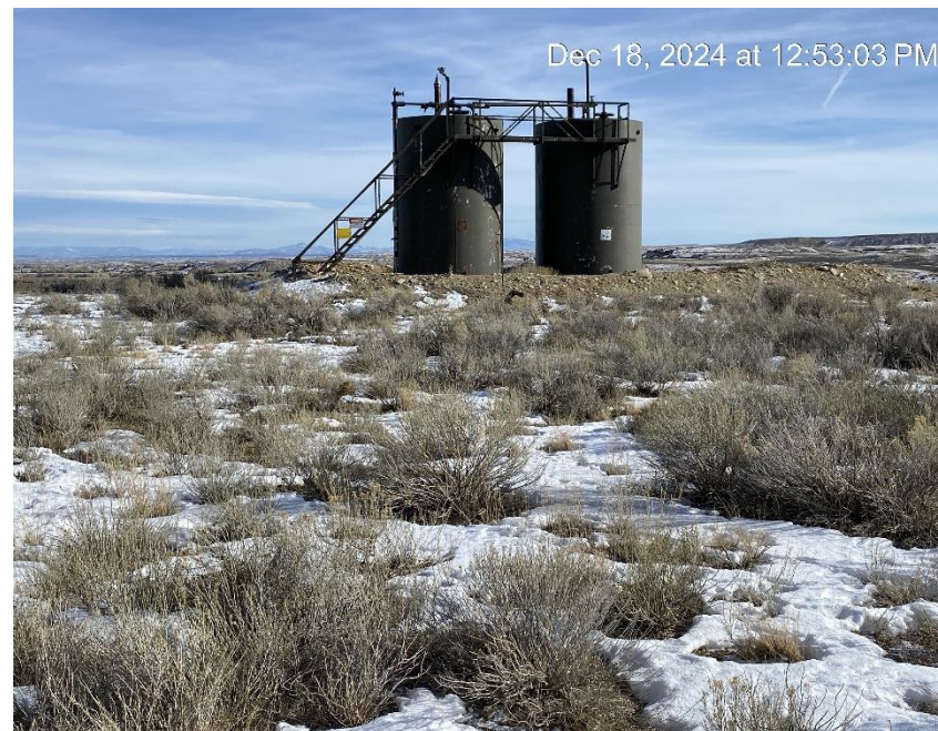
Tank battery from Southwest corner of location