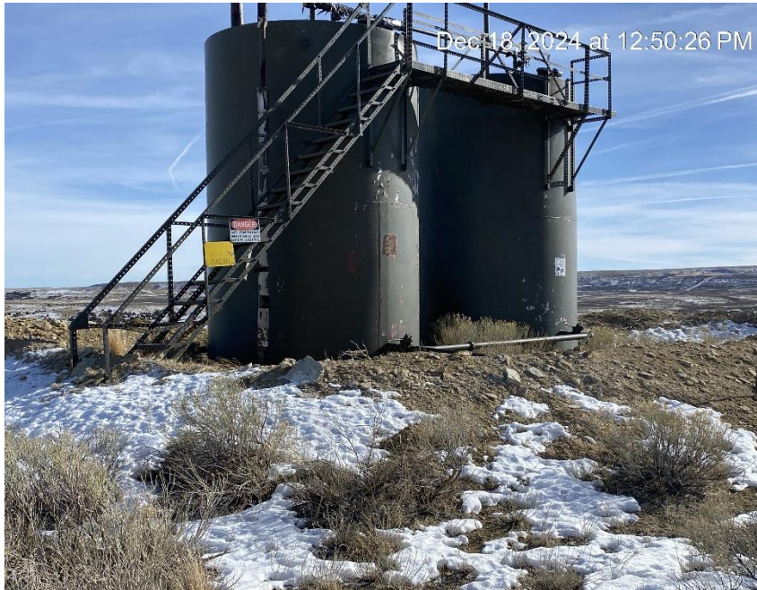
No sign at tank battery