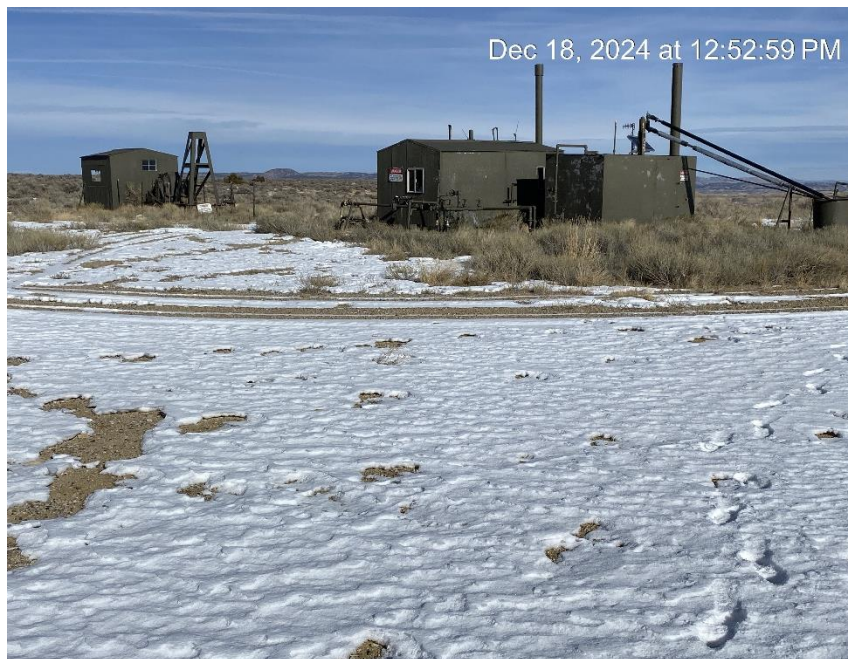
Well and production equipment from Southwest corner of location