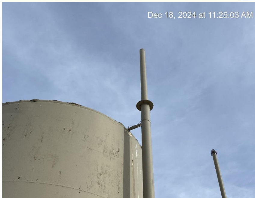
Missing bird protection