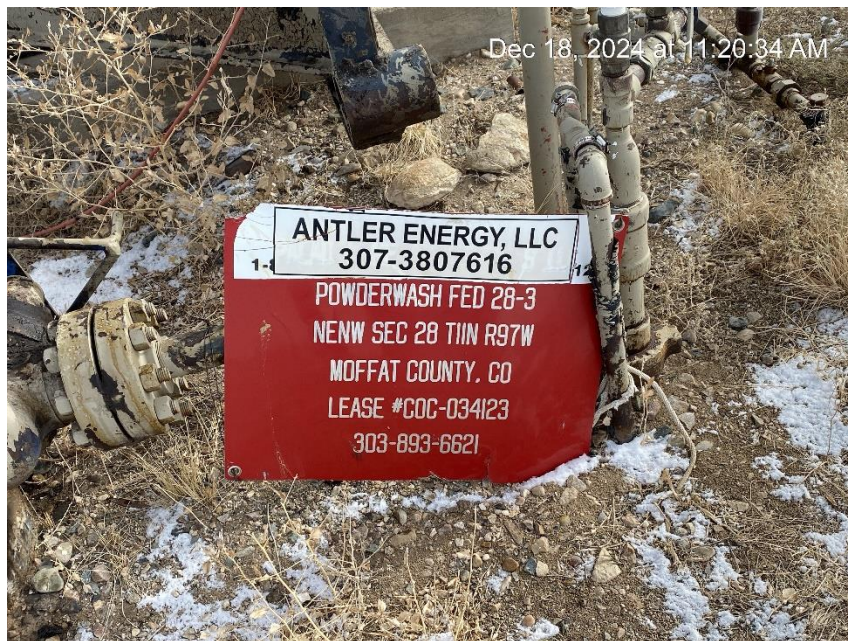
Sign missing required information