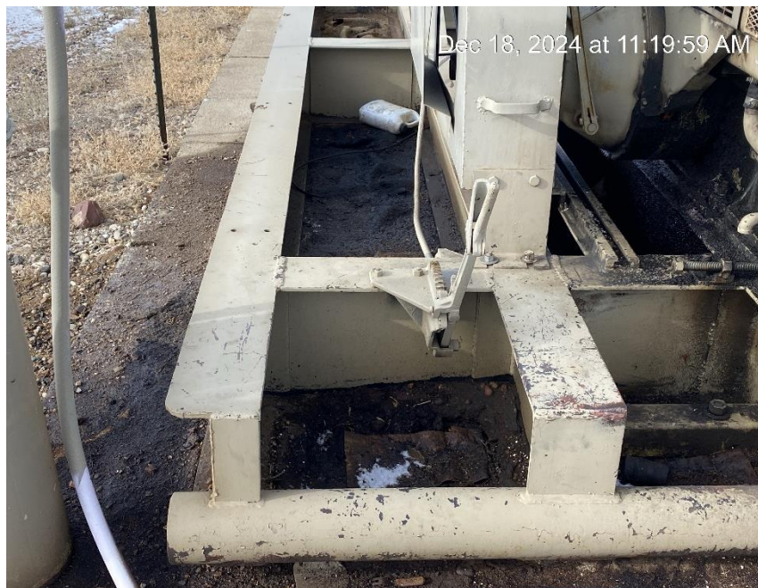
Oily waste and staining