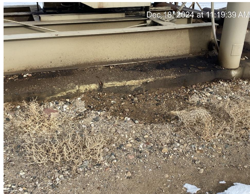
Oily waste and staining