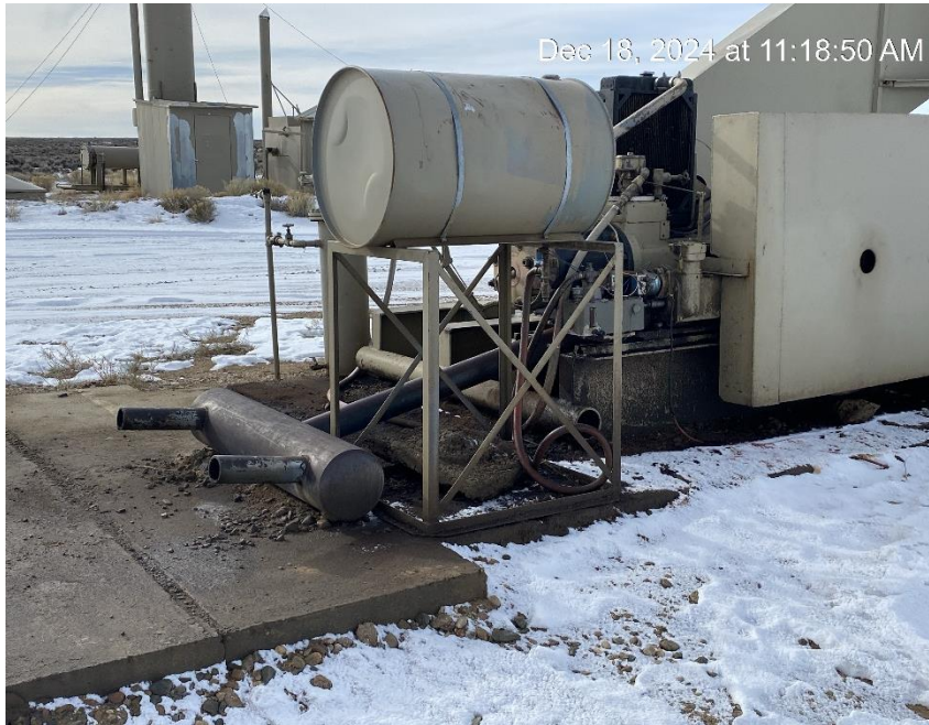
No spill containment