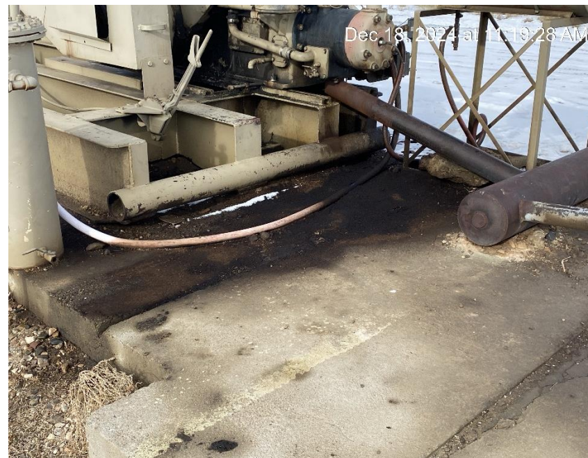
Oily waste and staining