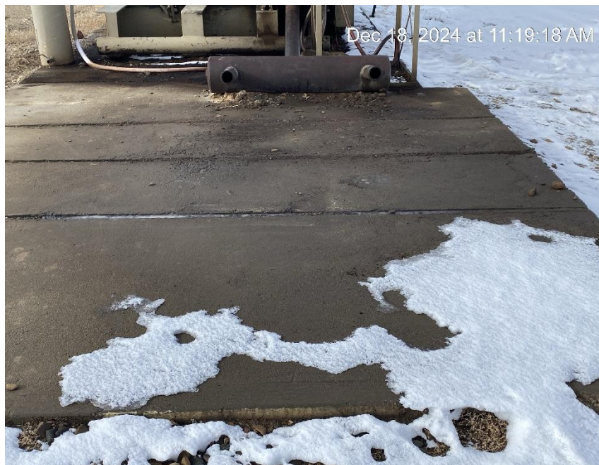
Oily waste and staining