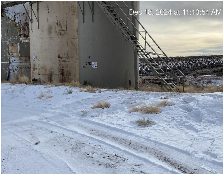
No sign at tank battery