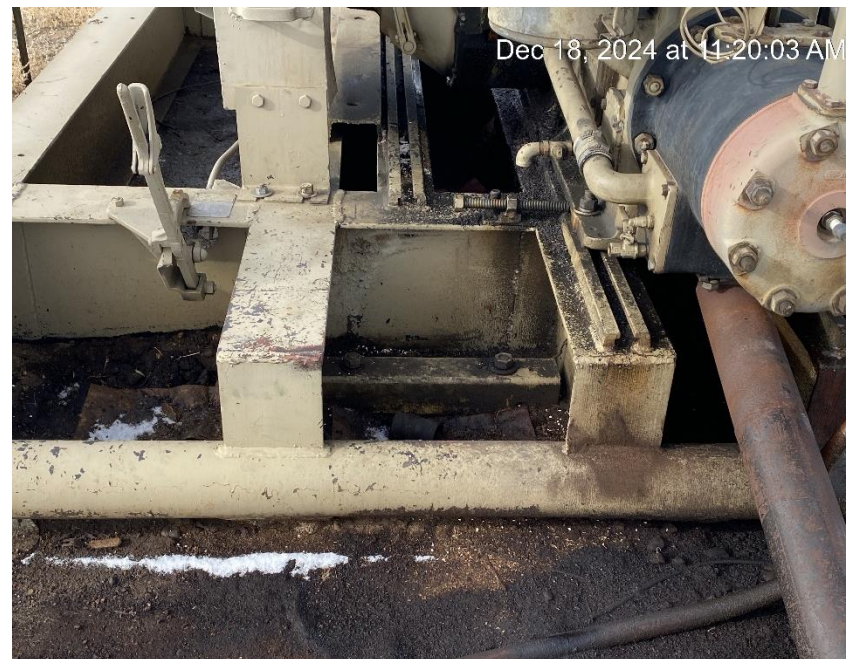
Oily waste and staining