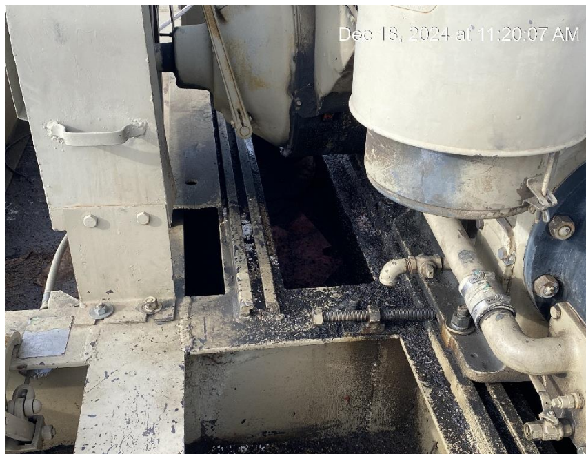
Oily waste and staining