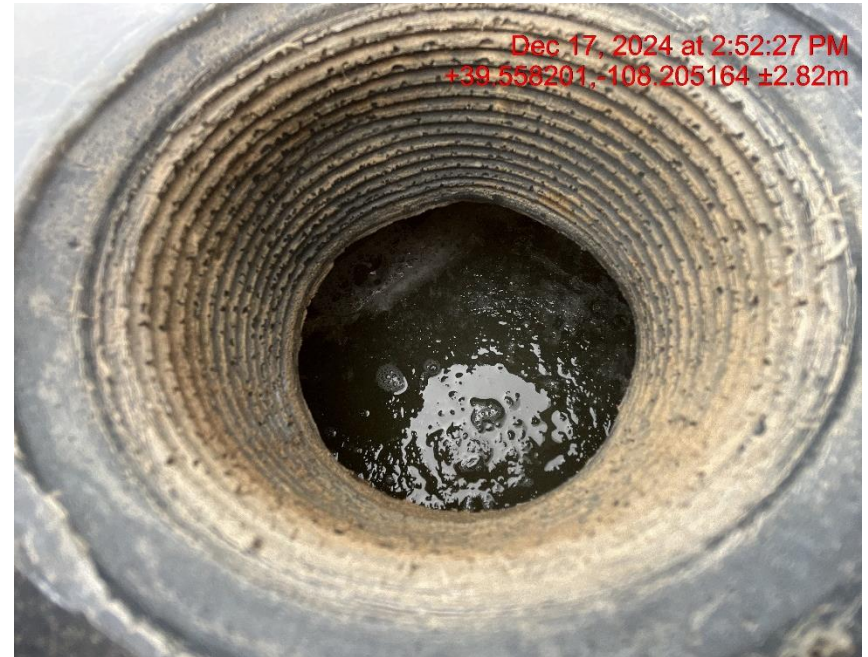
Photo # 1390 Failure to maintain multiple chemical BMP/chemical containments approximately 3/4th full of fluid/not sufficient to contain possible spill