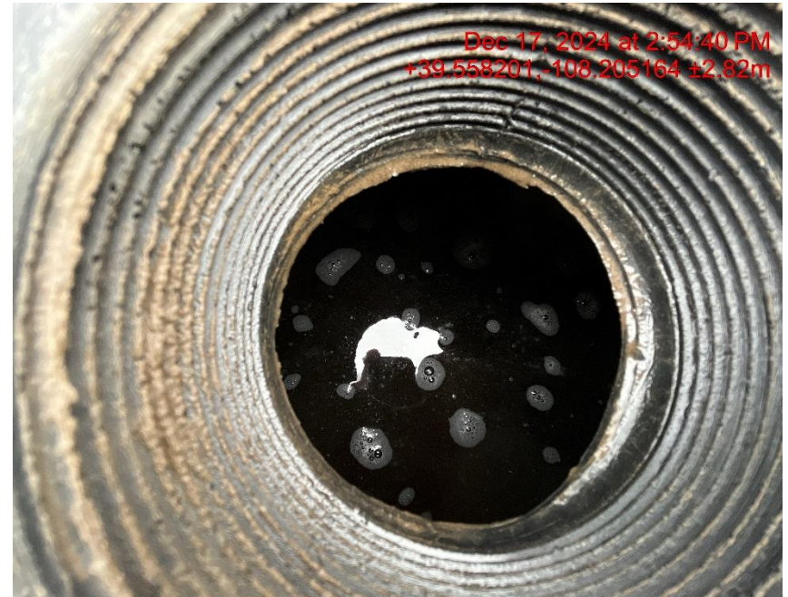
Photo # 1393 Failure to maintain multiple chemical BMP/chemical containments approximately 3/4th full of fluid/not sufficient to contain possible spill