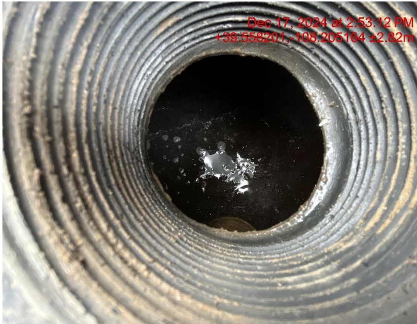
Photo # 1391 Failure to maintain multiple chemical BMP/chemical containments approximately 3/4th full of fluid/not sufficient to contain possible spill