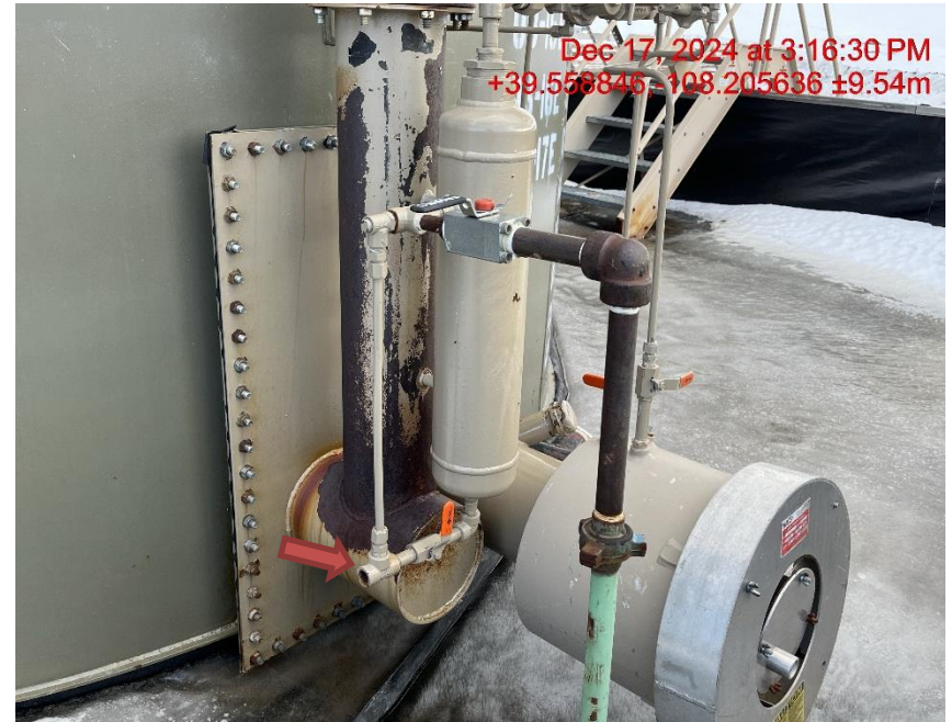
Photo # 1423 Tank heater PRV vent line does not comply with CECMC pressure safety device rules