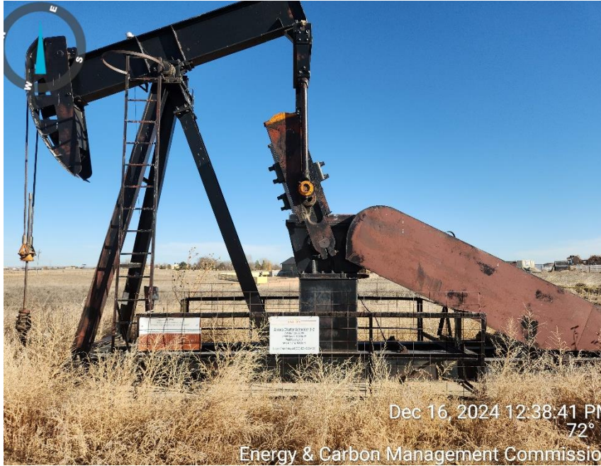
Photo 1 well head and equipment