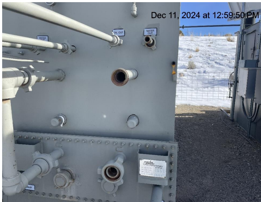
Photo # 3079 Multiple open ended piping on separator unit/wildlife hazards/available for entry by wildlife