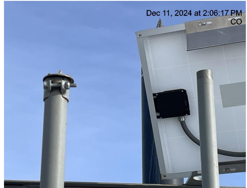
Photo # 3240 PRV vent line does not comply with CECMC pressure safety device rules