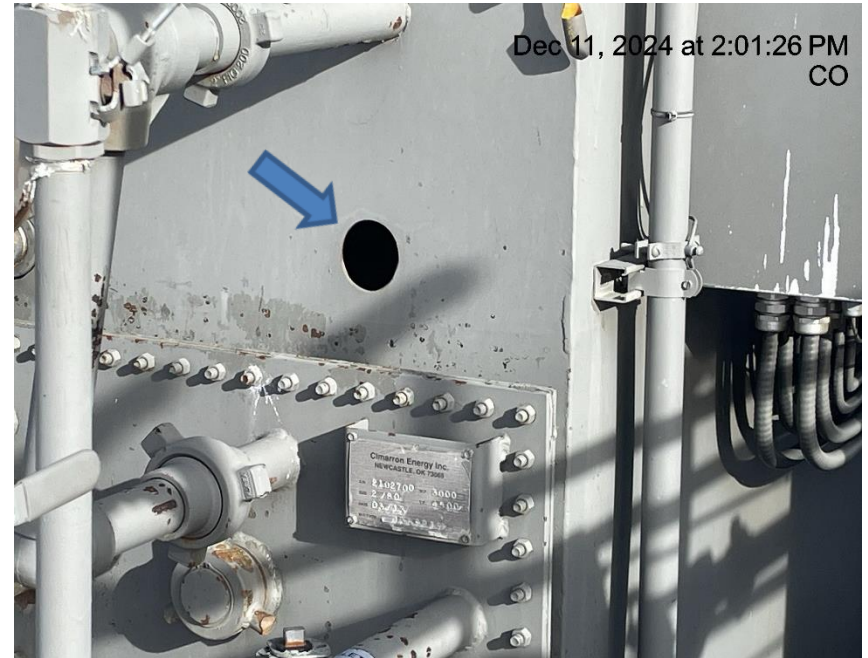
Photo # 3238 Hole in separator unit/wildlife hazard /available for entry by wildlife