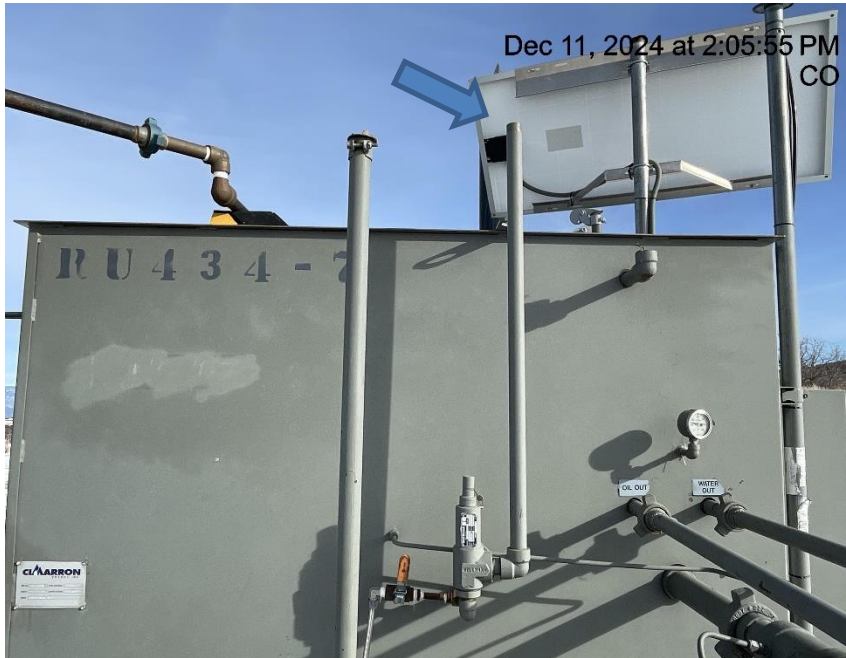
Photo # 3239 PRV vent line does not comply with CECMC pressure safety device rules