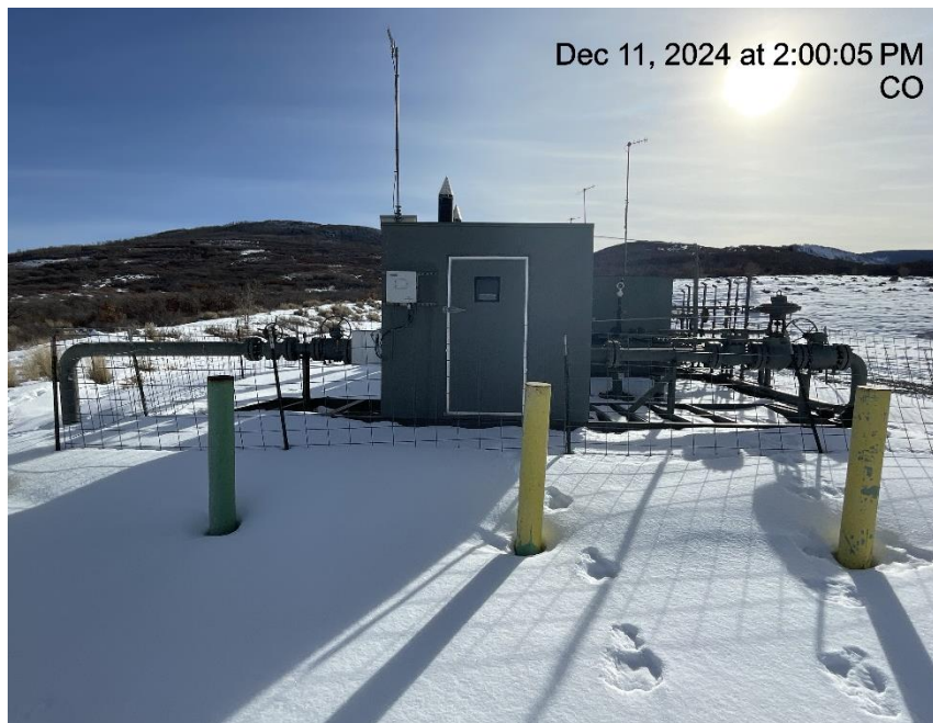
Photo # 3241 Summit Midstream meter house not listed in FORM 2A/not in compliance with CECMC rules