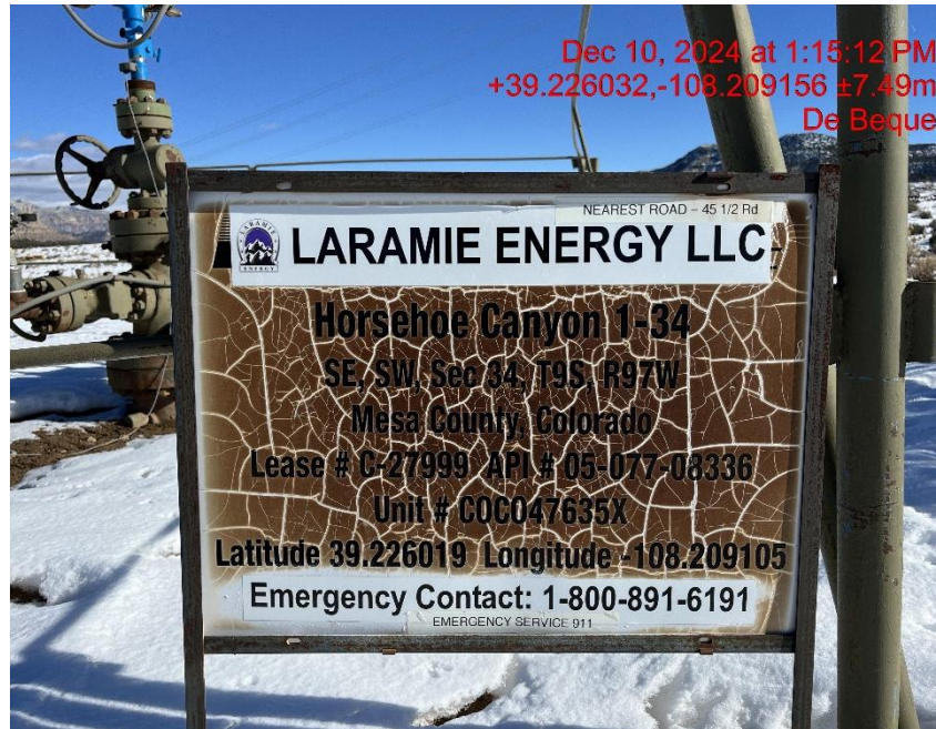
Photo # 0576 Wellhead sign is weathered & cracked and becoming illegible