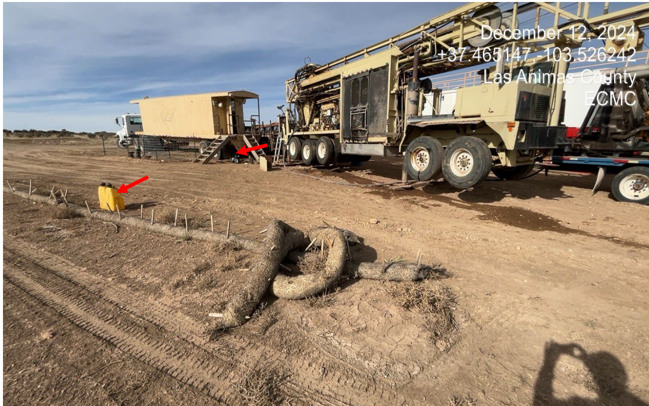
Photo 5. There is fuel and lube oil containers not in containment shown at red arrows. The wattles are displaced in this area.