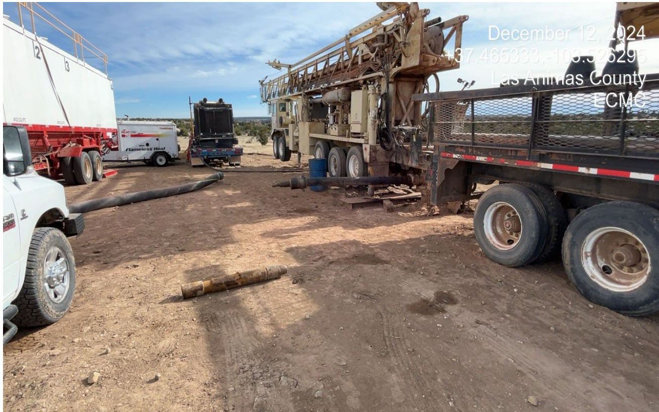
Photo 2. Facing toward the well where recent work with the rig was being conducted. There was a audible leak coming from the well and the operator onsite was notified.