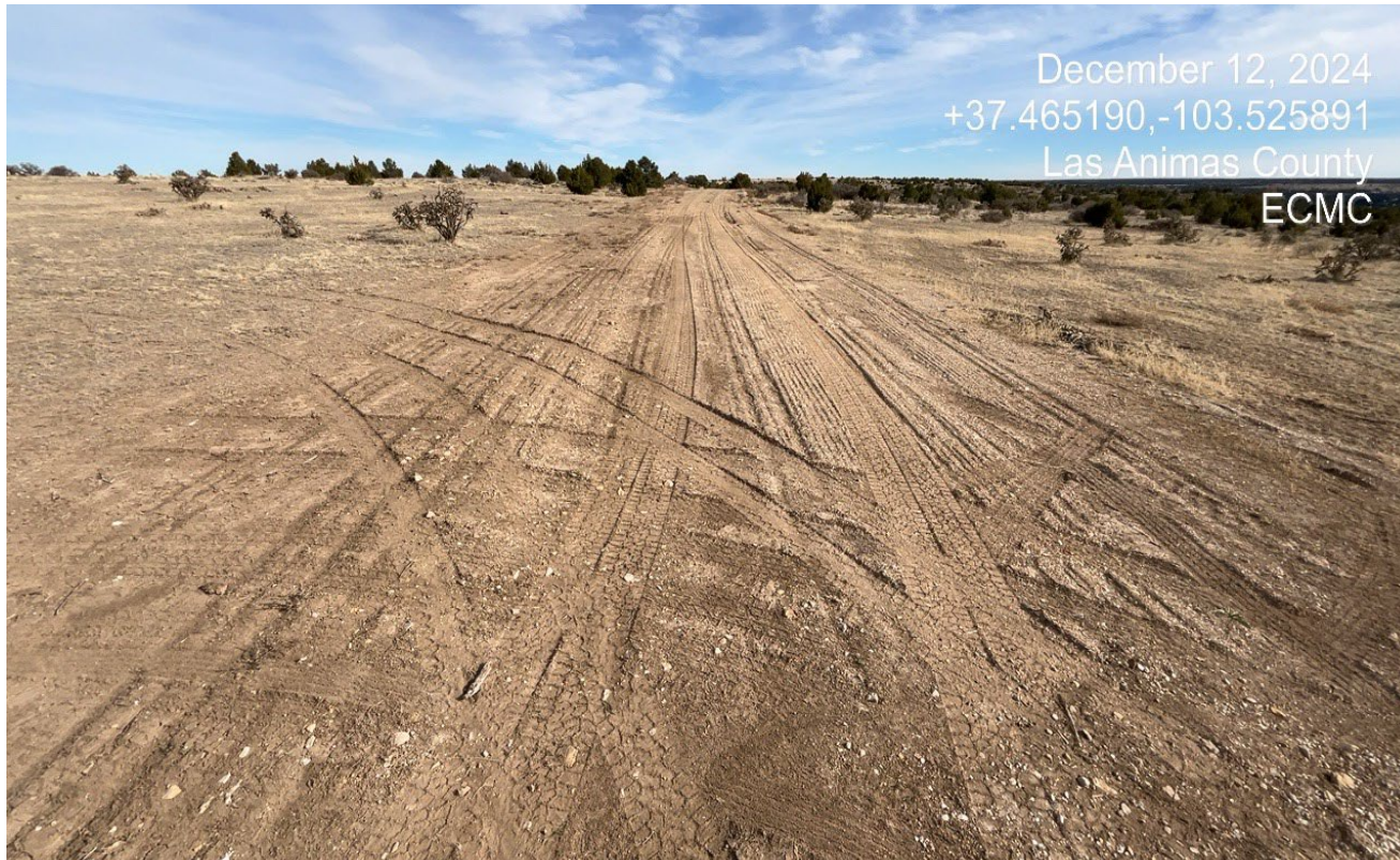
Photo 6. Facing east toward the flowline disturbance. The vegetation is not establishing along the flowline and there are vehicle tracks which are causing unnecessary disturbance. The flowline must be reclaimed and stabilized.