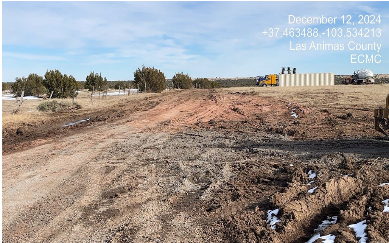
Photo 9. Standing on County Road 179 facing east toward DEO property. There is red drill cutting sand that has been spread on the road at Lat/Long:37.40116,-103.51736. E&P waste from the wellsite was not properly disposed.