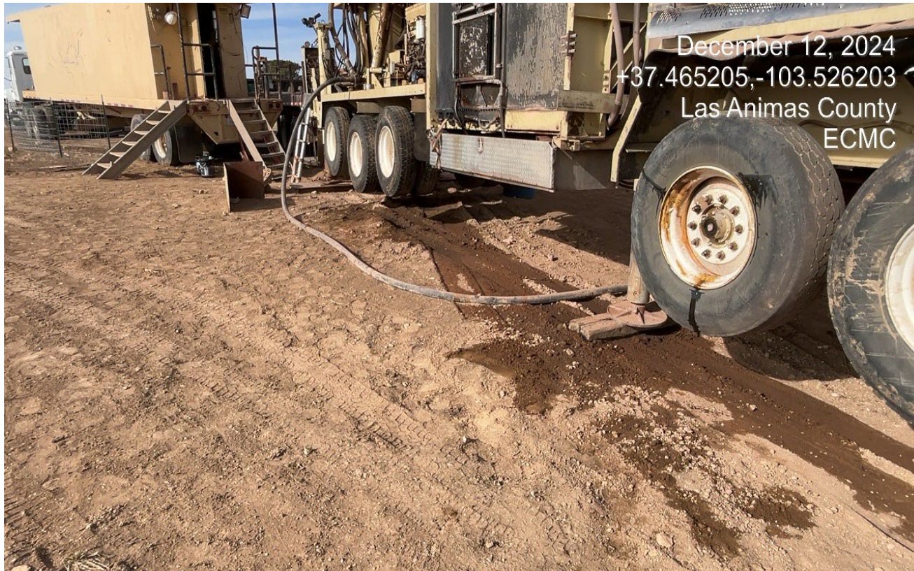
Photo 4. There is oil stained soils at the drill rig which has no liner or containment. Stained soils will need to immediate clean up.