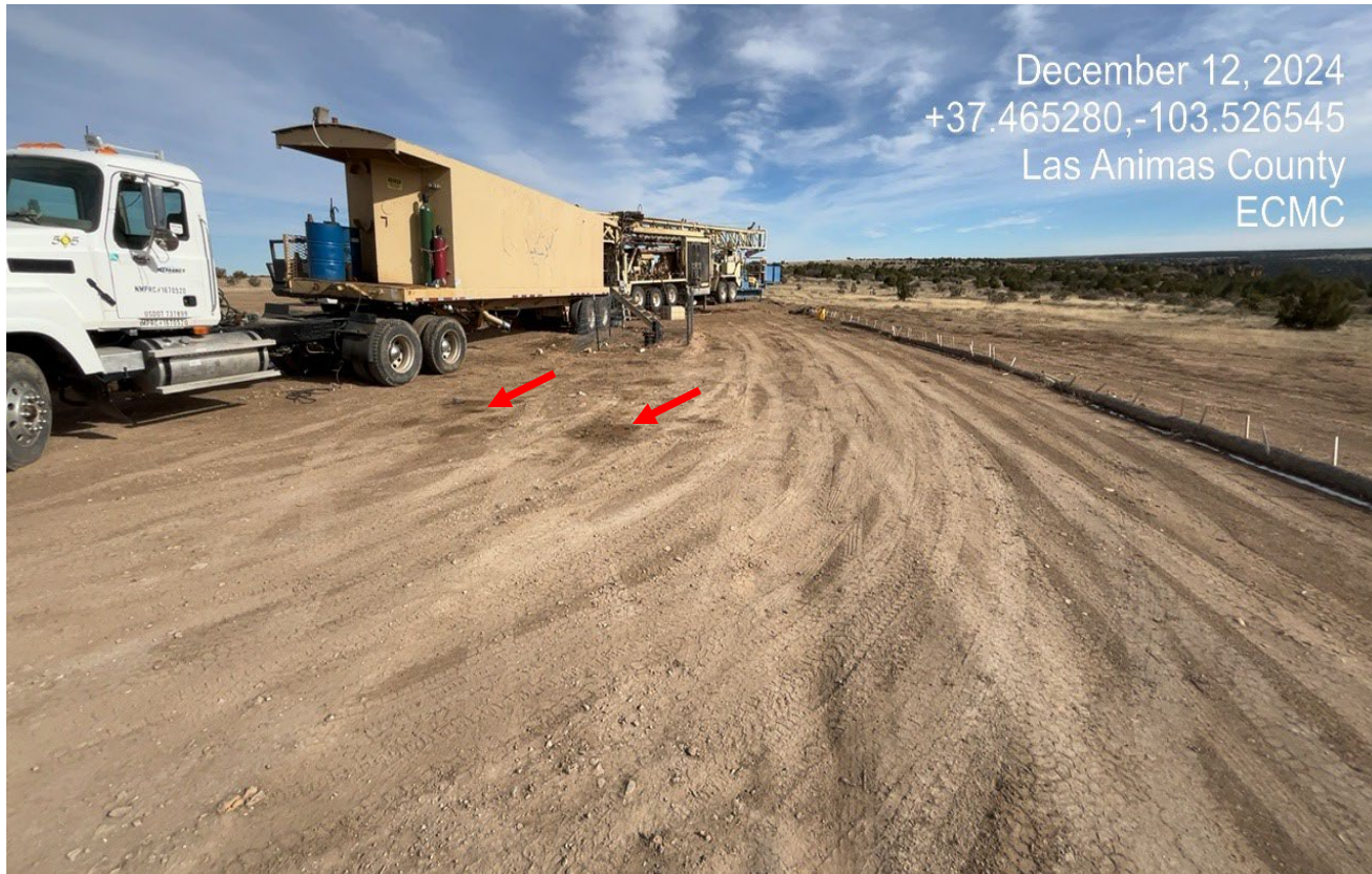
Photo 3. Facing east at the location. There are several areas of oil stained soils that must be cleaned up.