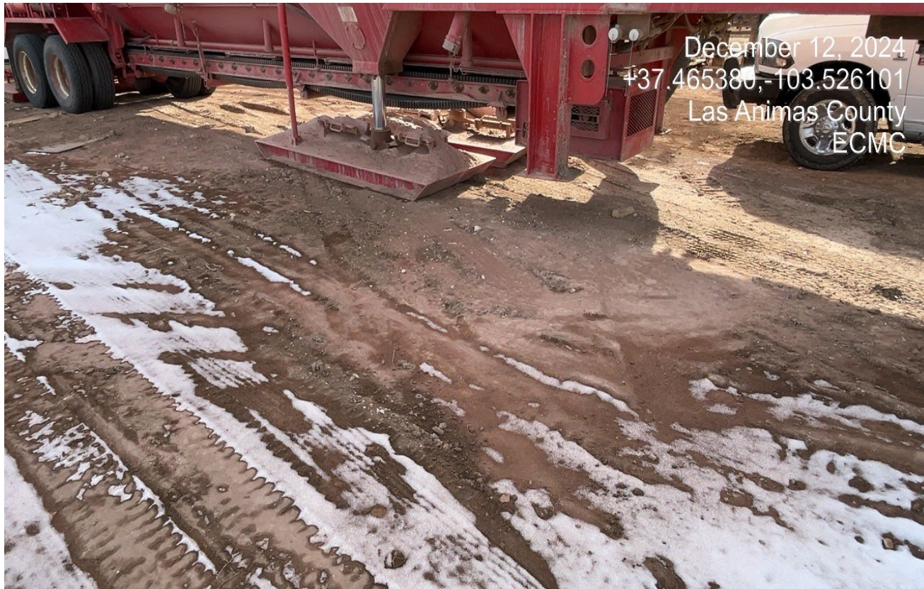
Photo 8. There is red drill cutting sand that has spread onto the soil around the equipment. No liner or other containment is present.