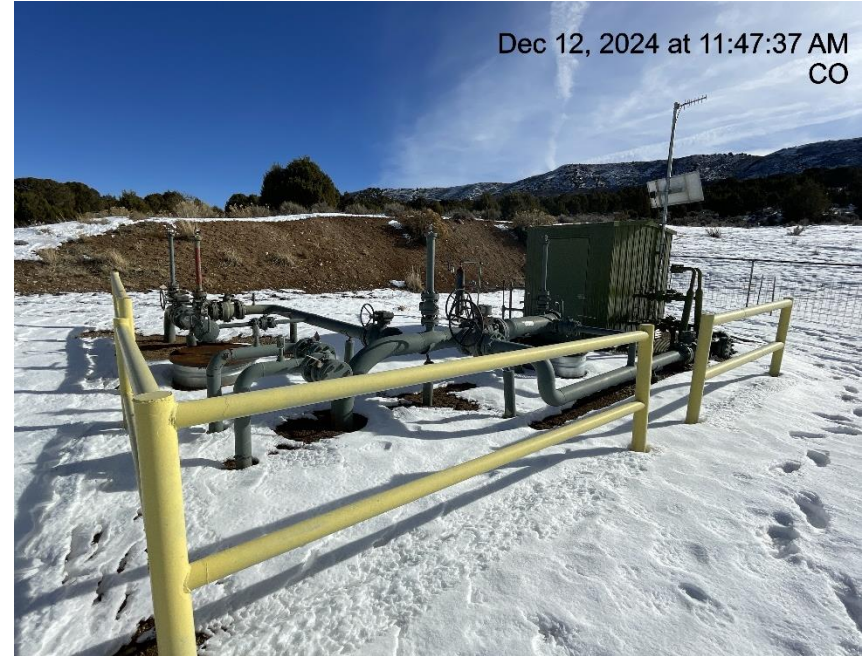
Photo # 3480 Pig station & Summit Midstream meter house not listed in FORM 2A/not in compliance with CECMC rules