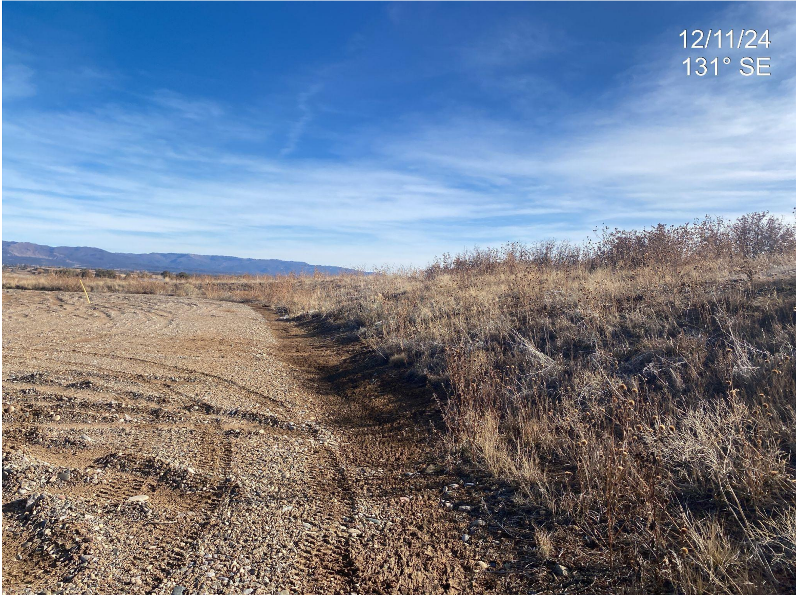
Photo 4. View of southern interim reclamation area composed of Western Wheatgrass, Smooth Brome and Prairie Sunflower.