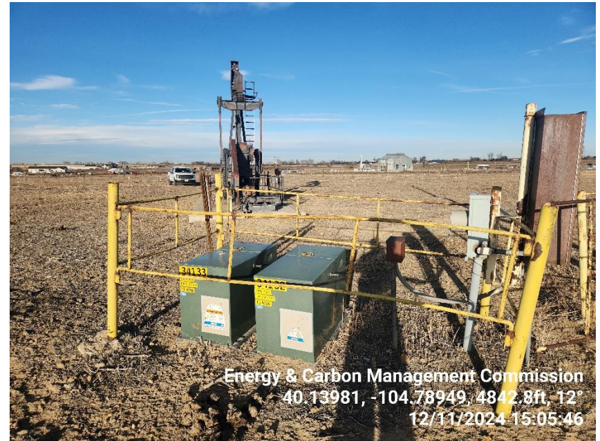
Photo 3 Wellhead sign is faded and needs to be replaced.

Energy & Carbon Management Commission 40.13981, -104.78949, 4842.8ft, 12° 12/11/2024 15:05:46