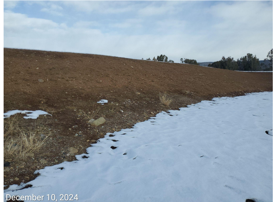
Photo 1: Limited inspection due to snow cover. Unable to find evidence that additional reclamation has been performed, and stabilization control measures installed.