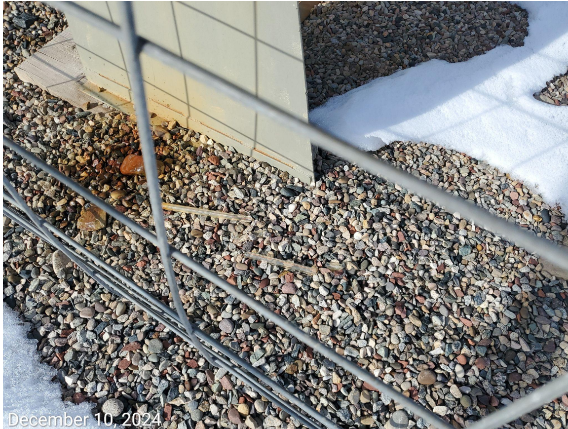
Photo 4: Knockout on the NW end of the Location. Photo shows impacted soils due to spill. Photo also shows broken pieces of glass.