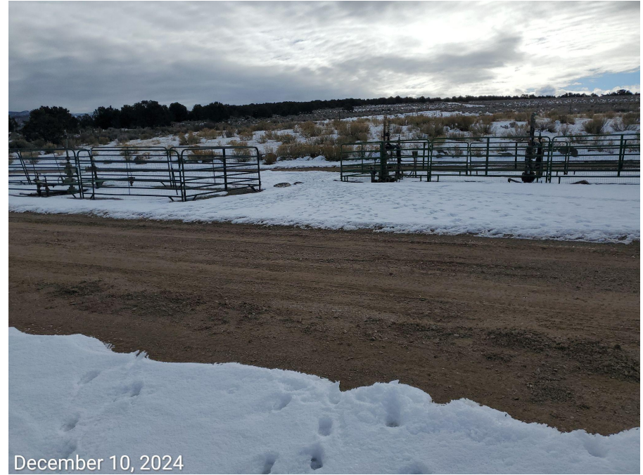
Photo 1: Photos 1-2 taken from the north end of the Location. Photos provide an overview of the Location from east, southeast, southwest to west.