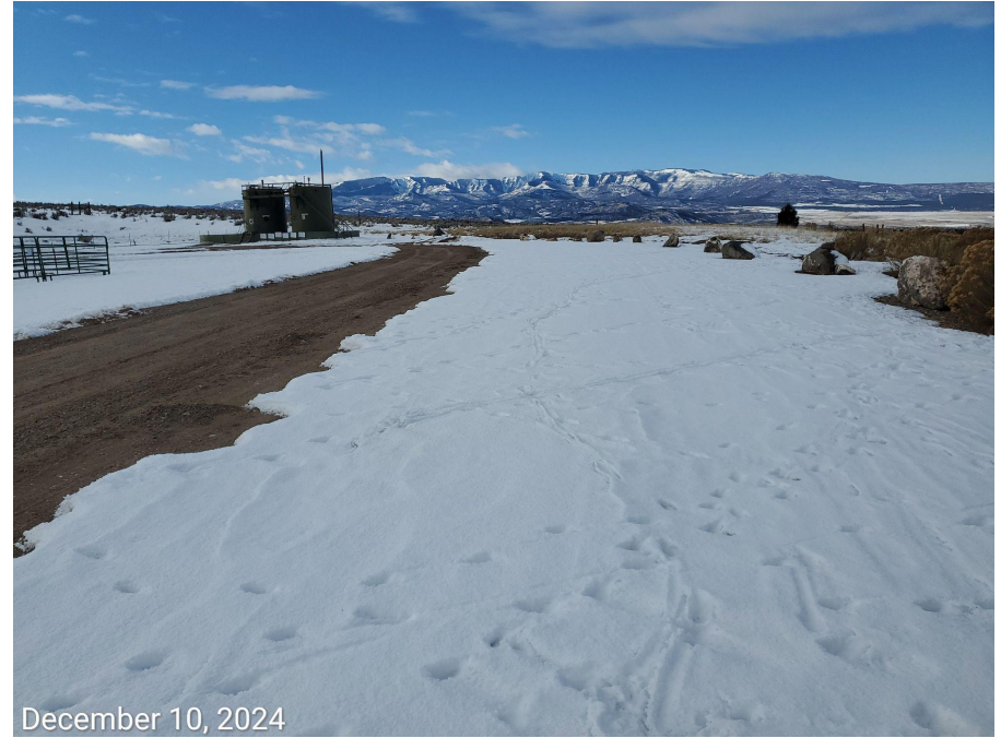
Photo 2: See comments under photo 1. Photos also show areas on the west end of the Location that or not necessary for production have not been reclaimed pursuant to 1003 requirements.