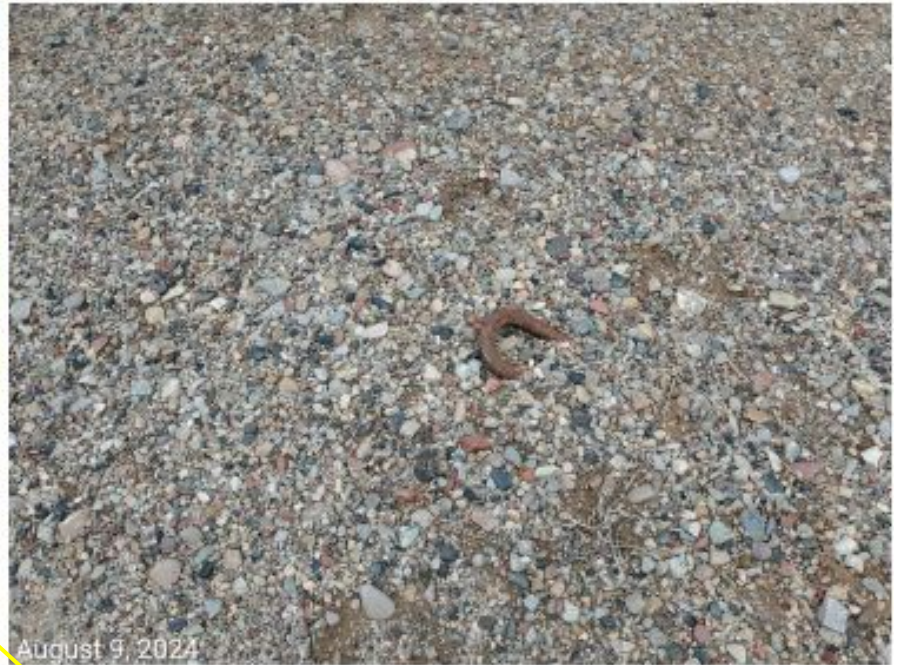
Photo 3: Photos top left/right from the 8/9/2024 inspection; photo right dated 12/10/2024. Photo shows marker remains missing. Photos examples showing missing markers identified on 8/9/2024 have not been installed.