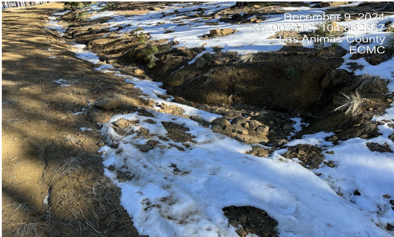
Photo 2. The erosion along the road side has insufficient BMP's to prevent continued erosion.