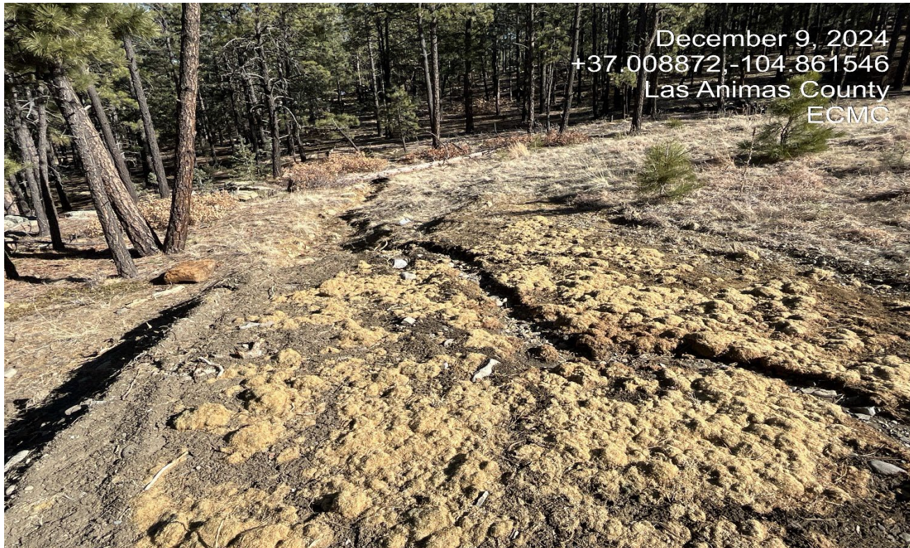
Photo 6. There is erosion already occurring where soils were pushed out to fill in the previously observed erosion channel.