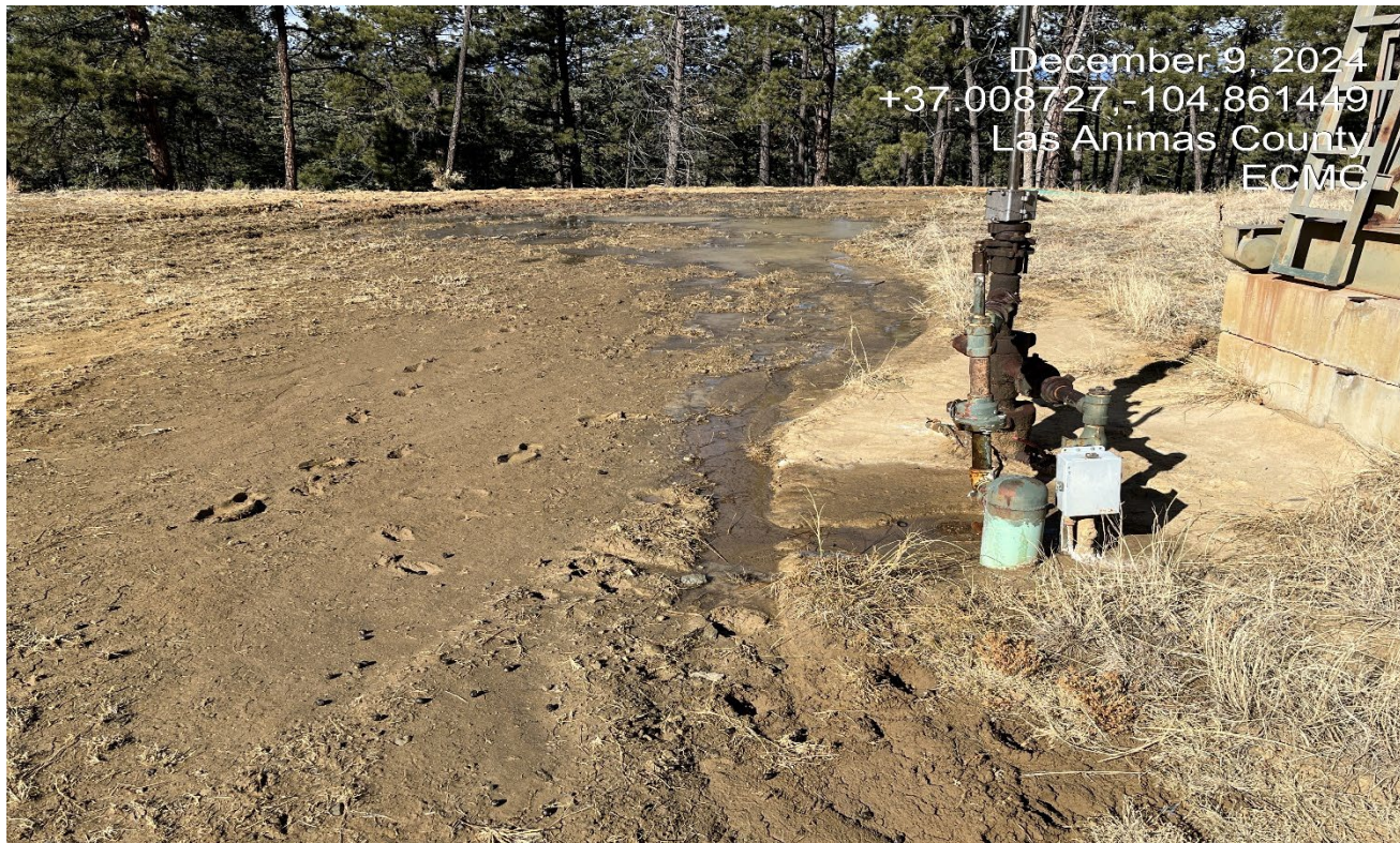
Photo 4. The water was leak out steadily from the wellhead which prompted immediate notification. Operator was seen traveling to the site for repair.