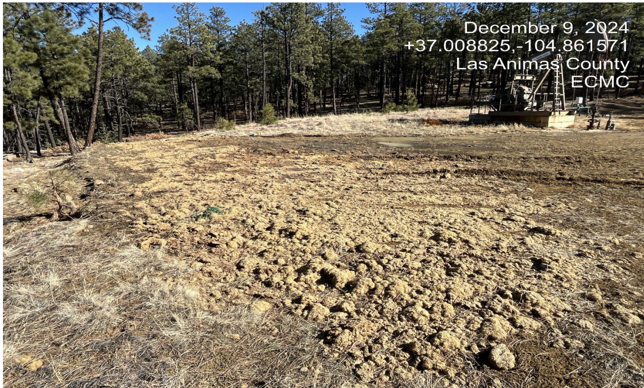
Photo 5. Facing toward the northwest side where erosion had occurred. This area was previously vegetated but soils were pushed to fill in the erosion. The hydro-mulch applied was clumpy with uneven coverage.