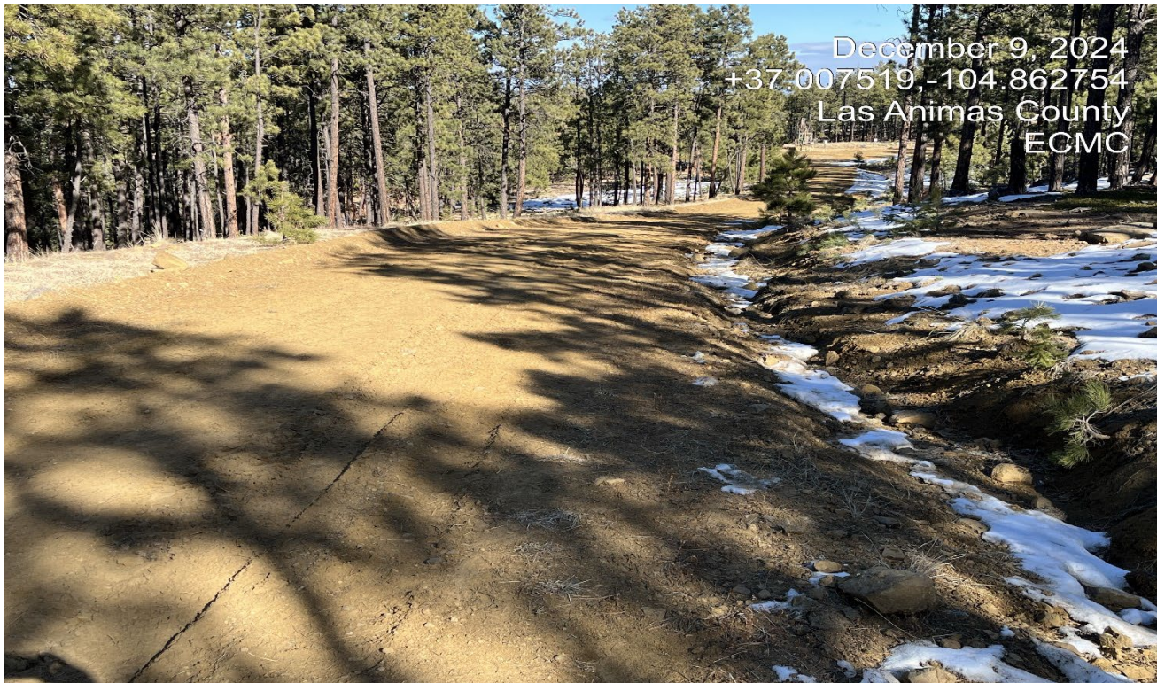
Photo 1. Facing northeast along the access road. There is insufficient BMP's installed along the roadside to prevent erosion.