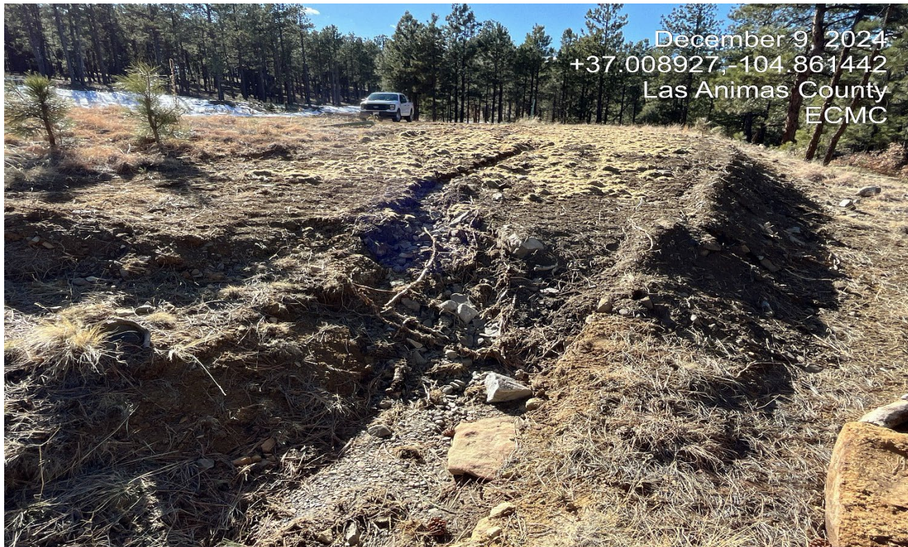
Photo 7. Facing southwest at the location. The loose soils pushed out to this area are susceptible to erosion. A new erosion channel has already developed.