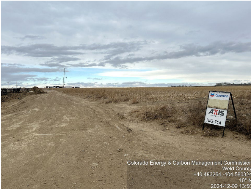
Colorado Energy & Carbon Management Commission Weld County +40.493264, -104.580324 10° N 2024-12-09 13:50