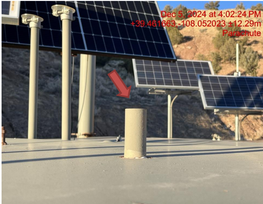
Photo # 0374 PRV vent lines do not comply with CECMC pressure safety device rules