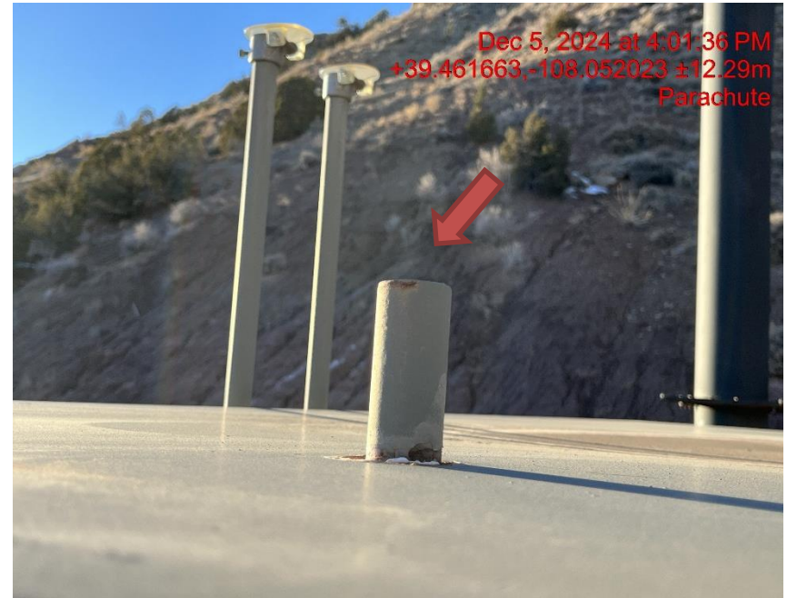
Photo # 0372 PRV vent lines do not comply with CECMC pressure safety device rules