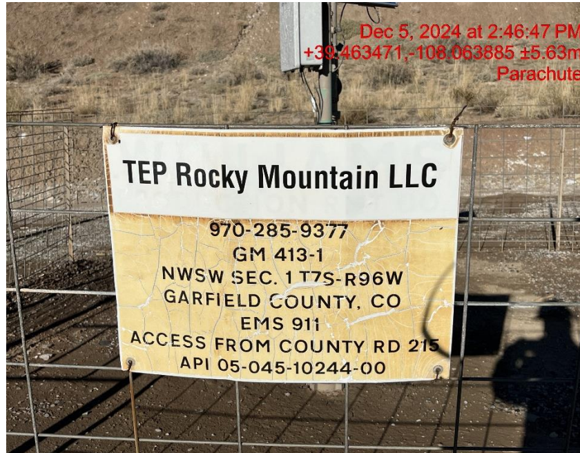
Photo # 0317 Wellhead signs are weathered & cracked and becoming illegible