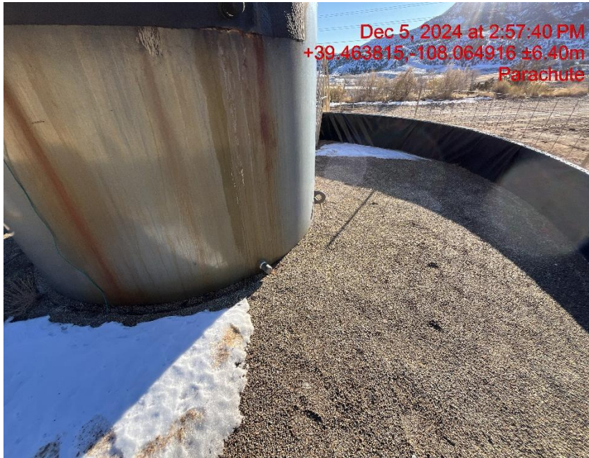
Photo # 0335 Suspected leaks on production tank/tank appears to lack integrity