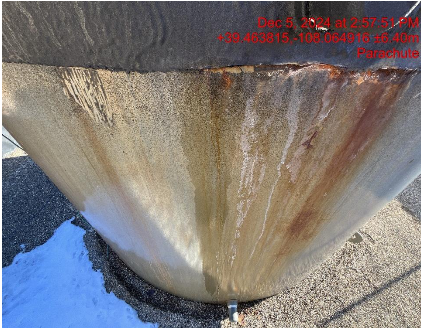
Photo # 0337 Suspected leaks on production tank/tank appears to lack integrity