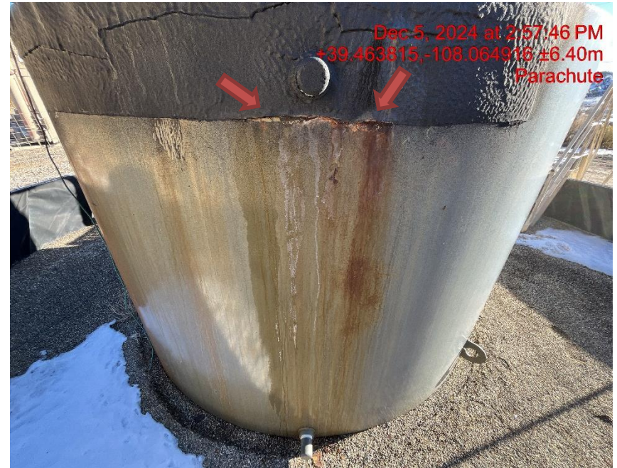
Photo # 0336 Suspected leaks on production tank/tank appears to lack integrity