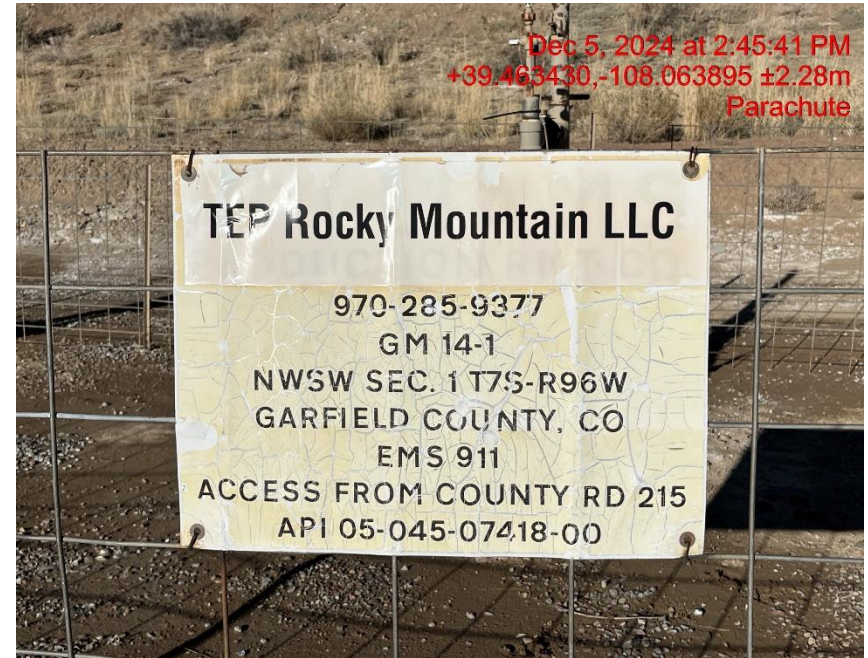
Photo # 0313 Wellhead signs are weathered & cracked and becoming illegible