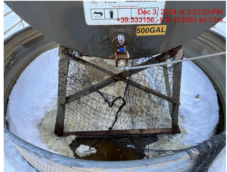
Photo # 0270 Wildlife protection for Methanol tank containment needs maintenance/netting is damaged and open to wildlife