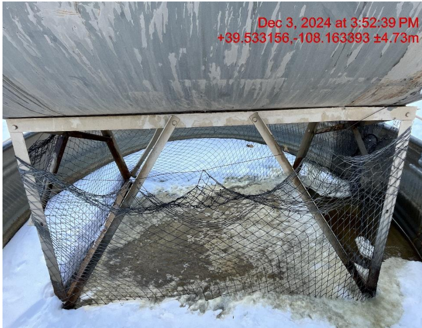
Photo # 0273 Wildlife protection for Methanol tank containment needs maintenance/netting is damaged and open to wildlife