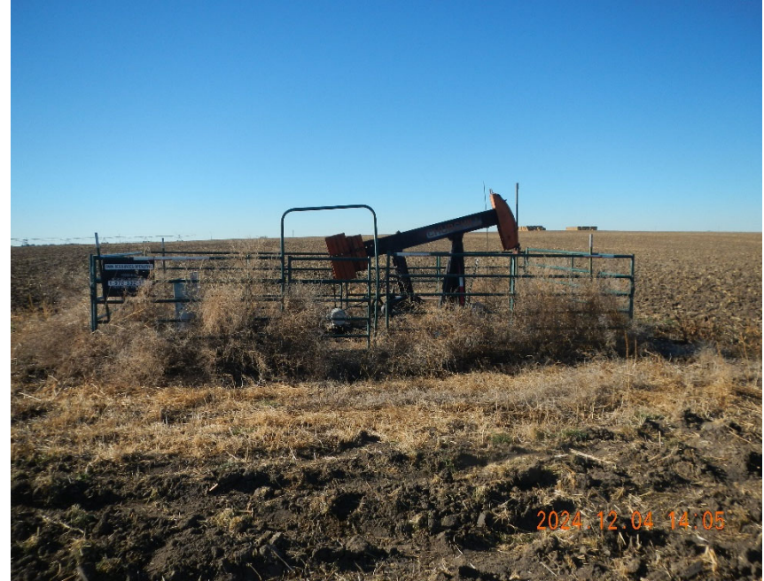
4. Well location overview.