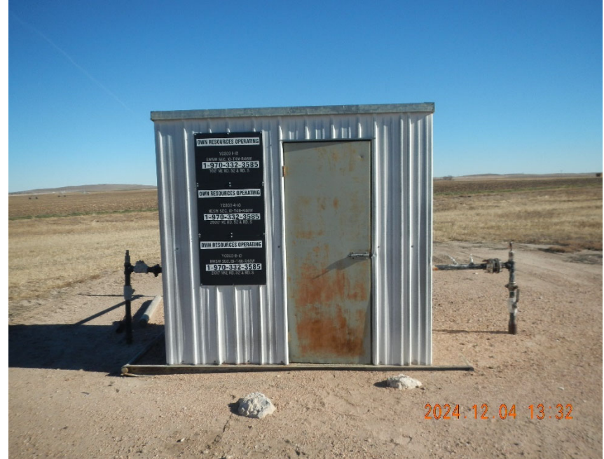
6. View of shared equipment shed.