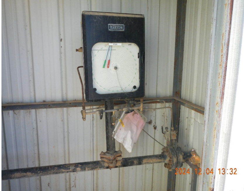
7. Shared gas meter inside shed.