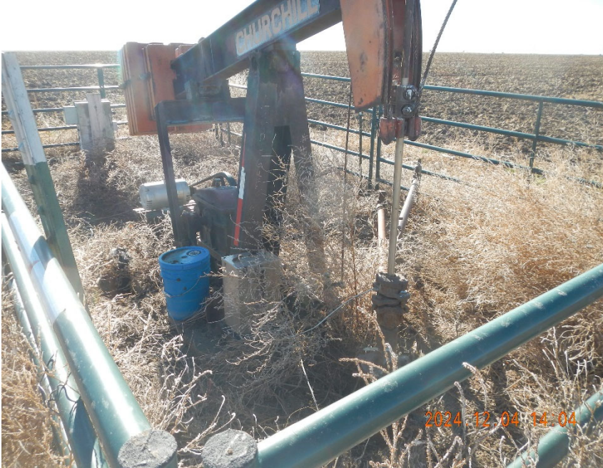
3. View of area inside well fencing.