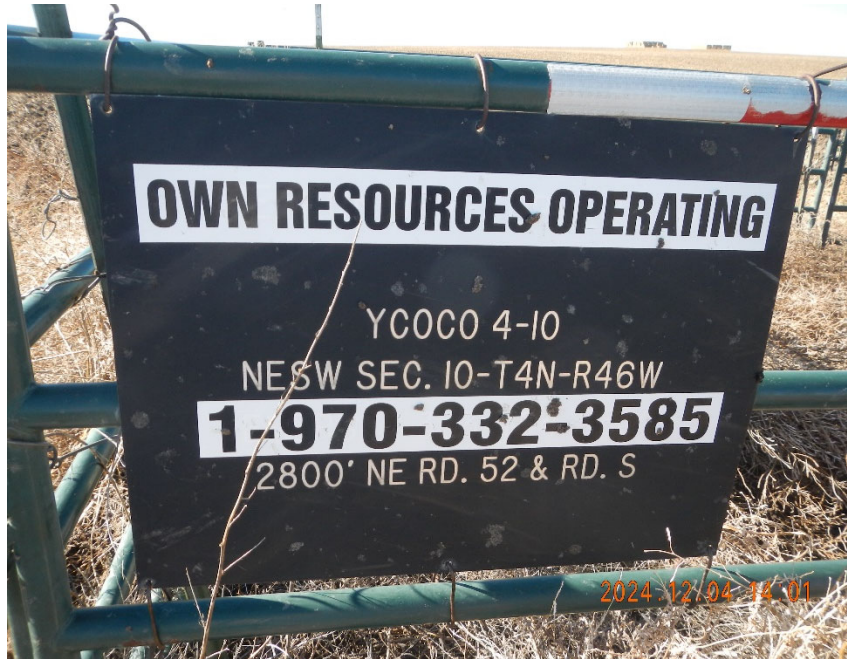
1. Well sign at well location.