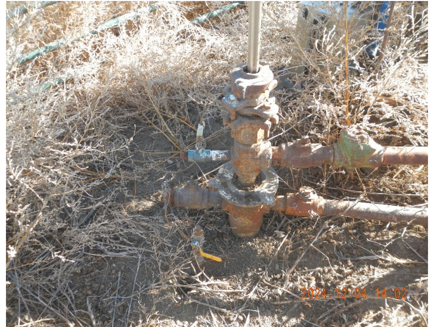
2. View of wellhead. Note dried weeds.