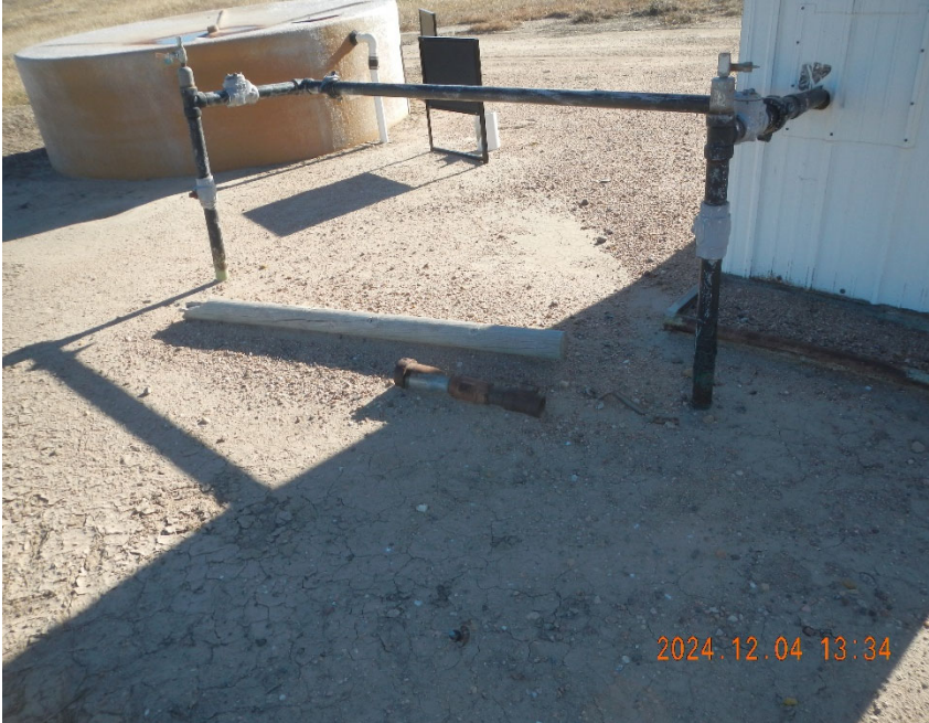
9. Production related debris at remote gathering location.