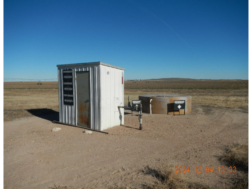
10. Remote gathering location overview.