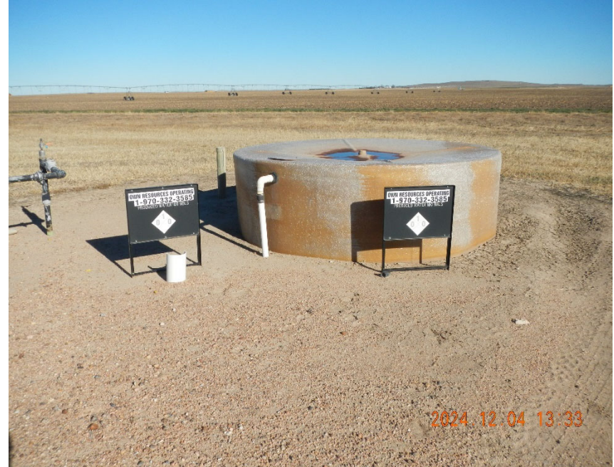
8. View of production tank area at remote gathering location.