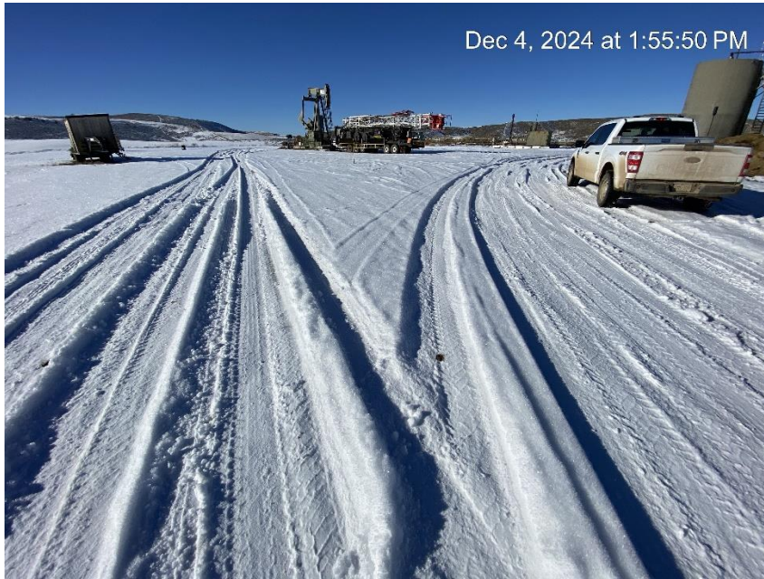
Location from Southeast corner