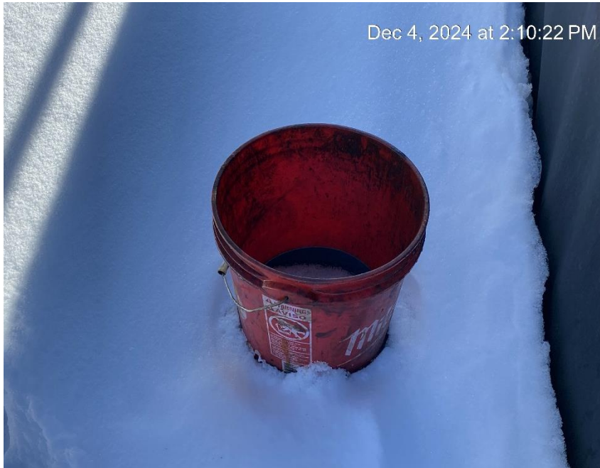
Debris. Open to wildlife.