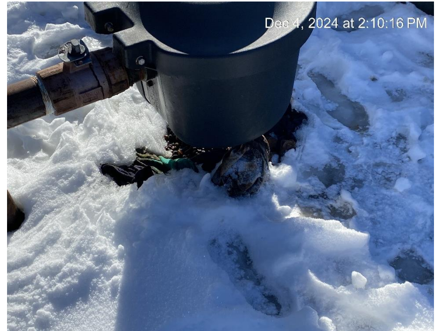
Oily waste and staining