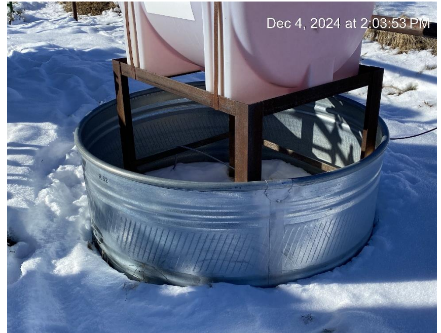
Open to wildlife