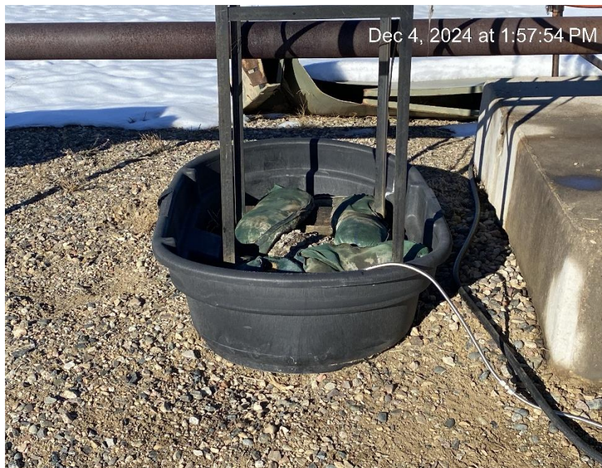
Open to wildlife