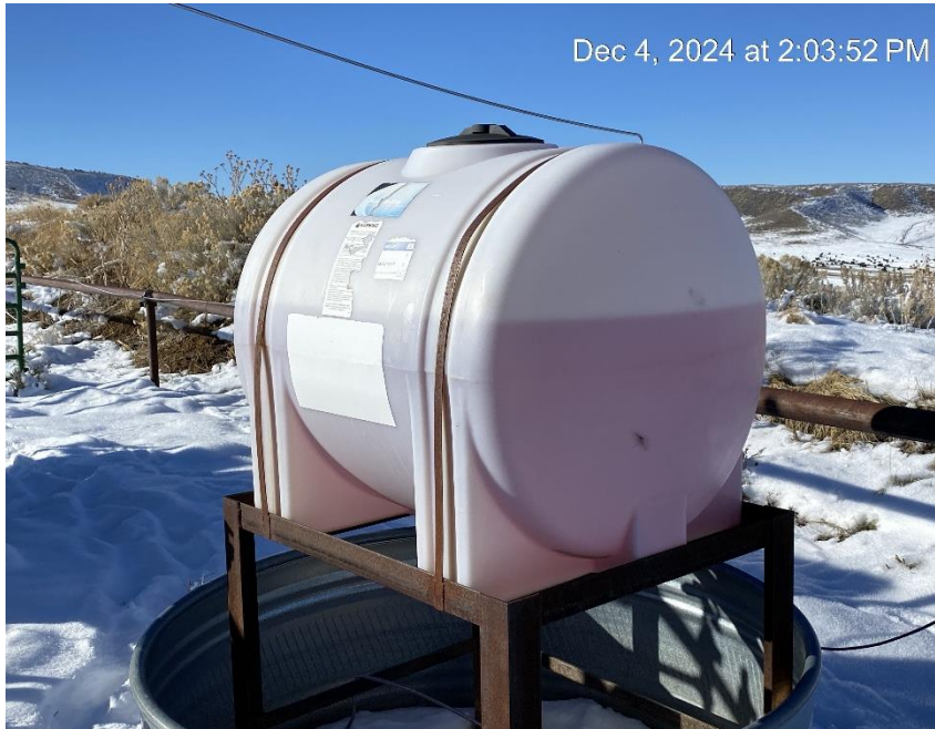
Faded and illegible label