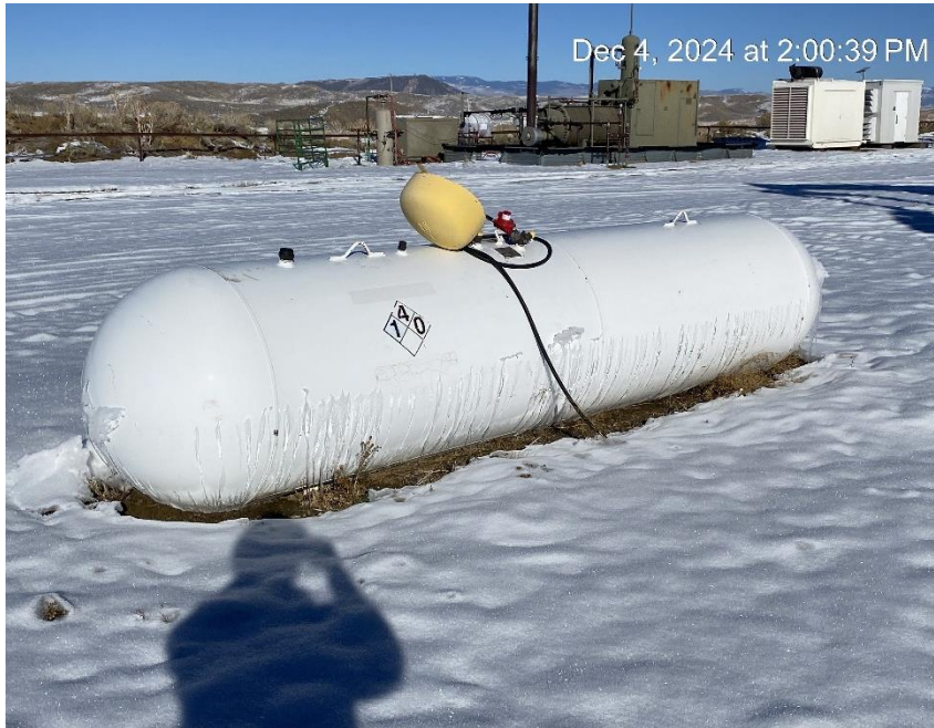
Needs designated label