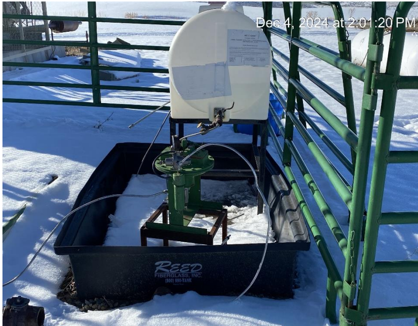
Open to wildlife