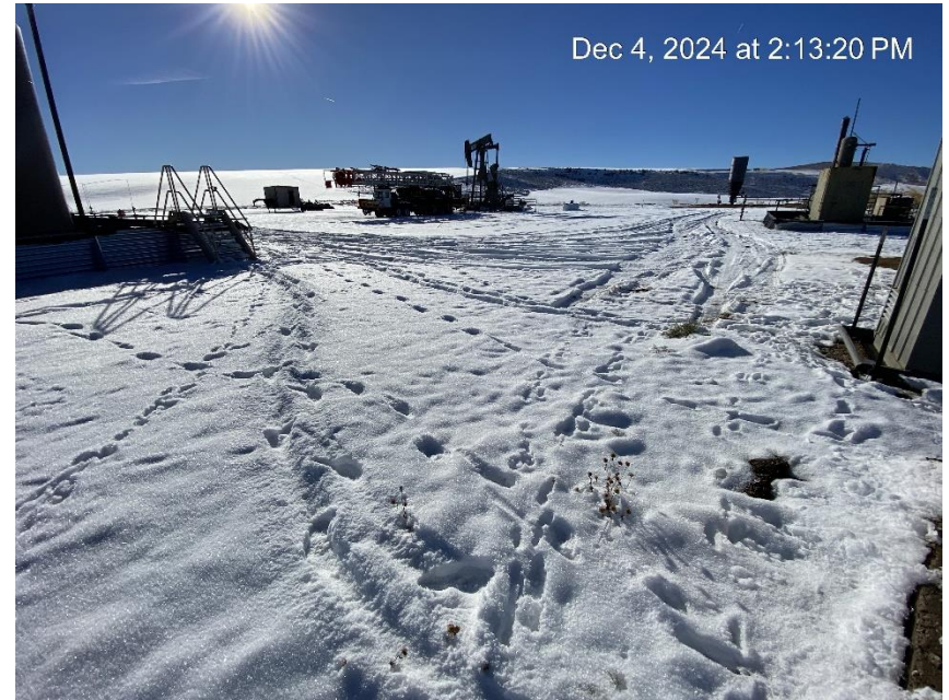
Location from Northeast corner