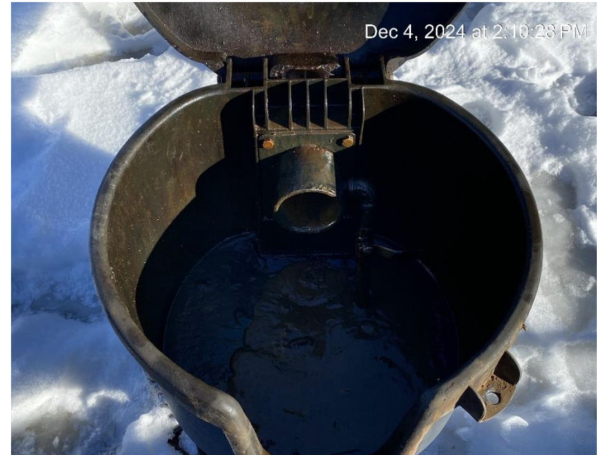
Open end load line. Line is double valved.