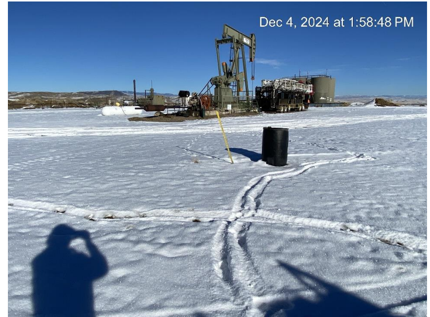
Location from Southwest corner