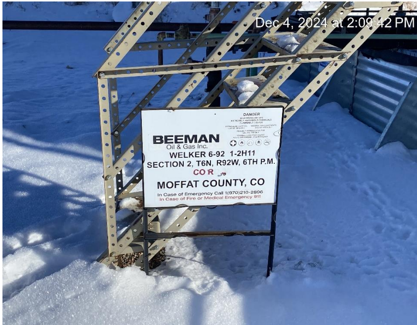
Tank battery sign missing required information