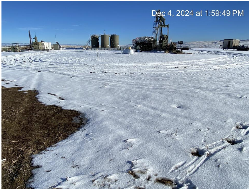
Location from Northwest corner