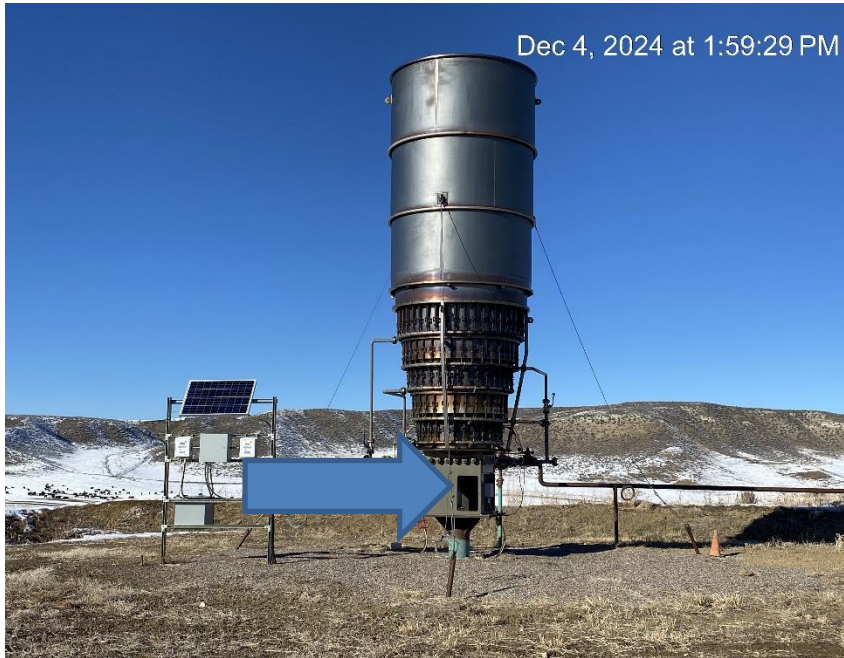
Open to wildlife