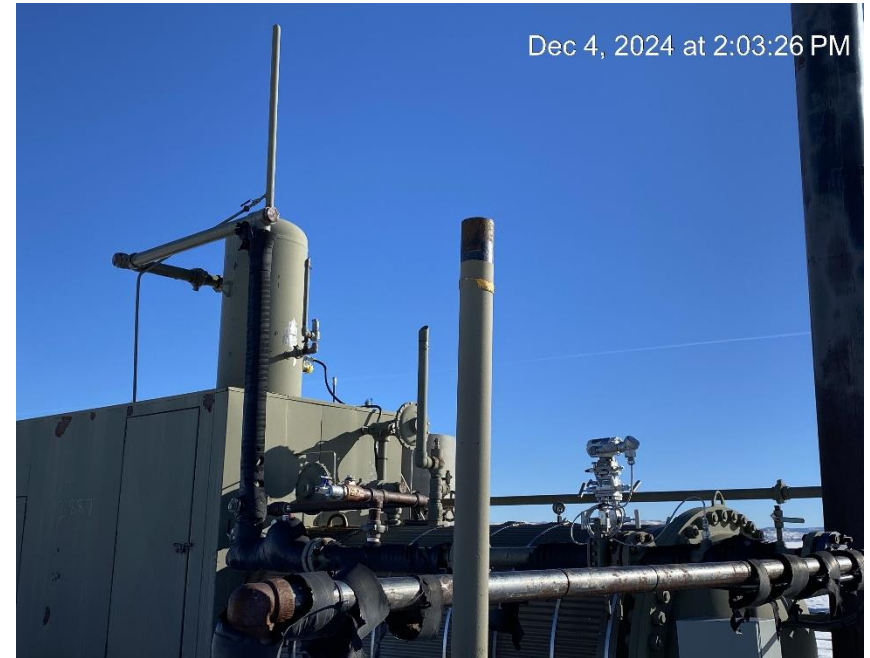
Vent riser missing cap