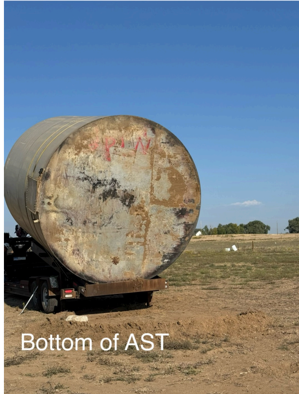
Bottom of AST