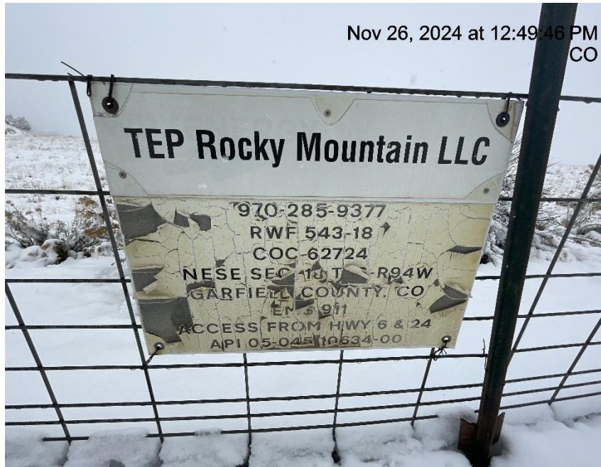
Photo # 1554 RWF 543-18 wellhead sign peeling & some required info starting to become illegible