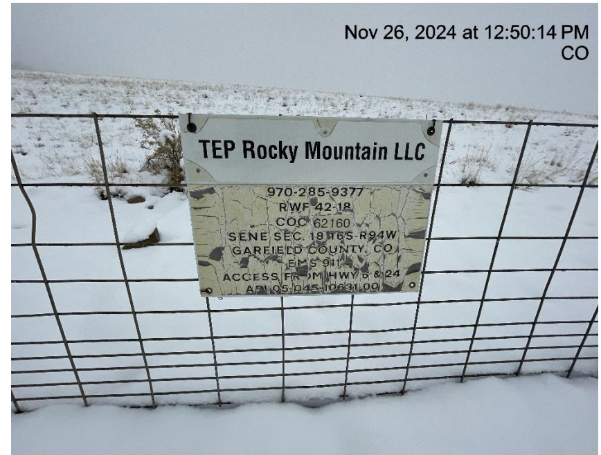
Photo # 1555 RWF 42-18 wellhead sign peeling & some required info starting to become illegible