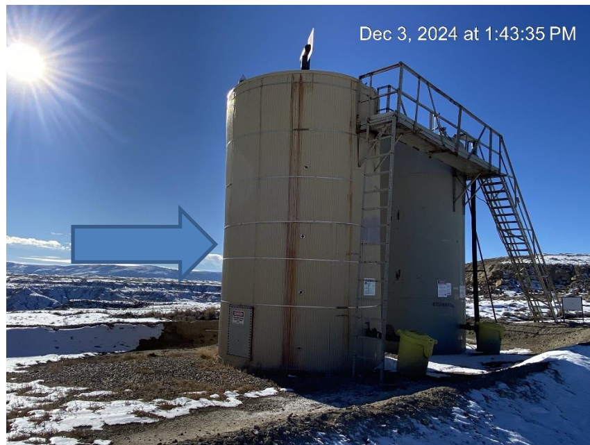
Disconnected and not in use