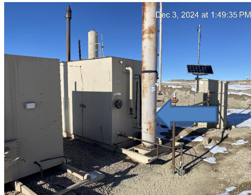
Disconnected and not in use