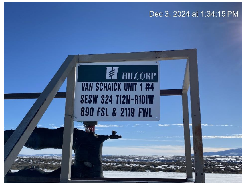
When replaced additional information will be required