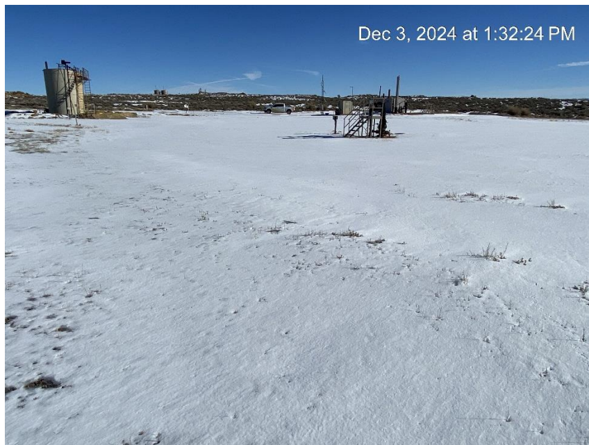
Location from Northwest corner