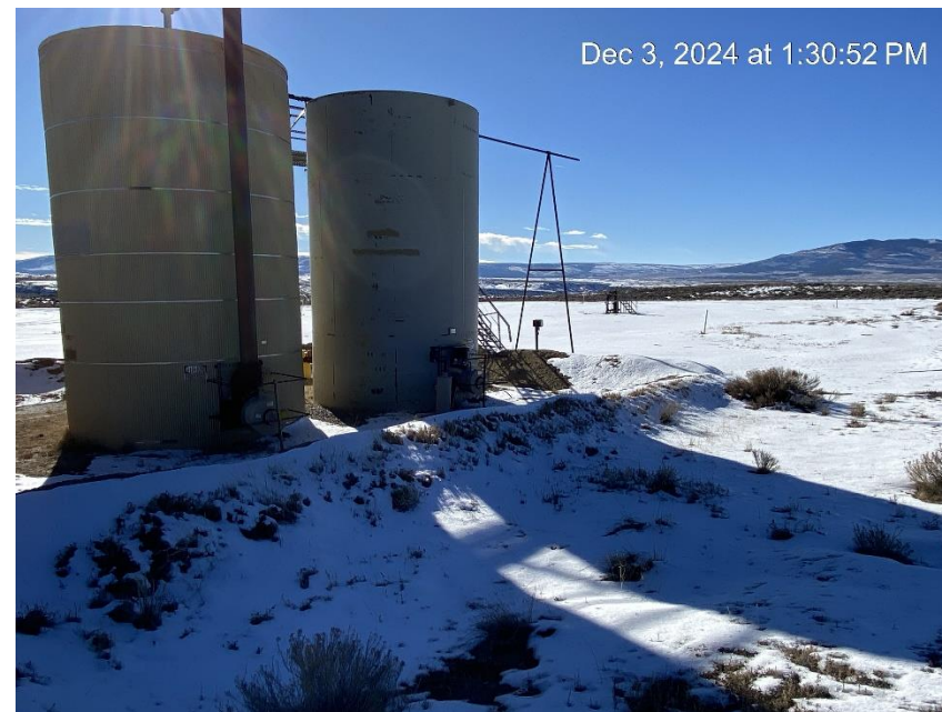
Location from Northeast corner