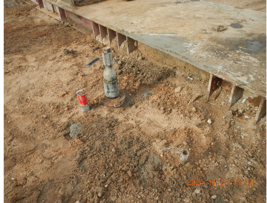
2. Wellhead cemented to surface and SI for 5 day wait for cut and cap work.