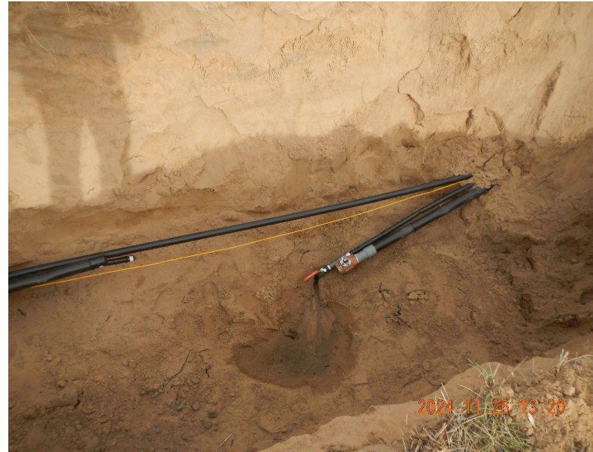
6. Flowlines at Weaver 1-3 excavated and purged for abandonment.