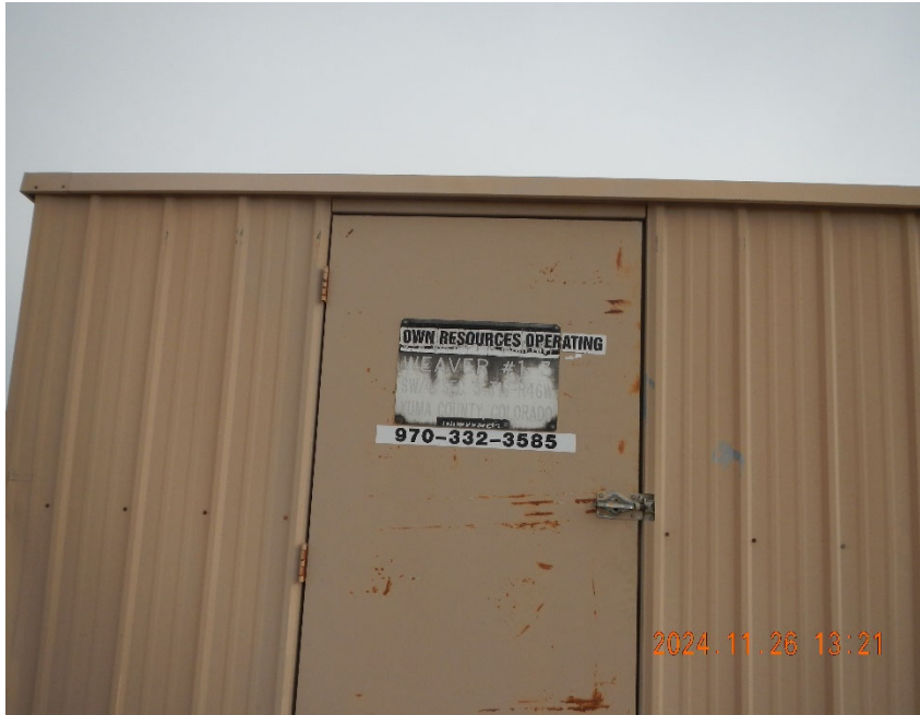
5. Meter shed at Weaver 1-3, 125-07327 where flowline excavation is being done for flowline abandonment.