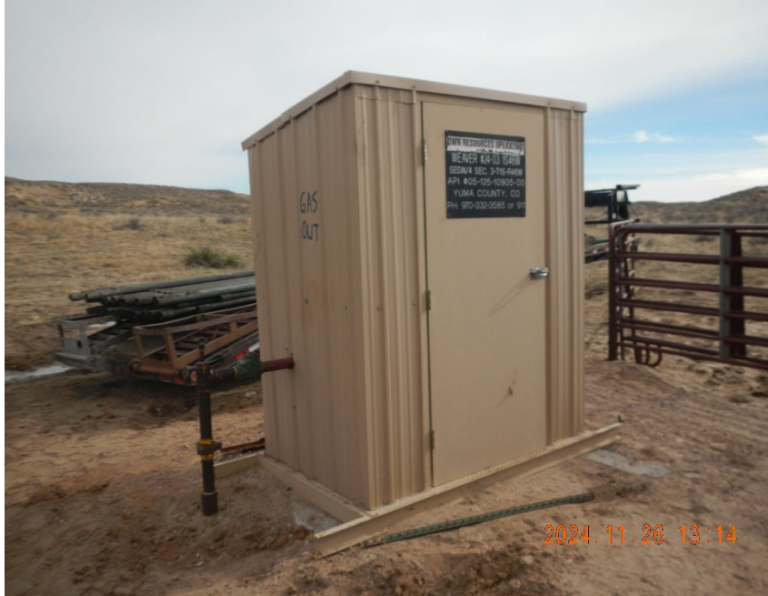
3. Meter shed on well location.