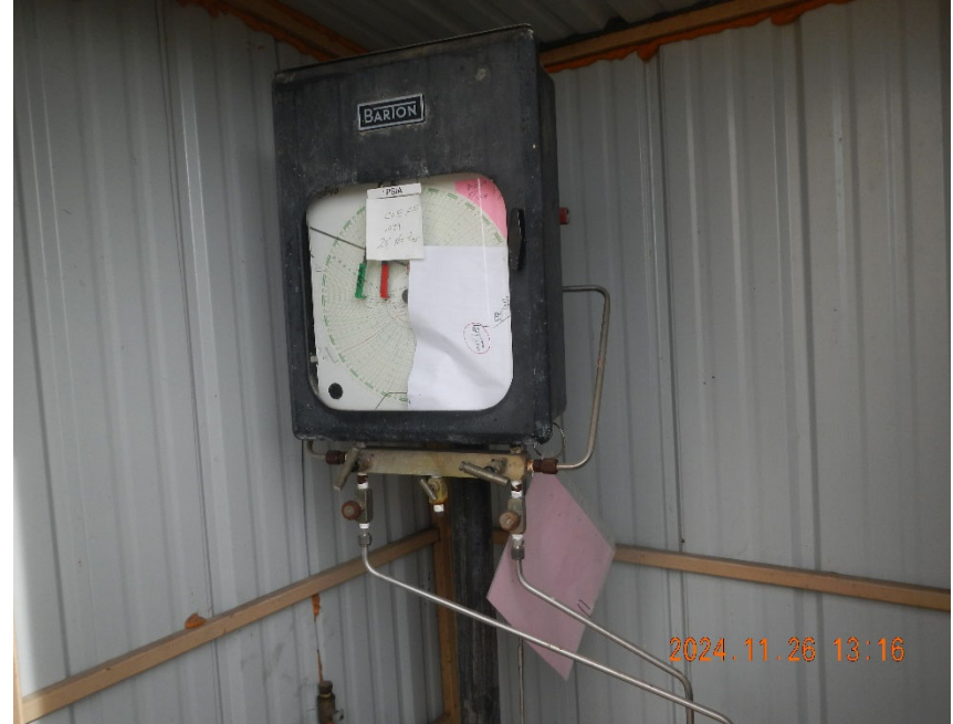
4. Gas meter inside meter shed. Air gapped for P&A.