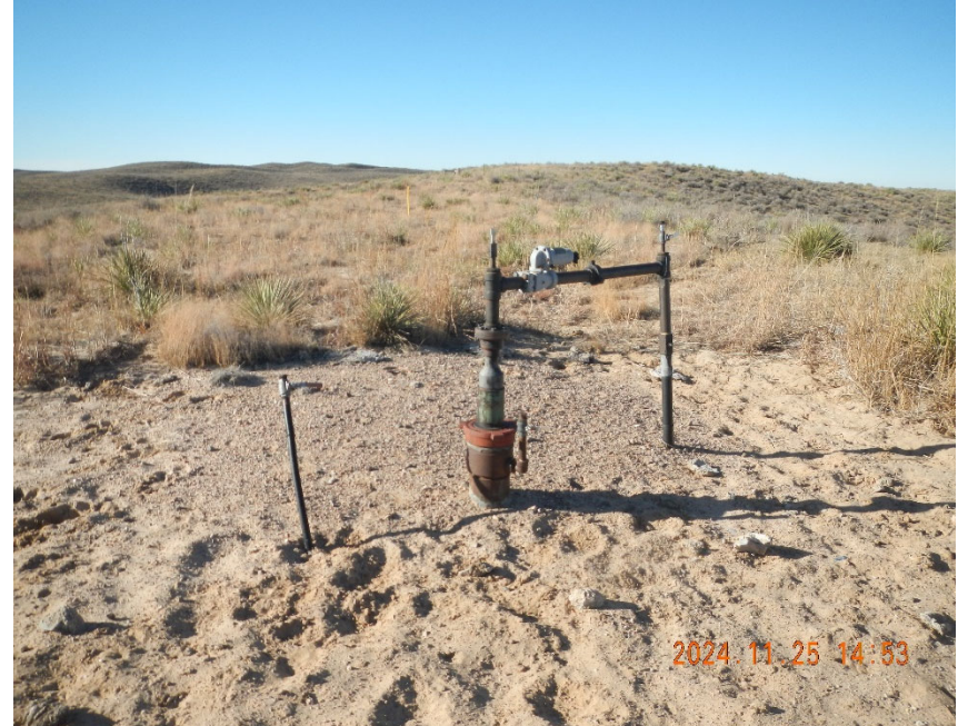
2. View of wellhead.