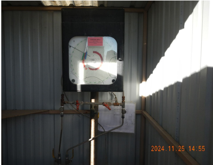
3. Gas meter inside meter shed.