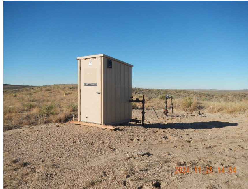
4. Location overview.