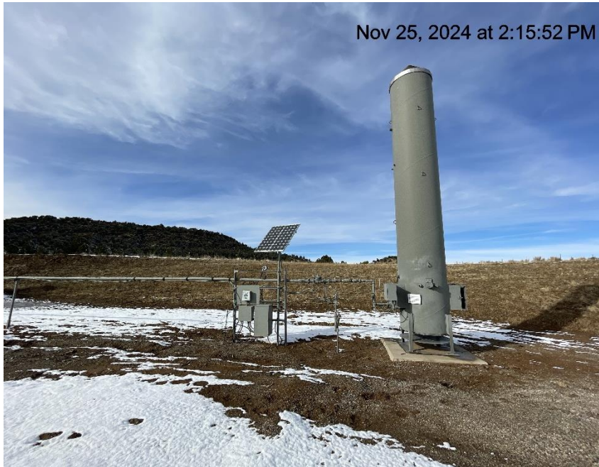
Photo # 1213 ECD not listed in operators FORM 2A or FORM 4 SUNDRY/not in compliance with CECMC rules