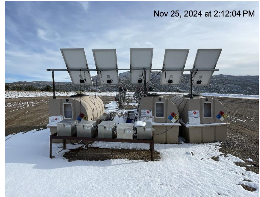
Photo # 1214 Chemical tanks not listed in operators FORM 2A or FORM 4 SUNDRY/not in compliance with CECMC rules