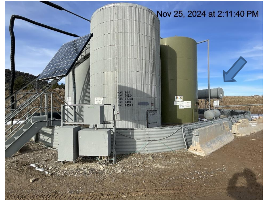
Photo # 1212 - 1000 GAL methanol tank not listed in operators FORM 2A or FORM 4 SUNDRY/not in compliance with CECMC rules