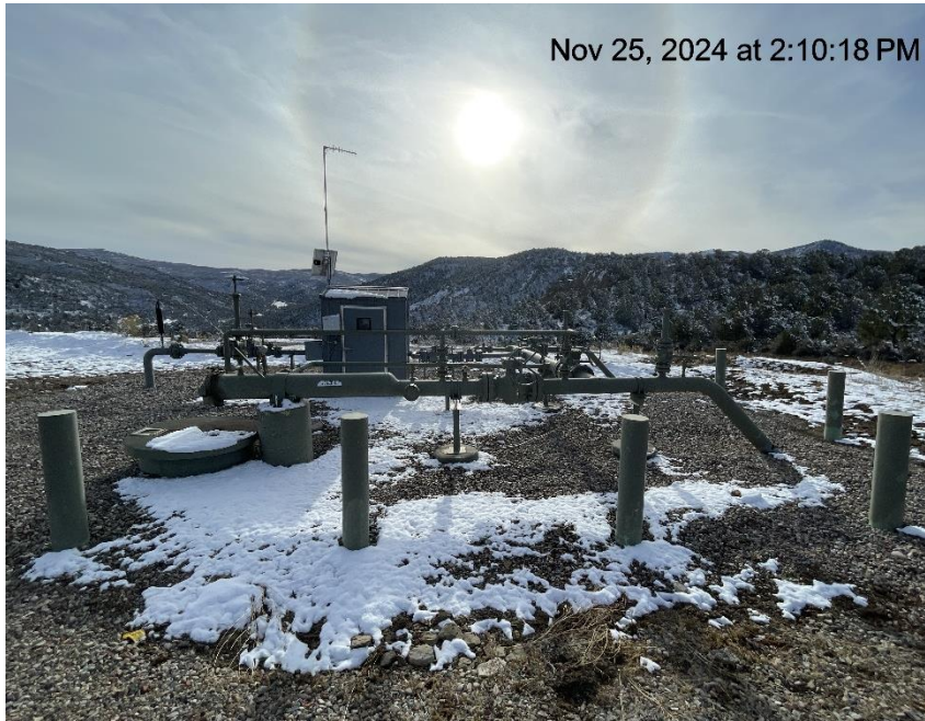
Photo # 1211 Pig station not listed in operators FORM 2A or FORM 4 SUNDRY/not in compliance with CECMC rules