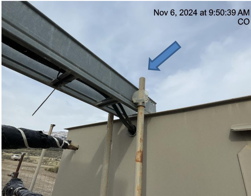
Photo # 9090 From inspection 708904991 conducted on 11/06/2024 PRV vent line does not comply with CECMC pressure safety device rules