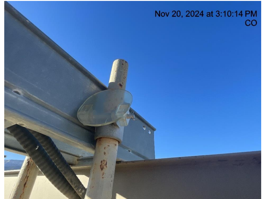
Photo # 491 PRV vent line does not comply with CECMC pressure safety device rules