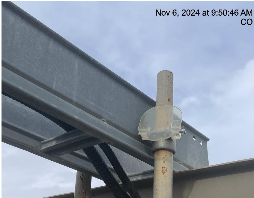
Photo # 9091 From inspection 708904991 conducted on 11/06/2024 PRV vent line does not comply with CECMC pressure safety device rules