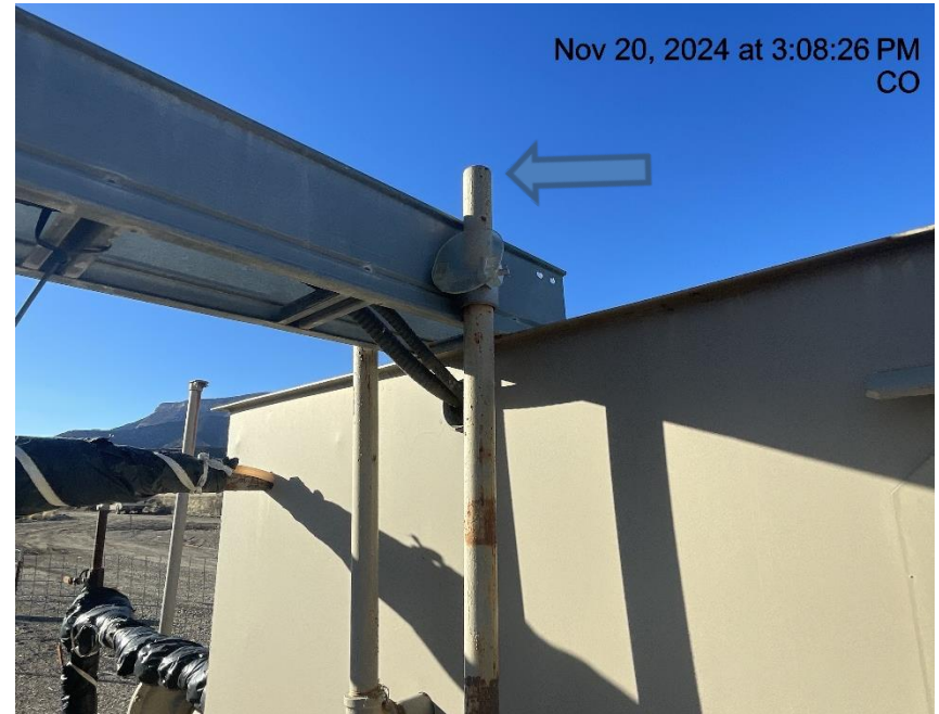
Photo # 490 PRV vent line does not comply with CECMC pressure safety device rules