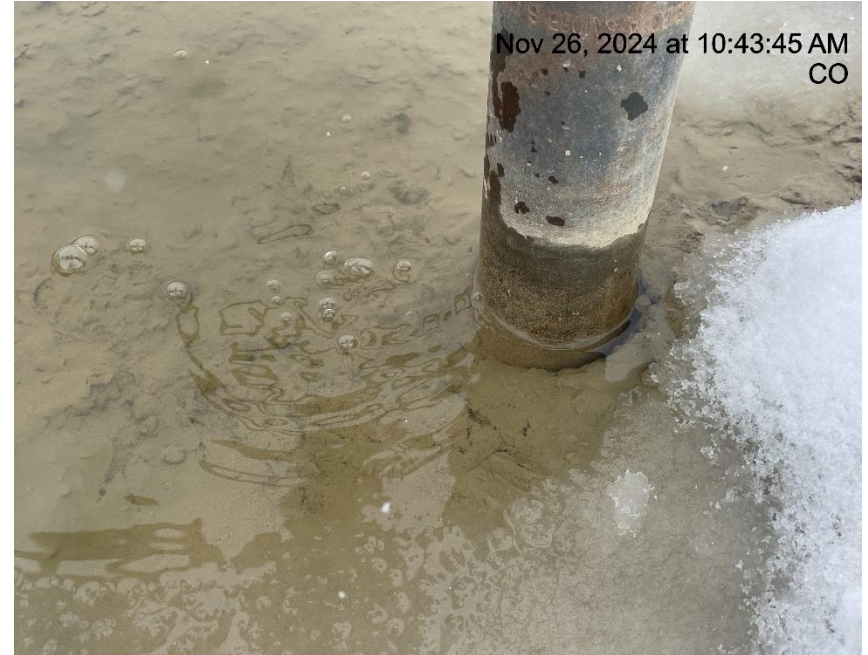
Photo # 1350 Mechanical Condition - possible bradenhead leak on the RMV 33-20 well