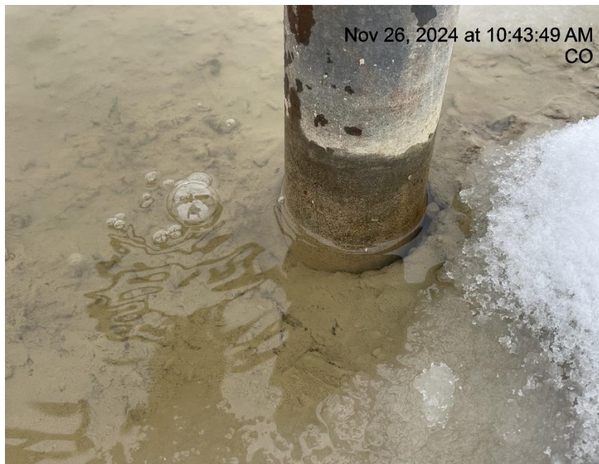
Photo # 1351 Mechanical Condition - possible bradenhead leak on the RMV 33-20 well