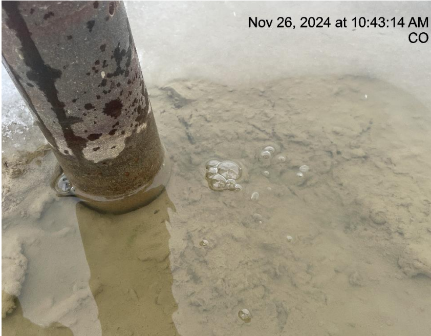
Photo # 1349 Mechanical Condition - possible bradenhead leak on the RMV 33-20 well